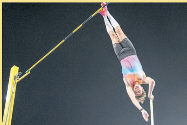
Sweden's Armand Duplantis competes in the men's pole vault event during the Shanghai/Keqiao Diamond League athletics meeting in Keqiao, Shaoxing in China's eastern Zhejiang province on May 16, 2026.

It was only a matter of time before Pogacar attacked, and when he did, it was devastating. □