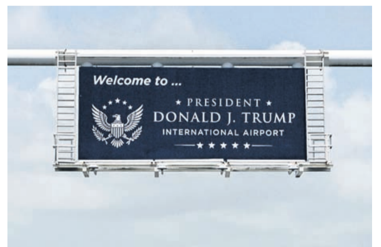
A new welcome sign reading "Donald J. Trump International Airport" is seen at the airport's main entrance ramp in West Palm Beach, Florida, on July 9, 2026.

"The Tennessee license plate used to have a sign on it, or a little motto that said, 'Follow me to Tennessee,'" Bessent said. "Now, everyone