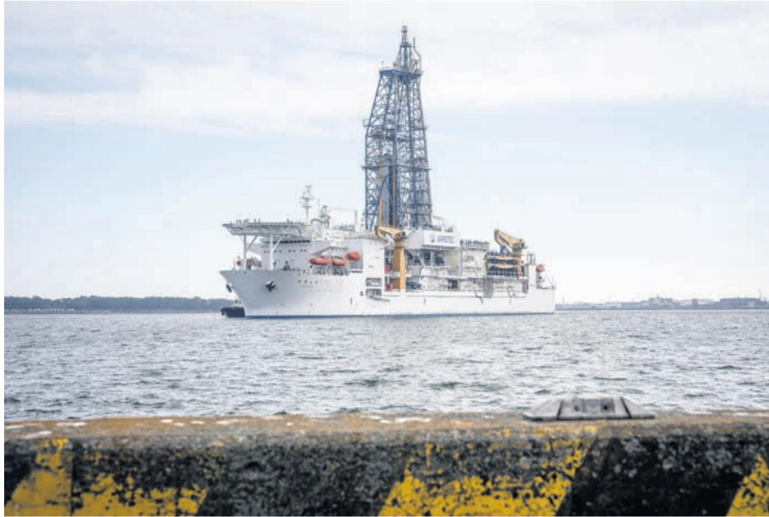
Japan's deep-sea drilling vessel Chikyu returns to Shimizu port in Shimizu, Shizuoka prefecture on February 14, 2026.

Many of them have only been discovered in the past 10 years, "and already face extinction due to human dis-