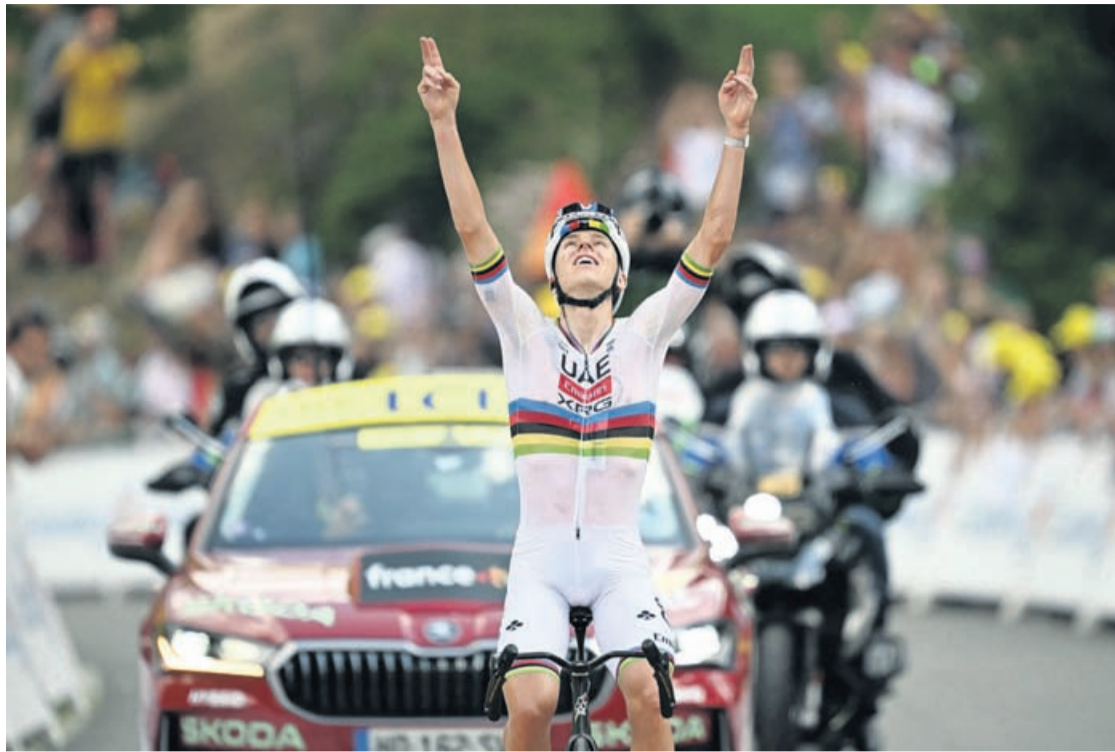
UAE Team Emirates - XRG's Slovenian rider Tadej Pogacar cycles to the finish line to win the 6th stage of the 113th edition of the Tour de France cycling race, 186 km between Pau and Gavarnie-Gèdre in the French Pyrenees, on July 9, 2026.

Norwegian Torstein Traeen had started the day in yellow but he lost contact with the lead group before the halfway point of the punishing Tourmalet climb with around 50 kilometres still to