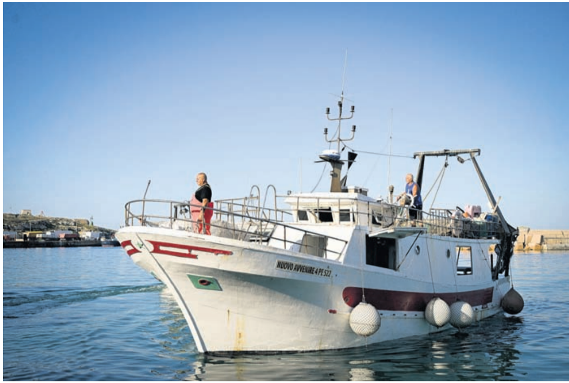
A fisherman stands on the deck of his boat as he arrives to unload his catch from a fishing boat returning to the port of Lampedusa, after a day at sea on July 8, 2026.