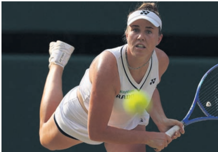
Czech Republic's Linda Noskova returns to Ukraine's Marta Kostyuk during their women's singles semi-final tennis match on the eleventh day of the 2026 Wimbledon Championships at The All England Lawn Tennis and Croquet Club in Wimbledon, southwest London, on July 9, 2026.

London, United Kingdom Karolina Muchova and Linda Noskova will put their friendship on hold when they fight for the Wimbledon title on Saturday after the Czech pair took contrasting paths to their first All England Club final. Muchova saved a match point in a pulsating 6-2, 1-6, 7-6 (12/10) semi-final win