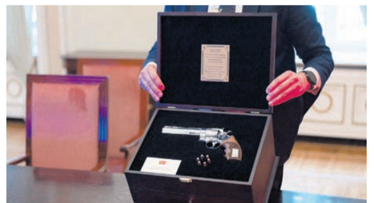
This handout photo taken and obtained on July 9, 2026 from the office of the Lithuanian President shows a revolver offered by Turkish President Recep Tayyip Erdogan to Lithuanian President Gitanas Nausėda with the president's name engraved, including live rounds, and displayed during a press presentation in Vilnius, Lithuania.