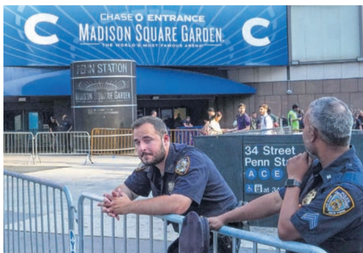
New York City police officers stand guard outside Madison Square Garden in Manhattan, New York on July 2, 2026.

New York, United States $25 for pieces of trash -- including cigarette butts and