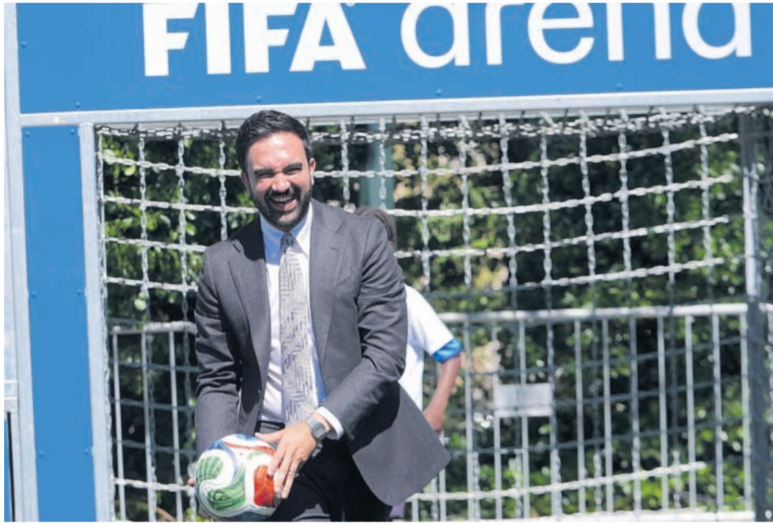
New York City Mayor Zohran Mamdani holds a soccer ball during the FIFA World Cup 2026 Final Watch Party in Central Park Announcement on June 08, 2026 in New York City, U.S.

that are snapped up by for-profit leagues.