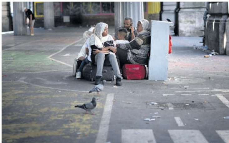
A migrant family sit next to their belongings at a campsite located beneath Line 2 of the elevated metro at La Chapelle station in Paris on July 9, 2026.