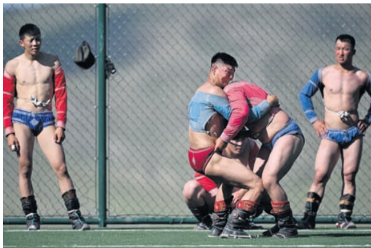
This photo taken on June 24, 2026 shows Mongolian wrestlers sparring as others look on at a training camp ahead of the Naadam Festival on the outskirts of Ulaanbaatar.