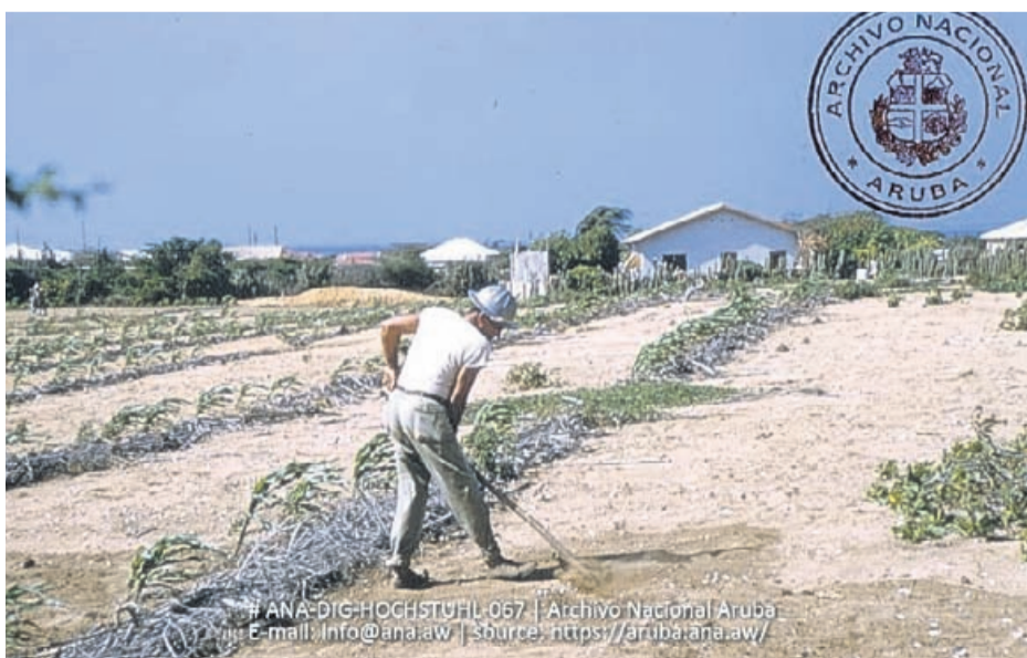
#ANA-DIG-HOCHSTUHL-067