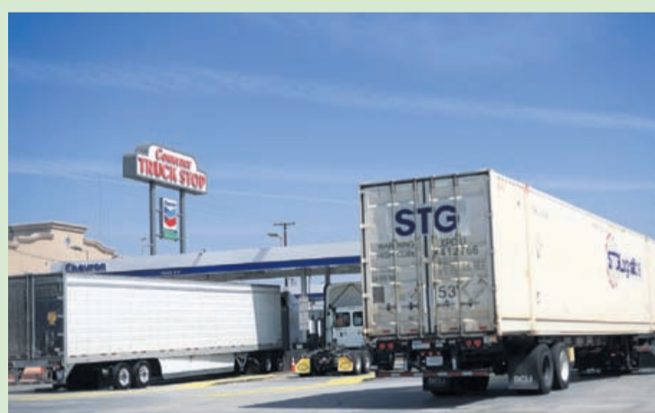
A general view of the Commerce Truck Stop in Commerce, California, on March 26, 2026.