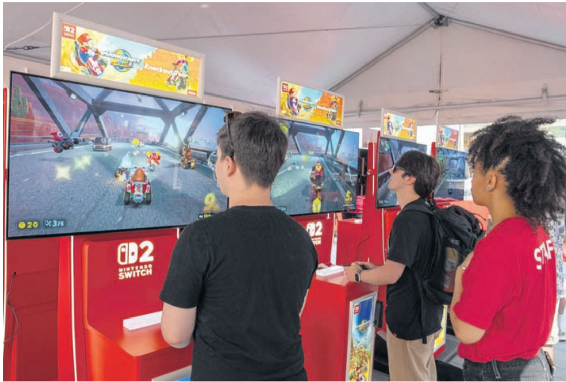
People play Mario Kart World during a launch event ahead of the midnight release of the Nintendo Switch 2 at the Nintendo New York store on June 4, 2025.

As lawmakers in the United States and Europe weigh tougher regulations on screen time, age verifica-