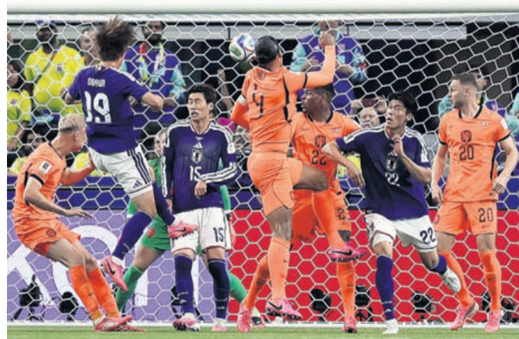
Japan's midfielder #15 Daichi Kamada (2nd L) heads the ball and scores his team's second goal during the 2026 World Cup Group F football match between the Netherlands and Japan at the Dallas Stadium in Arlington on June 14, 2026.