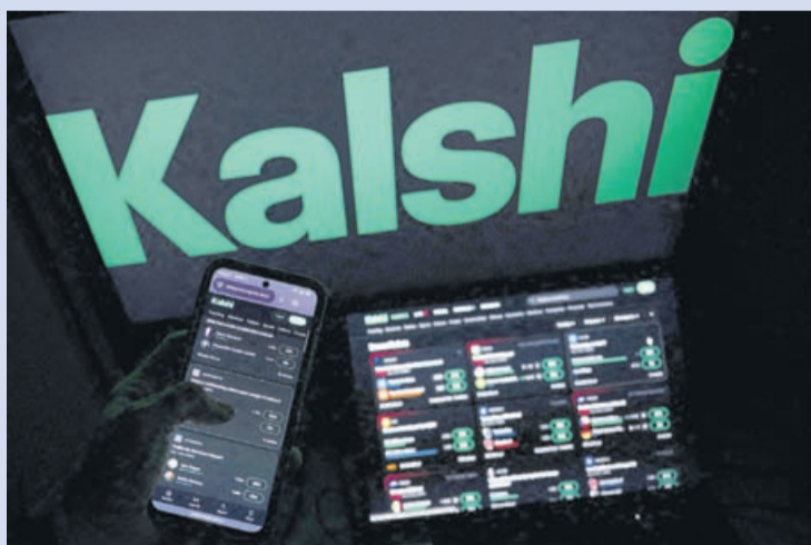
This photograph shows set up screens displaying the logo and home page of U.S. based prediction market platform Kalshi, in Saint-Mande, east of Paris, on April 29, 2026.