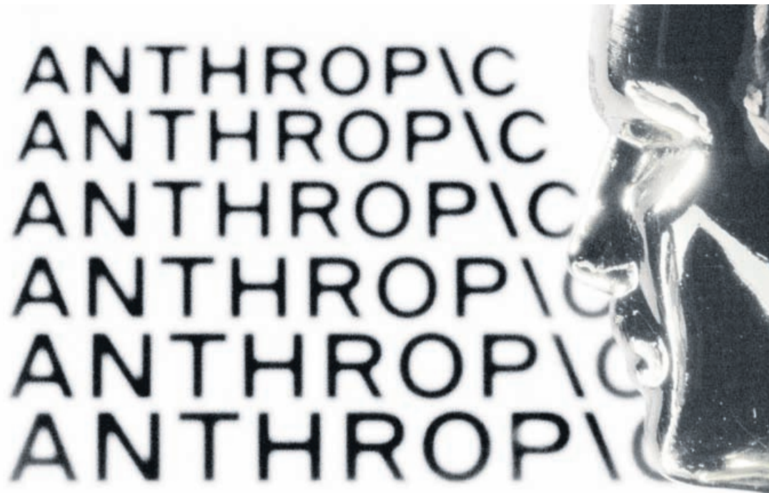
This photograph shows a figurine in front of the logo of the U.S. artificial intelligence safety and research company Anthropic during a photo session in Paris on February 13, 2026.

nization -- whose identity it didn't disclose -- reported