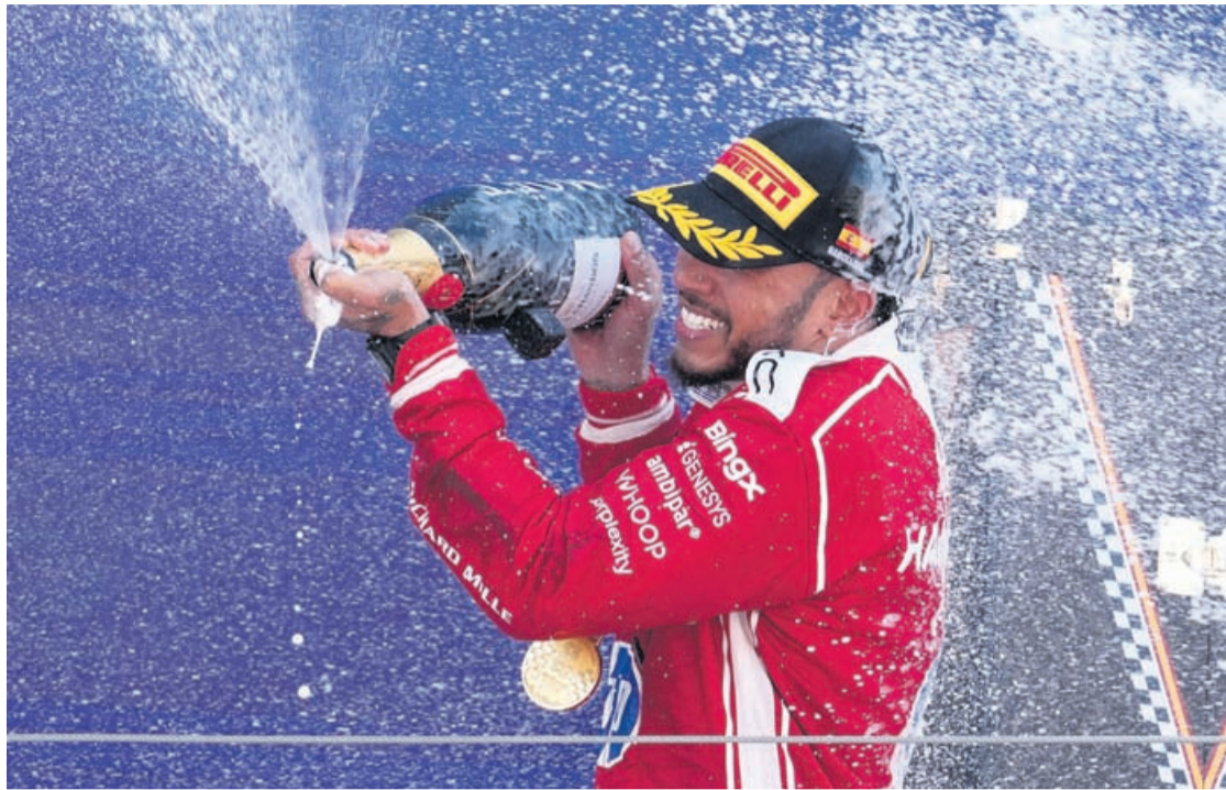
Ferrari's British driver Lewis Hamilton celebrates on the podium after winning the Catalonia Formula One Grand Prix at the Circuit de Catalunya in Montmelo, on the outskirts of Barcelona, on June 14, 2026.

"But then I went through a sequence of unplugging from that 'Matrix', I mentioned a bit last year, and spent lots of time with family, lots of time with friends,