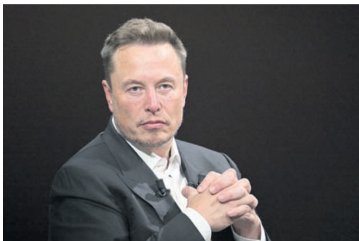
SpaceX, Twitter and electric car maker Tesla CEO Elon Musk looks on as he speaks during his visit at the Vivatech technology startups and innovation fair at the Porte de Versailles exhibition center in Paris, on June 16, 2023.