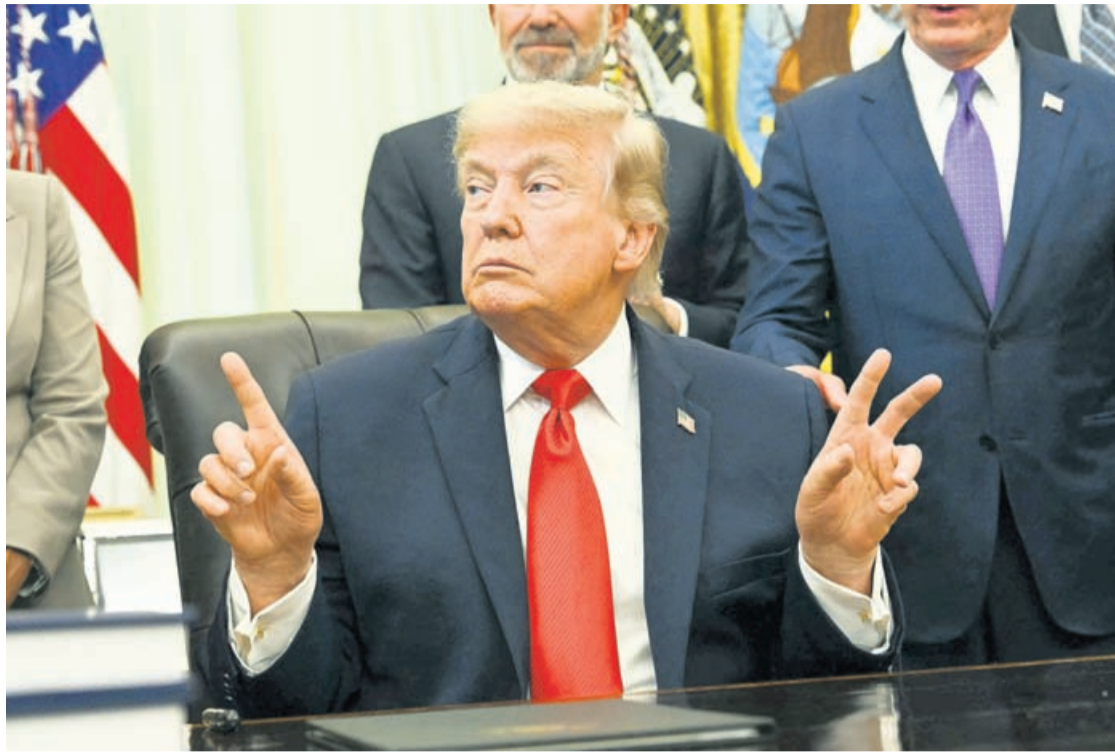
U.S. President Donald Trump speaks before signing a proclamation in the Oval Office of the White House in Washington, DC, on June 11, 2026.

Just hours earlier, Tehran had vowed to retaliate