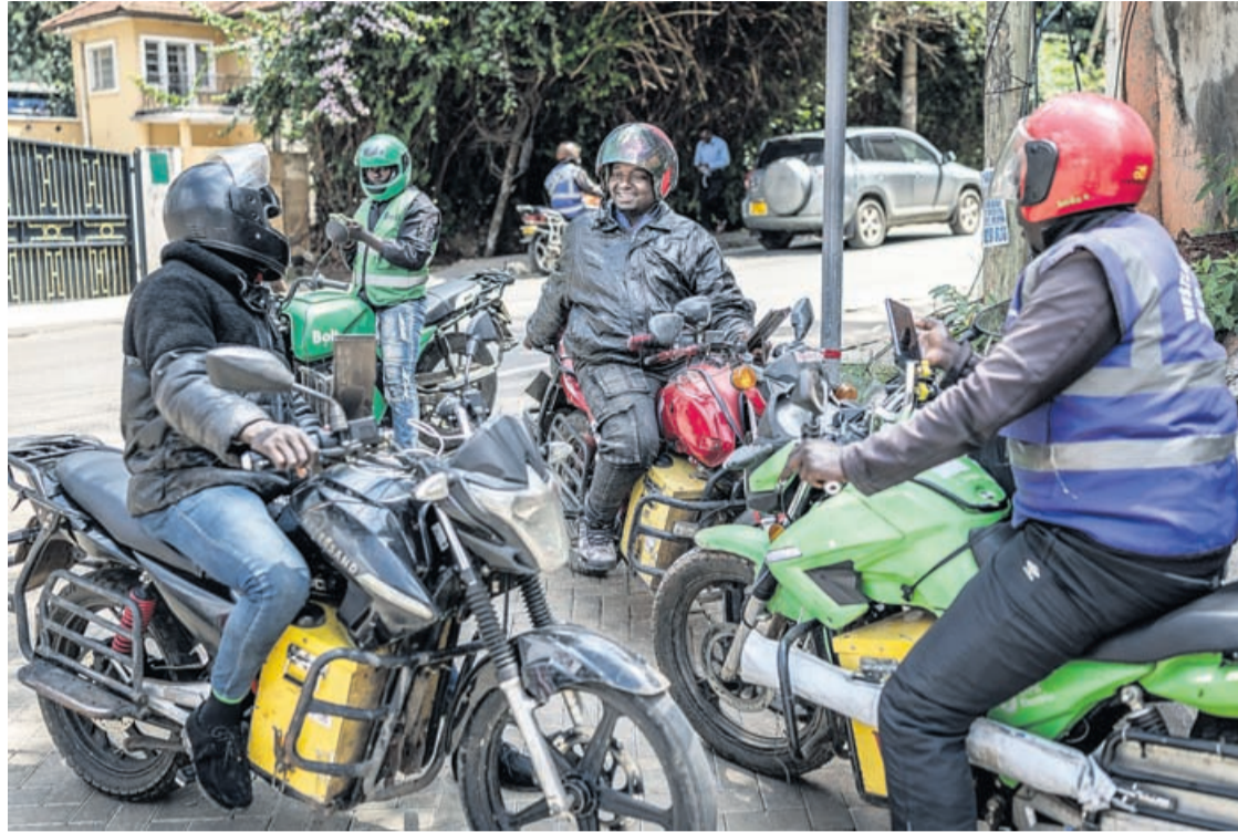
Mototaxi drivers, popularly known in East Africa as boda boda riders, chat while sitting on their electric motorbikes as they wait for customers amid a national fuel price crisis in Nairobi on May 21, 2026.