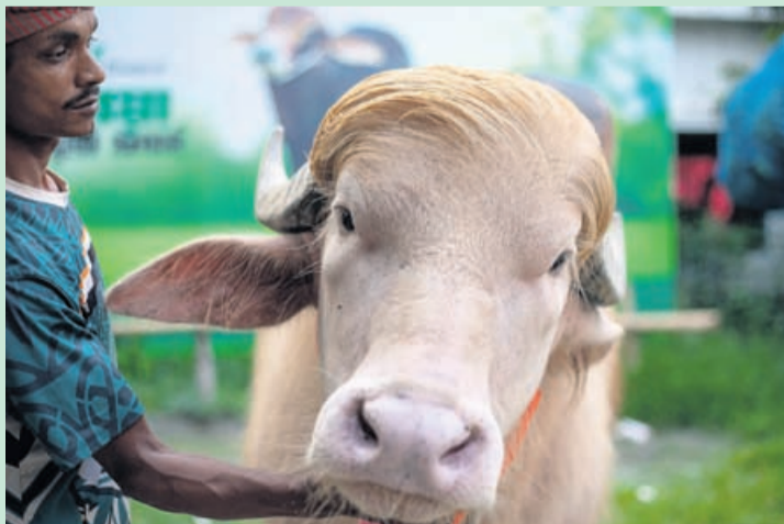
This photograph taken on May 17, 2026 shows a caretaker attending an albino buffalo nicknamed "Donald Trump" for sale ahead of Eid al-Adha at a livestock farm in Narayanganj.

His companions include an aggressive bull named "Tufan", meaning "storm", a generously sized animal called "Fat Boy" and the gentle-natured "Sweet Boy". □