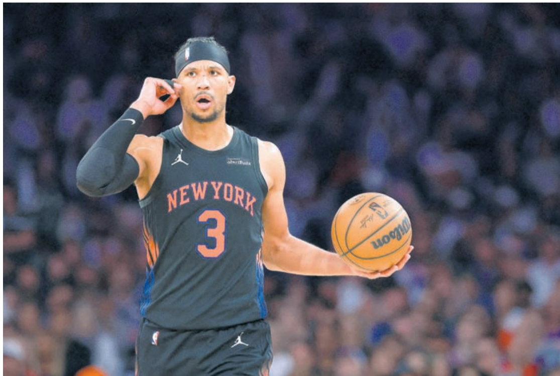
Josh Hart #3 of the New York Knicks dribbles the ball against the Cleveland Cavaliers during the third quarter in Game Two of the NBA Eastern Conference Finals at Madison Square Garden on May 21, 2026 in New York City.

"I'm putting the work in, and it's kind of built that