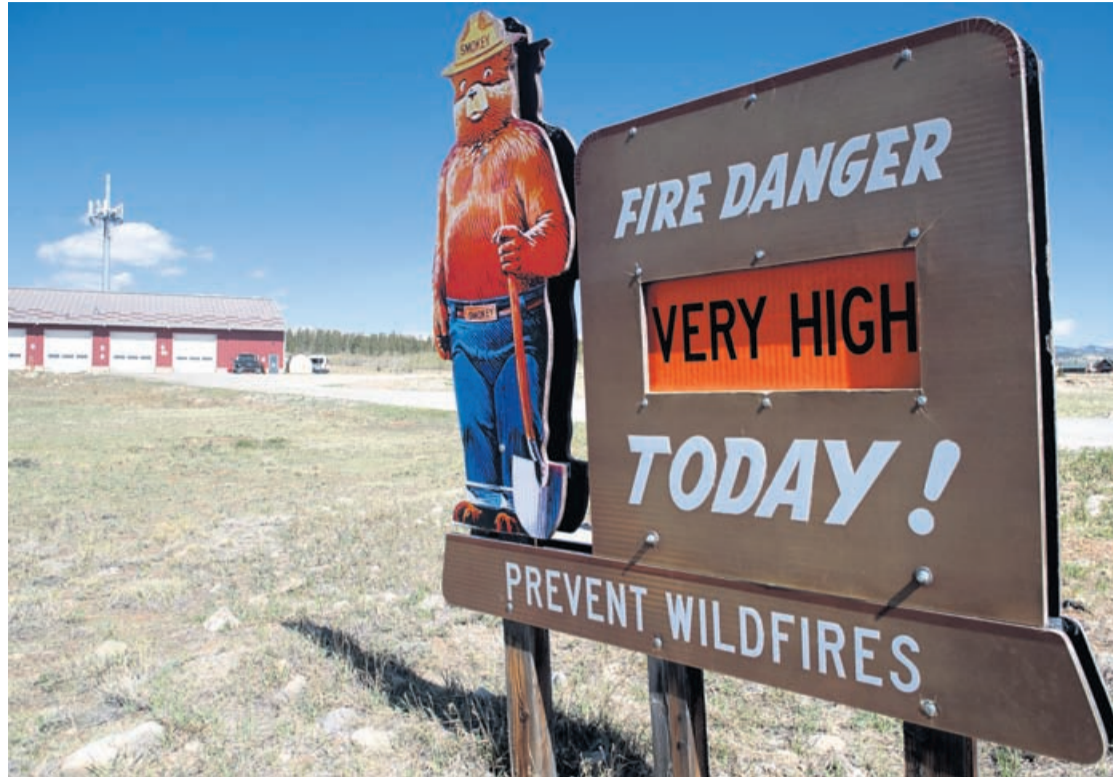
A sign featuring the U.S. Forest Service mascot, Smokey Bear, lists the fire danger level outside the North-West Fire Station #2 in Fairplay, Colorado, on May 14, 2026.