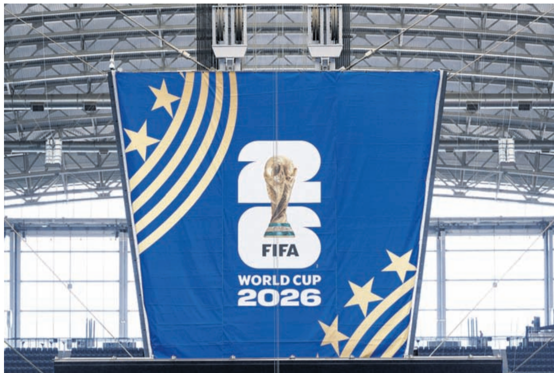
A 2026 FIFA World Cup banner is seen inside AT&T Stadium, which will be called "Dallas Stadium" during the duration of the tournament, in Arlington, Texas on May 18, 2026.