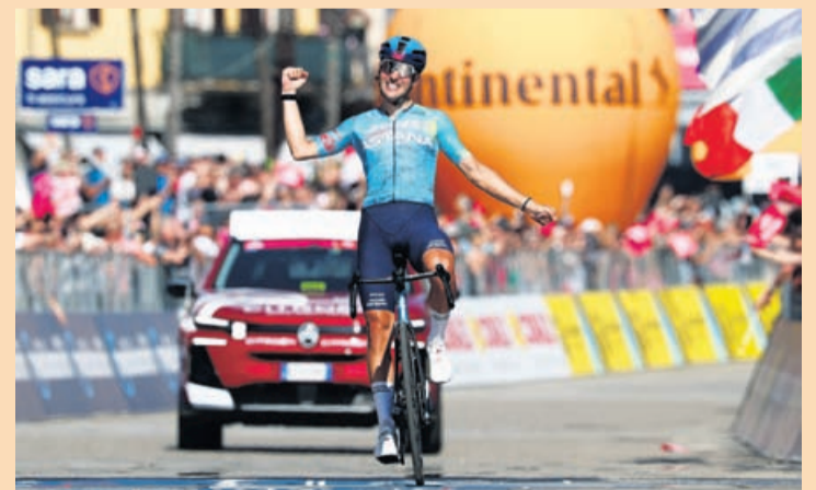
XDS Astana Team Italian rider Alberto Bettiol celebrates as he crosses the finish line to win the 13th stage of the Giro d'Italia 2026 - Tour of Italy cycling race between Alessandria and Verbania, Italy, on May 22, 2026.

plause of the local fans in the town on the banks of Lake Maggiore before the main group crossed the line, with all eyes on what will be a brutal 14th stage on Saturday. □