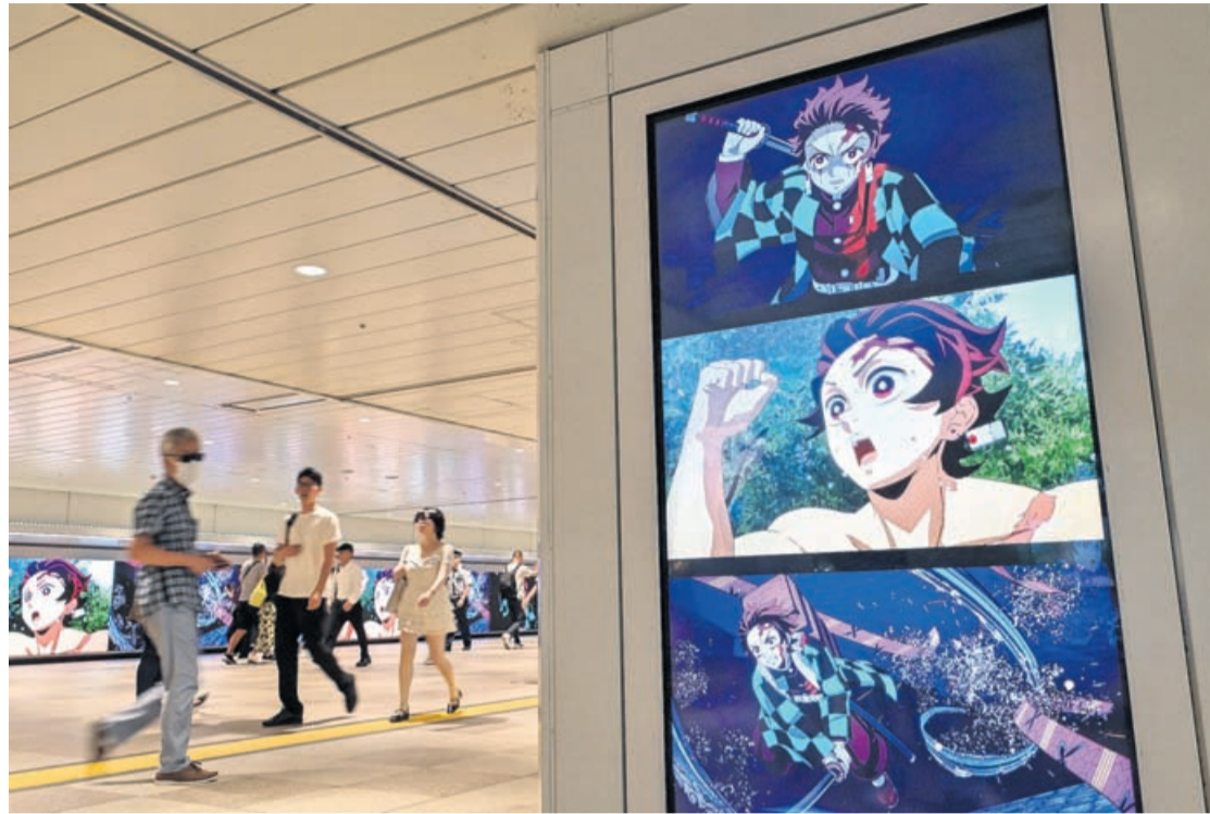
People walk past digital billboards advertising the upcoming release of the video game "Demon Slayer: Kimetsu no Yaiba - The Hinokami Chronicles 2", along a walkway inside a train station in central Tokyo on July 29, 2025.