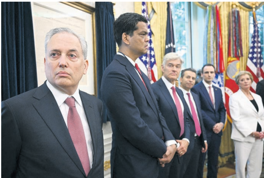
U.S.-South African entrepreneur, author, investor in internet technology firms and White House AI and crypto czar David O. Sacks looks on before U.S. President Donald Trump signs executive orders on pediatric cancer research and AI in the Oval Office of the White House in Washington, D.C., on September 30, 2025.

Politico and other media reported that David Sacks, the Silicon Valley venture capitalist who served as