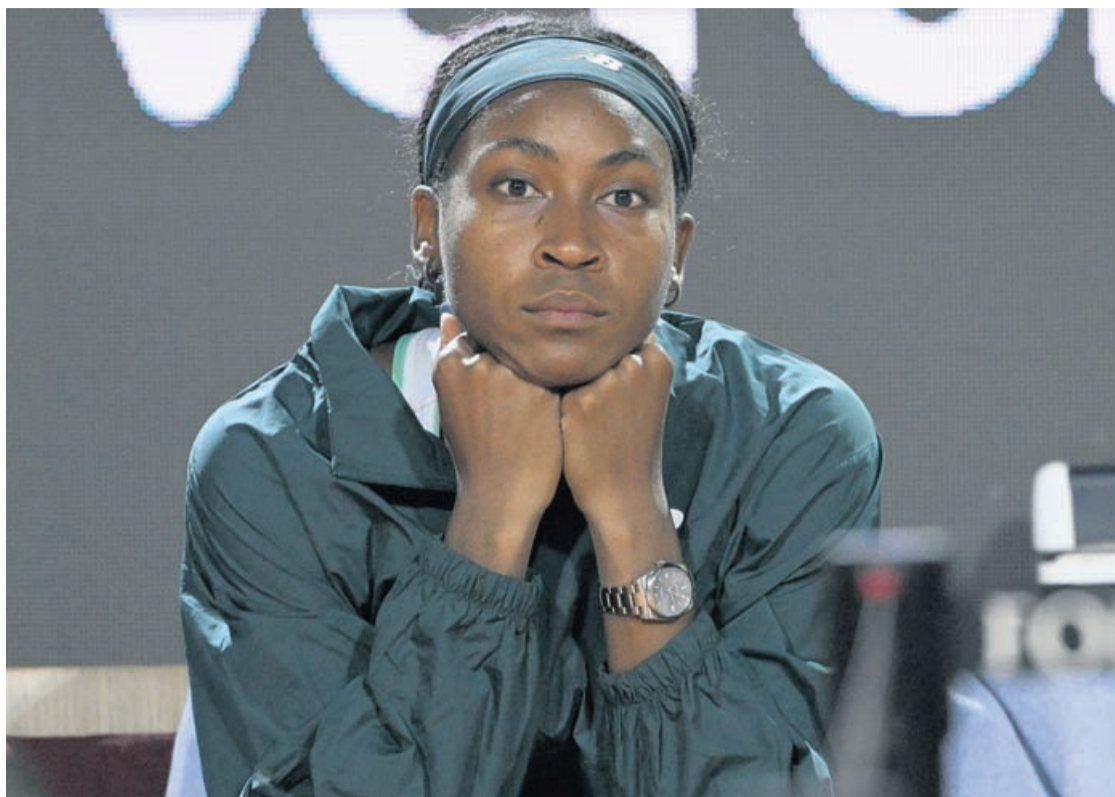
USA's Coco Gauff looks dejected after being defeated during the WTA Rome Open tennis tournament final against Ukraine's Elina Svitolina at Foro Italico in Rome on May 16, 2026.

"I know I play well here. Even if I'm not doing my