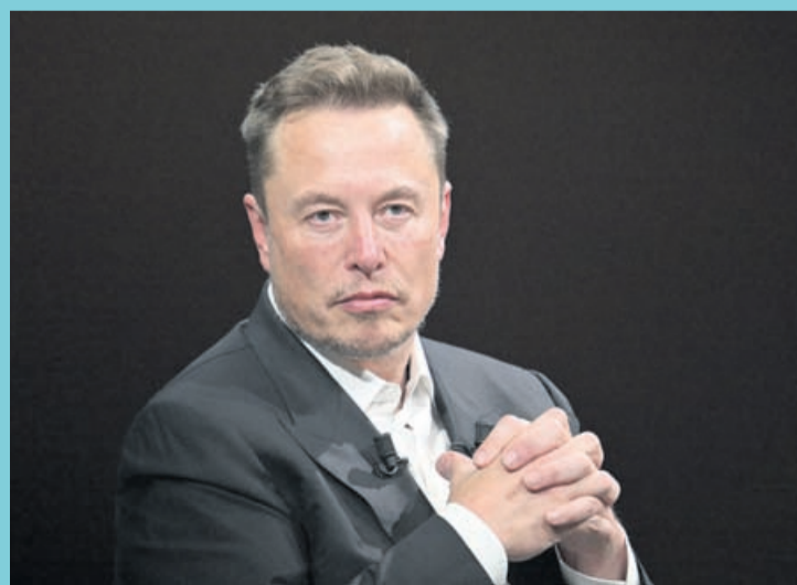
SpaceX, Twitter and electric car maker Tesla CEO Elon Musk looks on as he speaks during his visit at the Vivattech technology startups and innovation fair at the Porte de Versailles exhibition center in Paris, on June 16, 2023.