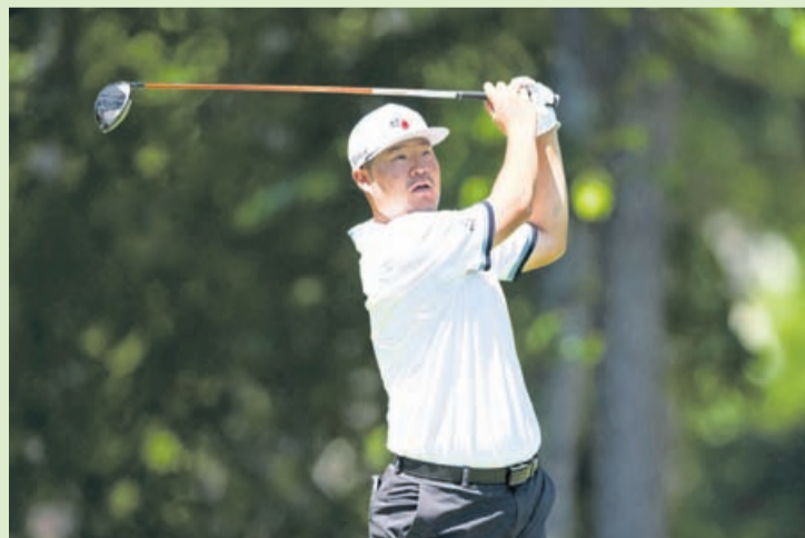
Sungjae Im of South Korea hits a tee shot on the seventh hole during the final round of the Truist Championship 2026 at Quail Hollow Country Club on May 10, 2026 in Charlotte, North Carolina.

"I learn to not give up," he said. "Just keep going." □