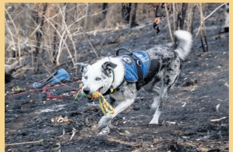
This handout photo from the International Fund for Animal Welfare (IFAW) taken on November 10, 2023, shows Bear, a koala detection dog who recently retired, during a training session at an unknown location.

-- including an Animal of the Year award and Puppy Tales Photos Australian Dog of the Year award. □