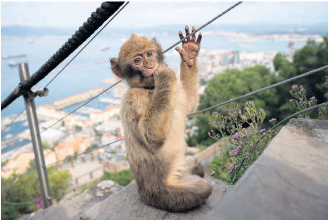
A young Barbary macaque ( Macaca sylvanus ) is pictured in Gibraltar on May 6, 2026.

Gibraltar, United Kingdom A colony of macaques that gorge on snacks offered by tourists in the British territory of Gibraltar swallow soil to recover from their junk food binges, a study has found.