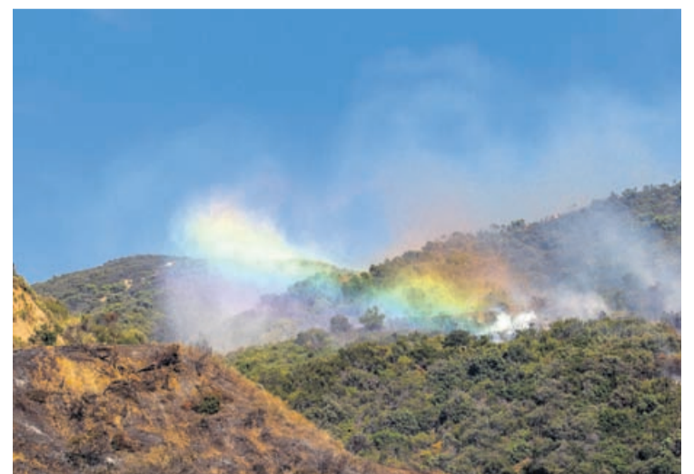
A spray rainbow is seen after a Los Angeles County helicopter dropped water on a hotspot as the Sandy fire continues to burn in the hills near a residential area in Simi Valley, California, on May 20, 2026.