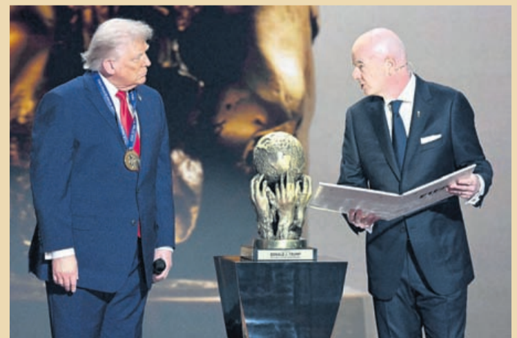
(L-R) U.S. President Donald Trump receives the FIFA Peace Prize from Italian Fifa President Gianni Infantino during the draw for the 2026 FIFA Football World Cup taking place in the U.S., Canada and Mexico, at the Kennedy Center, in Washington, DC, on December 5, 2025.

around $1,600 at face value, while in 2026 it is about $11,000. □