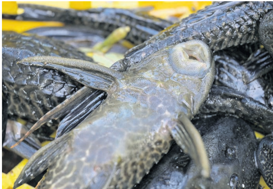
In this photo taken on May 5, 2026 a suckermouth catfish lies upside down showing its sucker mouth after being caught from a river as part of a local government program to eradicate the invasive species in Jakarta.

Surprisingly adept at living in polluted water, the sapu-