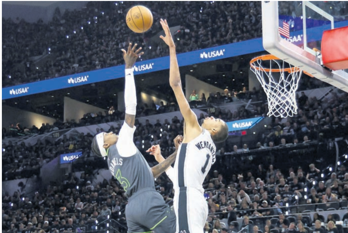
Jaden McDaniels #3 of the Minnesota Timberwolves shoots the ball against Victor Wembanyama #1 of the San Antonio Spurs during the third quarter in Game Two of the Second Round of the NBA Western Conference Playoffs at Frost Bank Center on May 06, 2026 in San Antonio, Texas.

"There is some ego. They assaulted us in game one, we wanted to assault in game two," the Frenchman added.