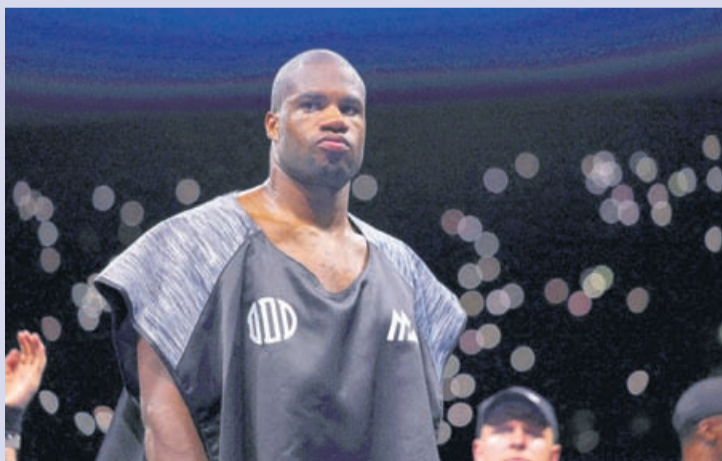
Britain's Daniel Dubois arrives ahead of his undisputed world heavyweight boxing title bout against Ukraine's Oleksandr Usyk at Wembley Stadium in London on July 19, 2025.

Saturday's bout against Dubois will be Wardley's first title defence as WBO champion "Irrespective of pedigree, history, experience, I believe that I can beat him," he said. □