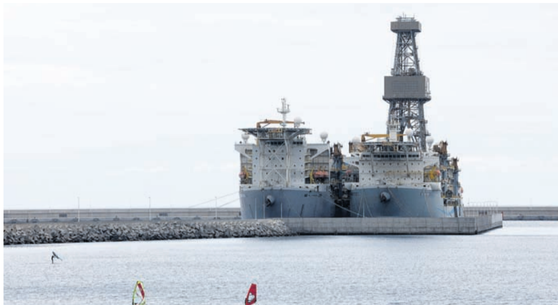
Windsurfers are pictured in the port of Granadilla de Abona on the island of Tenerife in Spain's Canary Islands on May 6, 2026.

Insisting that hantavirus is not like Covid-19, the World Health Organization has also pointed to a low risk for public health worldwide after the outbreak of a rare version of the infection that is transmissible between humans.