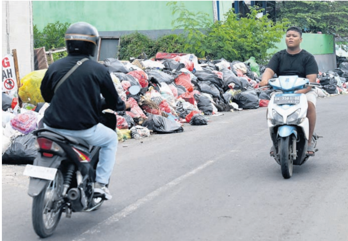
This picture taken on April 21, 2026 shows motorists driving past rubbish dumped along a street at Serangan village in Denpasar, on Indonesia's resort island of Bali.

On paper, Indonesia has banned open landfills since 2013, but it is only now attempting to fully implement