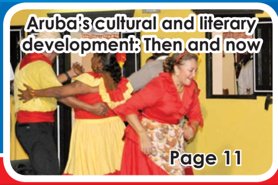
Aruba's cultural and literary development: Then and now