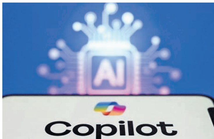
Ghana's artist Emmanuel Aggrey poses for a photograph next to a billboard covered with clothes as part of the "Baleboard" project in Accra on 5 May 2026.

"Baleboard" is planned as a long-term, travelling exhibition spanning multiple countries, including Nigeria and Kenya, before moving to European cities. □