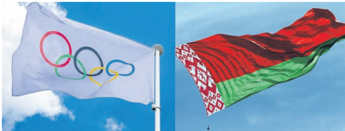
This combination of pictures created on May 7, 2026 shows (L) the Olympic flag during a practice session at Eiffel Tower Stadium in Paris on July 24, 2024, ahead of the Paris 2024 Olympic Games and (R) a Belarus flag during an air show in the capital Minsk, on June 21, 2014.

"The IOC reaffirms that athletes' participation in international competition should not be limited by the actions of their governments, including involvement in a war or conflict," it said. This new policy should allow for a Belarusian delegation to compete at the Los Angeles Summer Olym-