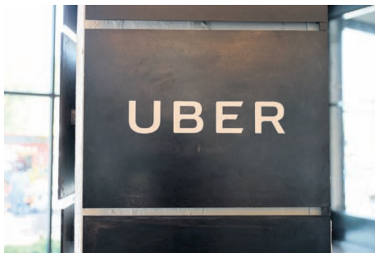
The Uber company logo is seen in the Falchi Building on June 26, 2024 in New York City.

el sites, with search, maps, and filters for price, amenities, and guest ratings. Users can pay with card details already saved in the app.