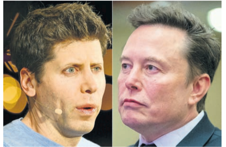
This combination of pictures created on December 27, 2024 shows Sam Altman, CEO of OpenAI, speaking during The Wall Street Journal's WSJ Tech Live Conference in Laguna Beach, California on October 17, 2023 and Elon Musk listening as US President-elect Donald Trump speaks during a meeting with House Republicans at the Hyatt Regency hotel in Washington, DC on November 13, 2024.

apolitical Altman found common ground in a shared belief about the future of AI. Musk saw Google, and its subsidiary DeepMind, as out to create AI that thinks sharper than people do with little regard for controlling it. Just months before OpenAI was officially founded in early 2015, Altman published a blog post calling for measures to "limit the