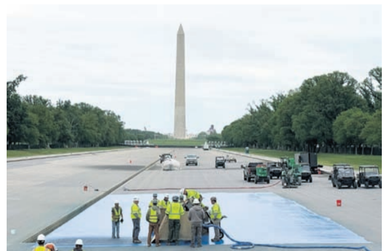
Crews resurface the bottom of the Lincoln Memorial Reflecting Pool with a new blue coating in Washington, DC on April 25, 2026.

The contractors have cleaned the bottom and begun pouring the "industrial-grade" substance and