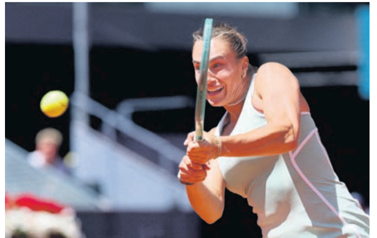
Belarus' Aryna Sabalenka returns the ball to Japan's Naomi Osaka during their 2026 WTA Tour Madrid Open tennis tournament women's singles match at the Caja Magica in Madrid, on April 27, 2026.

"She's an incredible player, we had a really tight match in Miami, and especially here in Madrid I think this surface suits her game," added Sabalenka. □