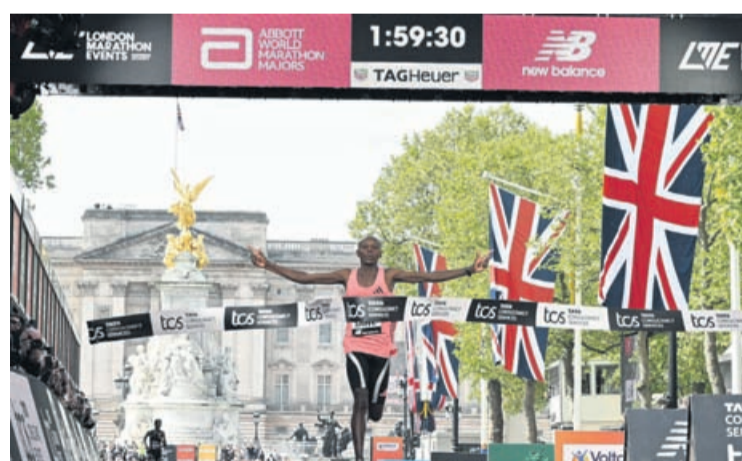
Kenya's Sabastian Sawe crosses the line to win the men's race in a new world record time at the 2026 London Marathon in central London on April 26, 2026.

"The whole world can only be saying chapeau to him." □