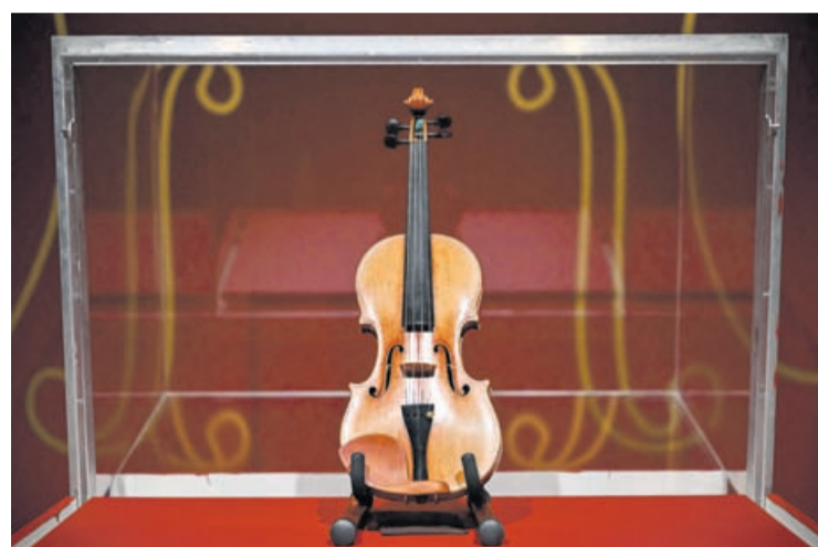
The Joachim-Ma Stradivarius violin is on display during a preview of the violin's auction at Sotheby's in New York City on February 3, 2025.

The pupils are also encouraged to step outside their comfort zones. Even if it is their passion, they cannot spend two years just writing R&B songs or playing heavy metal. □