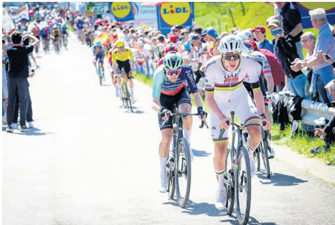
UAE Team Emirates-XRG's Slovenian rider Tadej Pogacar (R) and Decathlon CMA-CGM Team's French rider Paul Seixas cycle during the men elite race of the Liege-Bastogne-Liege UCI World Tour one day cycling race, 259.5km from Liege, over Bastogne to Liege, on April 26, 2026.

"So, we'll see. We keep working hard to still try to fight for the next years to win as much as we can until he de-