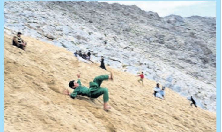
An Afghan boy enjoys rolling down a steep and sandy mountainside on a weekend at the Sayad area of Reg-e-Rawan in Kapisa province on April 24, 2026.