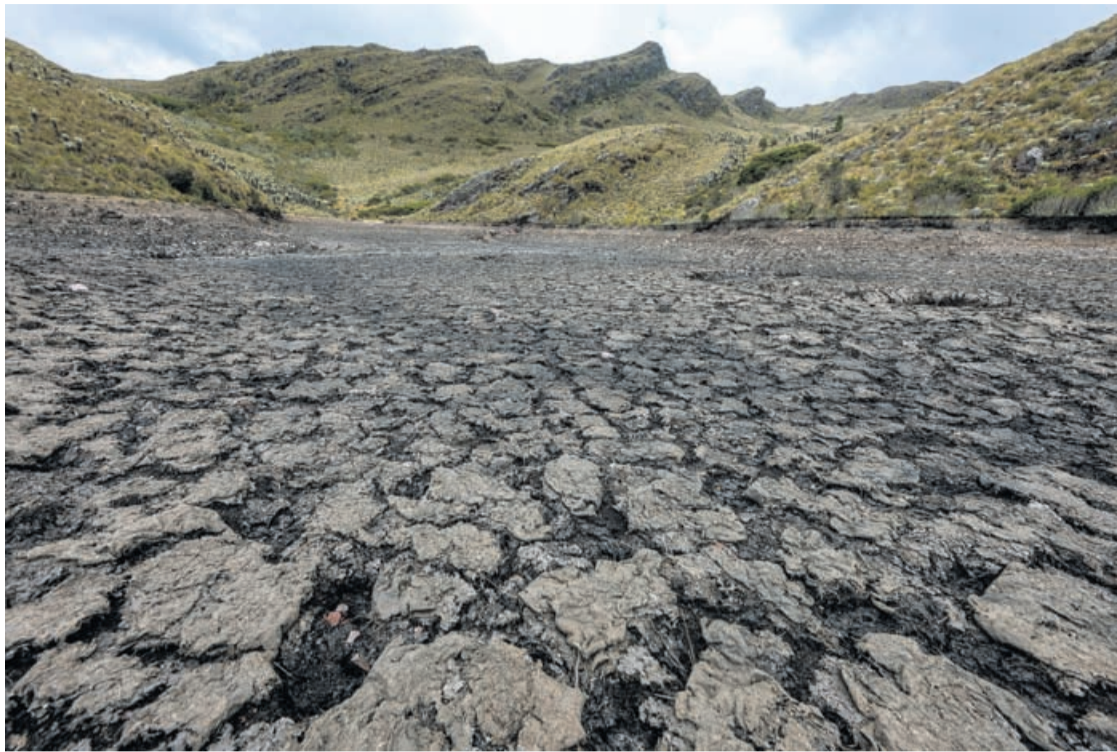
General view of lagoons in "Pan de Azucar" Natural Park at the Paramo el Consuelo in Belen, Boyaca Department, Colombia, taken on April 21, 2024.