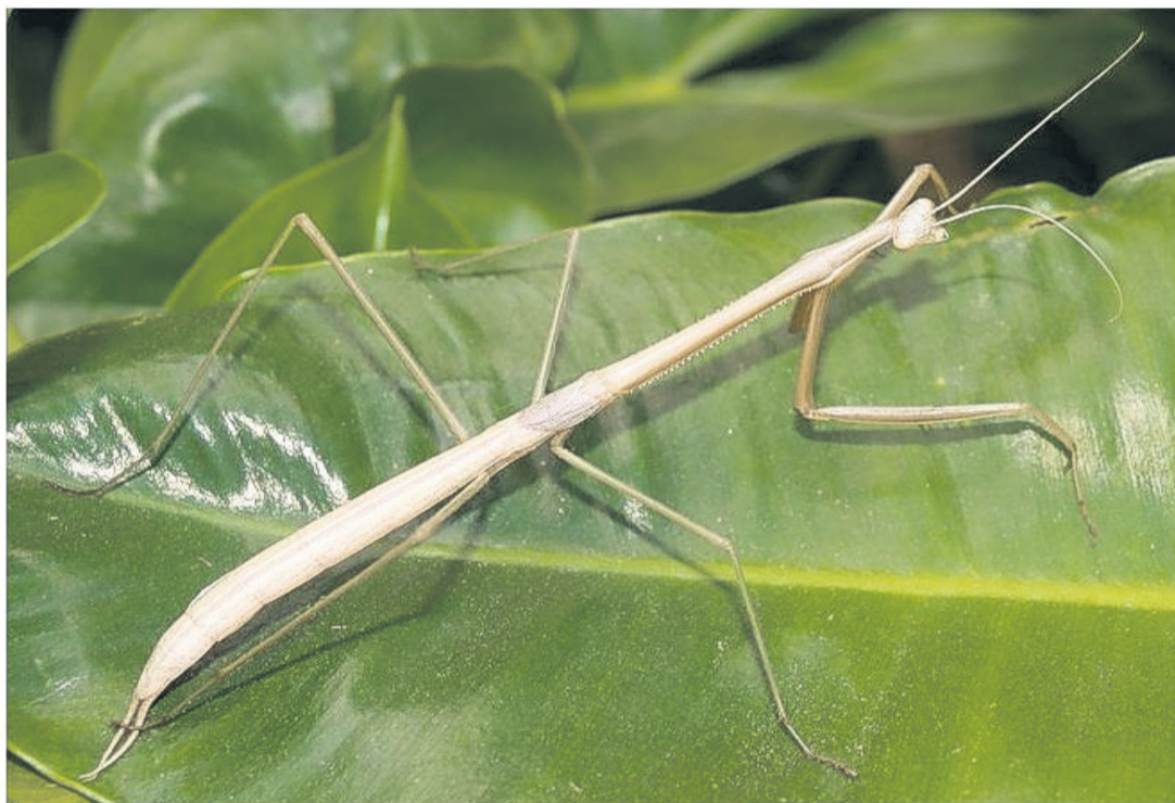
15, Brunneria xerophila adult female. Paradera, Aruba 02.08.08