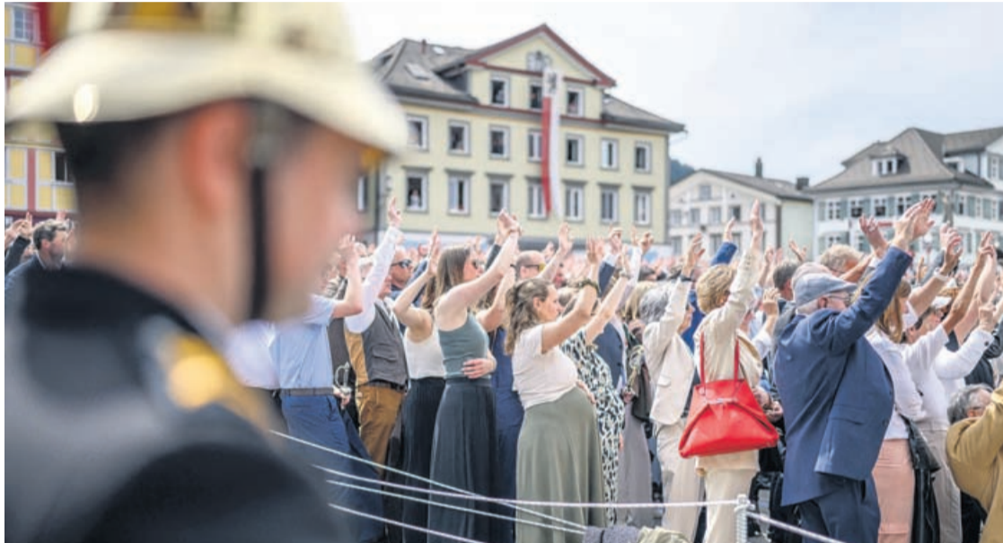
Citizens vote by raising their hands during the Landsgemeinde, a traditional public, non-secret ballot conducted by majority rule, in Appenzell, eastern Switzerland, on April 26, 2026.