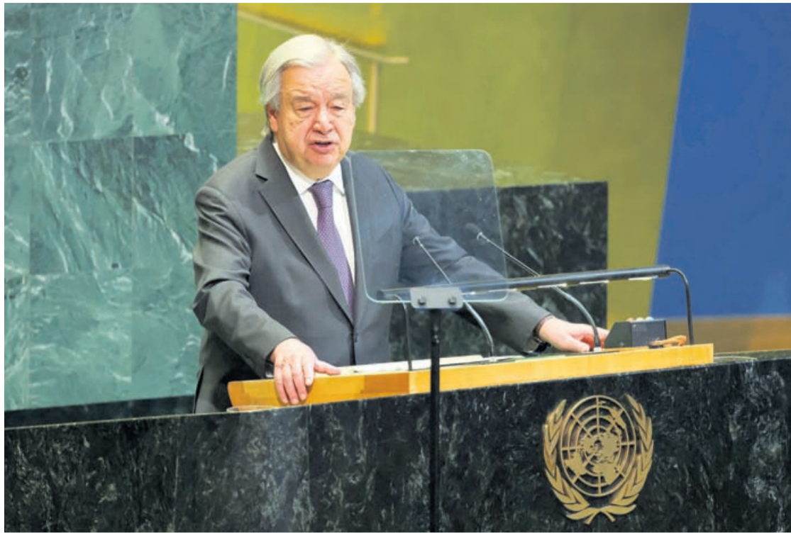
U.N. Secretary-General Antonio Guterres speaks during the 11th Review Conference of the Treaty on the Non-Proliferation of Nuclear Weapons (NPT) at the United Nations Headquarters in New York on April 27, 2026.

France's Foreign Minister Jean-Noel Barrot told signatories that "never has the risk of nuclear proliferation been so high, and the threat posed by Iran's and North Korea's programs is intolerable for each and every state party to this treaty." Tempering expectations,