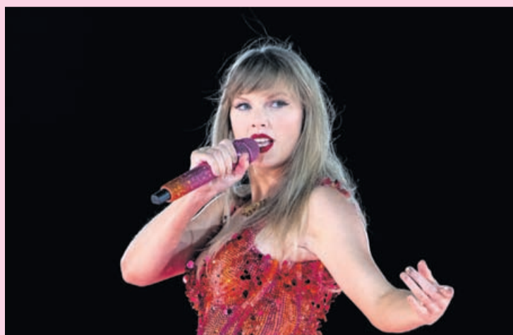
U.S. singer Taylor Swift performs on stage during "The Eras Tour" at the Hard Rock stadium in Miami Gardens, Florida, October 18, 2024.