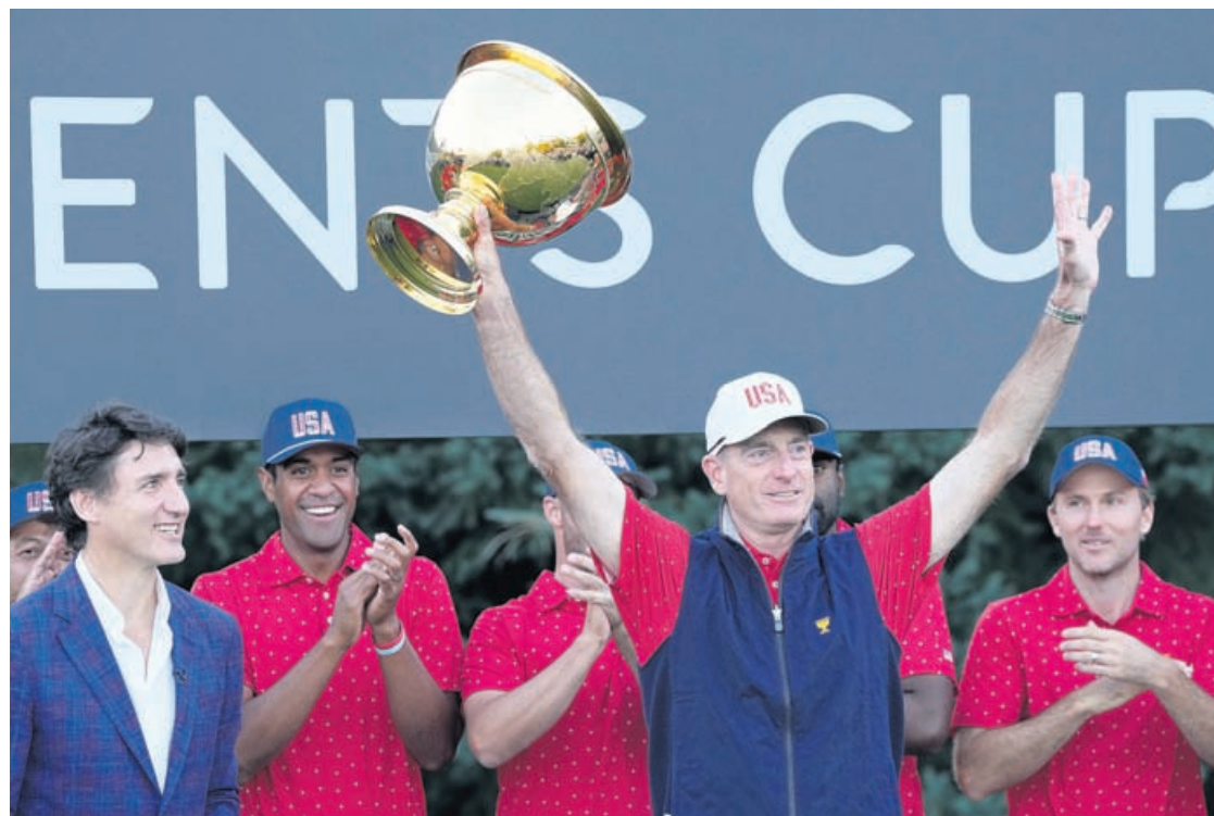
United States team captain Jim Furyk hoist the Presidents Cup as Canada Prime Minister Justin Trudeau looks on at Royal Montreal Golf Club on Sunday, Sept. 29, 2024, in Montreal.

Perhaps fittingly the clinching point came from Keegan Bradley, who had gone 10 years without competing for the U.S. team and already has been appointed the Ryder