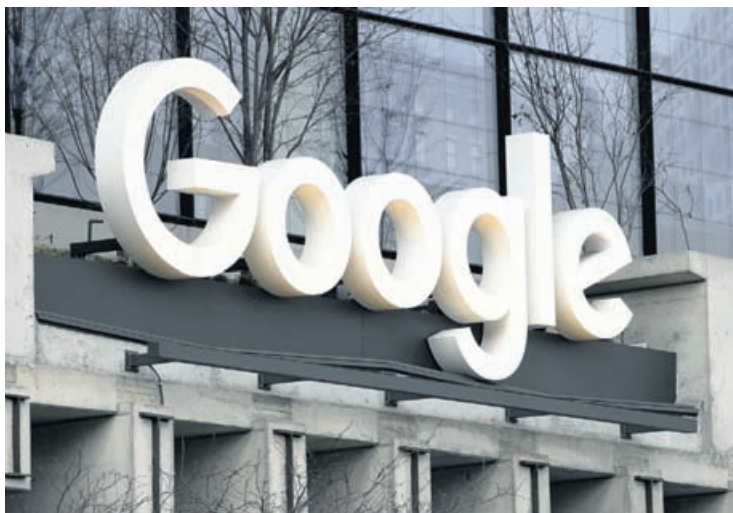
The Google building is seen in New York, Feb. 26, 2024.