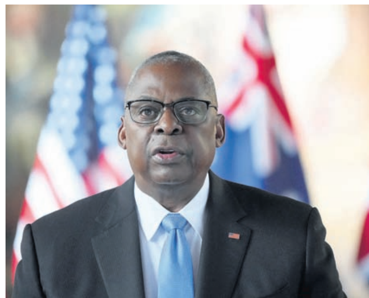
Secretary of Defense Lloyd Austin speaks in Greenwich, London, Sept. 26, 2024.

On Sunday, Defense Secretary Lloyd Austin announced that he was temporarily extending the USS Abraham Lincoln carrier strike group and its embarked air wing in the region. A U.S. official said the extension will be for about a month. A second carrier, the USS Harry S. Truman, departed Virginia last week and is enroute to Europe. It will head to the Mediterranean Sea and will again provide a two-carrier presence in the broader region. It's not expected to arrive for at least another week. □