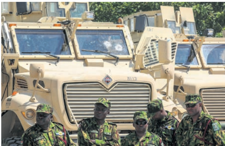
Kenyan police officers, part of a UN-backed multinational force, stand next to armored vehicles on their base during a visit by Kenya's President William Ruto, in Port-au-Prince, Haiti, Saturday, Sept. 21, 2024.