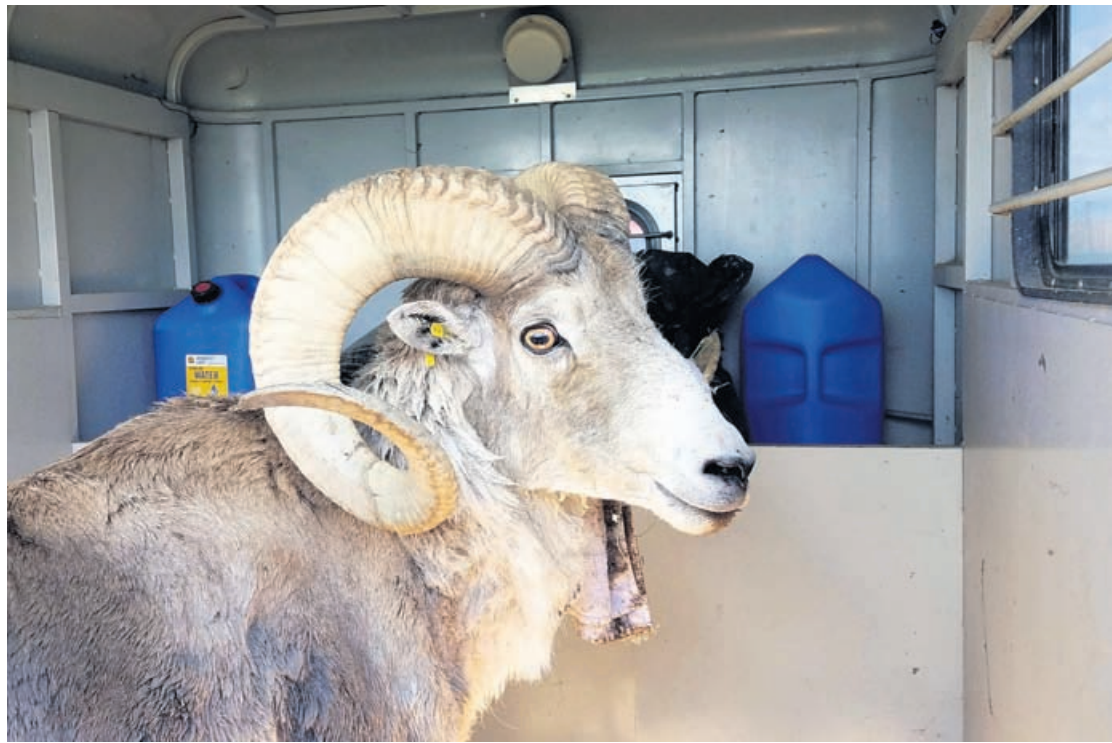
shows a sheep nicknamed Montana Mountain King that was part of unlawful scheme to create large, hybrid species of wild sheep for sale to hunting preserves in Texas.