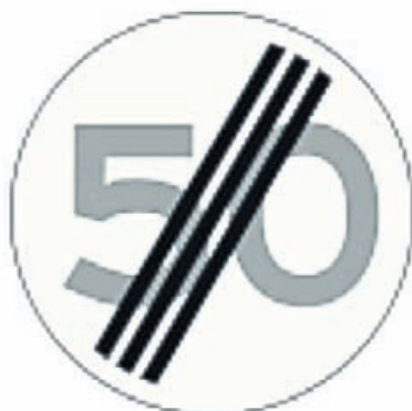
end speed limit