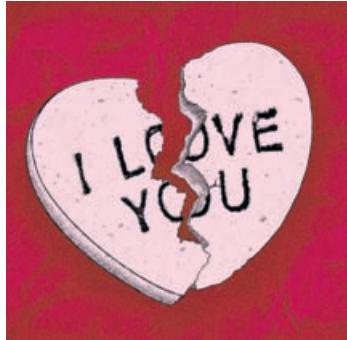
(Associated Press Illustration/ Annie Ng)

Relationship experts say it's normal for couples to experience moments of what feels like genuine hatred. The difference between couples who last and those who don't can lie in how they handle their emotions in those moments.