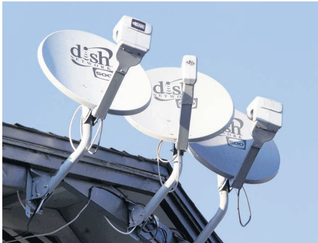
In this Feb. 23, 2011, file photo, Dish Network satellite dishes are shown at an apartment complex in Palo Alto, Calif.

The pay-for-TV market has shifted significantly since. As more and more consumers tune into online streaming giants, demand for more traditional satellite continues to shrink. And, although high-profile acquisitions have proven to be particularly tough under the Biden-Harris administration, that may make regulators more inclined to approve DirecTV and Dish's