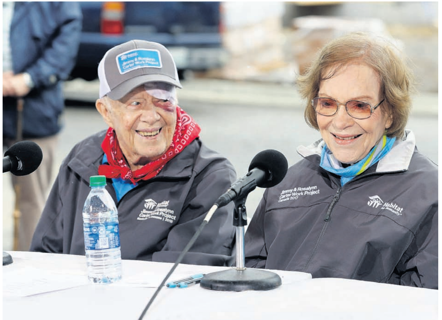
Former President Jimmy Carter and former First Lady Rosalynn Carter answer questions during a news conference at a Habitat for Humanity project Monday, Oct. 7, 2019, in Nashville, Tenn.

While leadership in philanthropy is often gauged