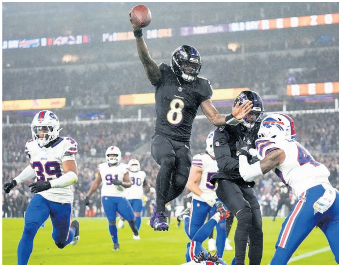
Baltimore Ravens quarterback Lamar Jackson (8) scores a touchdown against the Buffalo Bills during the second half of an NFL football game, Sunday, Sept. 29, 2024, in Baltimore.

"Lot of things still to clean up," O'Connell said. "Starts with me. We'll make sure we keep refining this football team. ... What happened today means absolutely nothing moving forward, other than we've gotta go back to work and continue to improve as a football team because I absolutely love this team." The Ravens made a statement in a prime-time matchup, routing previously unbeaten Buffalo 35-10 to even their record. Balti-