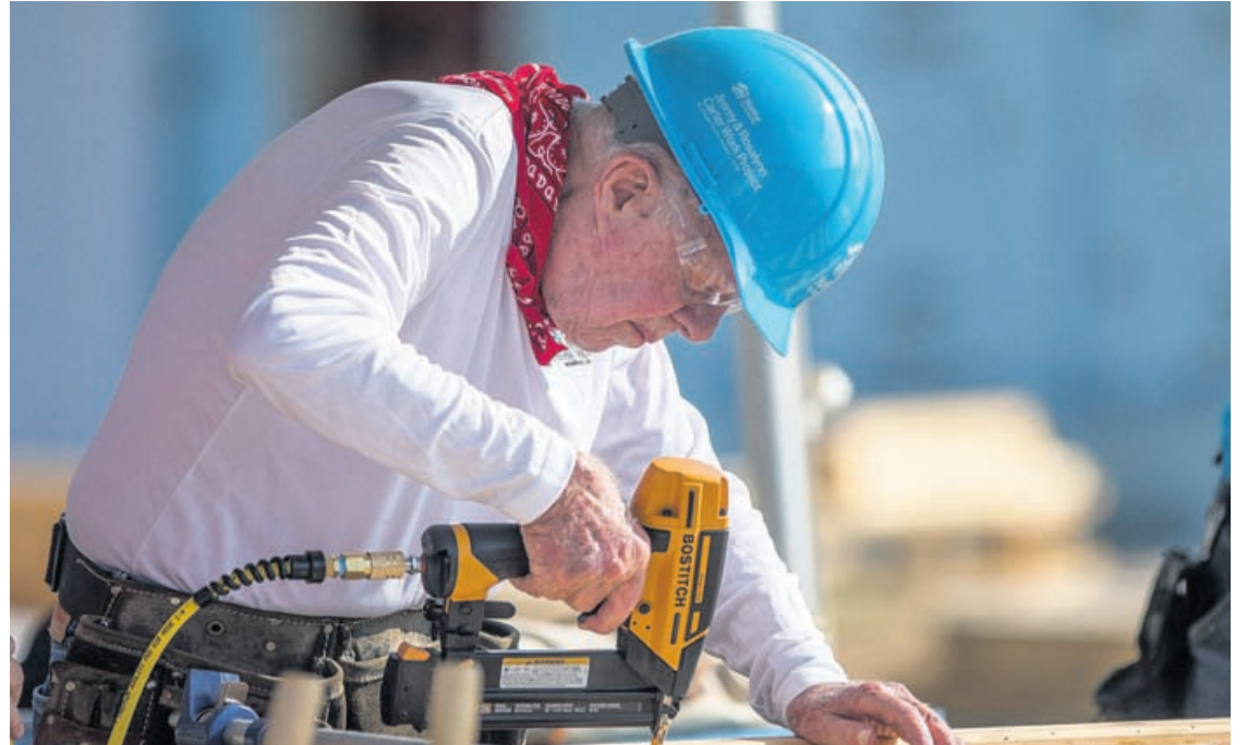
In this Aug. 27, 2018 file photo, former President Jimmy Carter works with other volunteers on site during the first day of the weeklong Jimmy & Rosalynn Carter Work Project, their 35th work project with Habitat for Humanity, in Mishawaka, Ind. Carter turns 95 on Tuesday, Oct. 1, 2019.