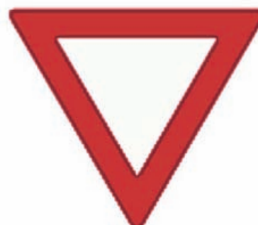
triangle stop sign