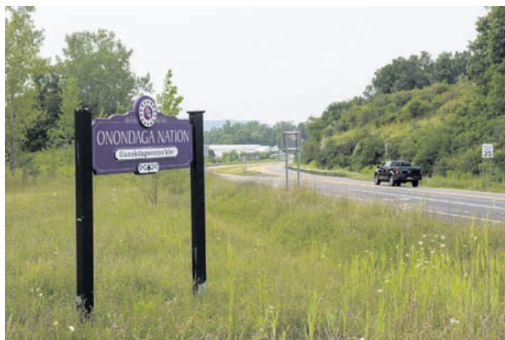
A sign informs drivers of the Onondaga Nation Territory's boundaries, Aug. 3, 2023, in central New York.

The nation's case involves a roughly 40-mile-wide (65-kilometer-wide) strip of land running down the center of upstate New York from Canada to Pennsylvania. The Onondagas hope the case spurs negotiations that could lead to the return of some land. □