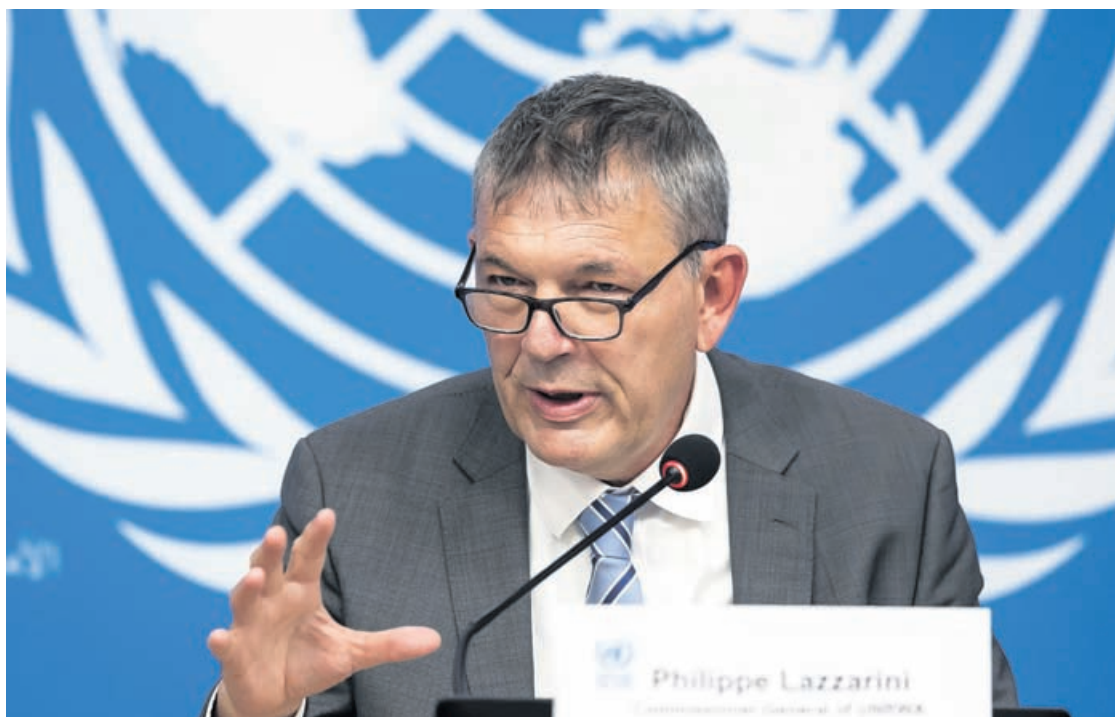
Philippe Lazzarini, Commissioner General of the United Nations Relief and Works Agency for Palestinian Refugees in the Near East (UNRWA), speaks during a press conference at the European headquarters of the United Nations in Geneva, Switzerland, Monday, Sept. 30, 2024.