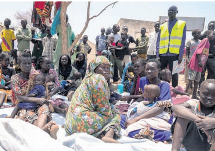
South Sudanese who fled from Sudan sit outside a nutrition clinic at a transit center in Renk, South Sudan, May 16, 2023.

GENEVA (AP) — The number of internally displaced people in Sudan has reached more than 10 million as war drives about a quarter of the population from their homes, the U.N. migration agency told The on Monday.