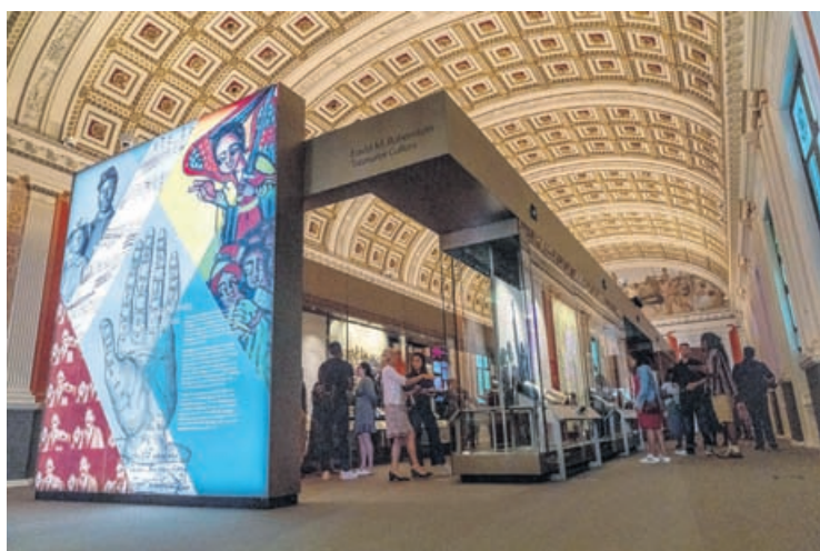
People visit the exhibit, “Collecting Memories: Treasures from the Library of Congress,” during a media preview at the Library of Congress, Monday, June 10, 2024, in Washington.

In phase two, the resolution says that with the agreement of Israel and Hamas, “a permanent end to hostilities, in exchange for the release of all other hostages still in Gaza, and a full withdrawal of Israeli forces from Gaza” will take place. □