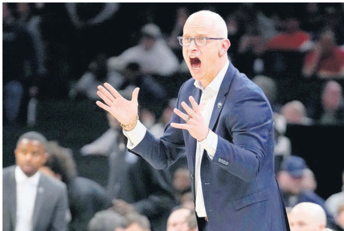
Conn head coach Dan Hurley calls towards his players during the first half of the Elite 8 college basketball game against Illinois in the men's NCAA Tournament, Saturday, March 30, 2024, in Boston.