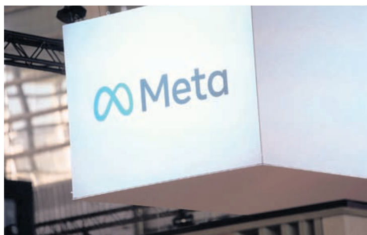
The Meta logo is seen at the Vivattech show in Paris, France, Wednesday, June 14, 2023.