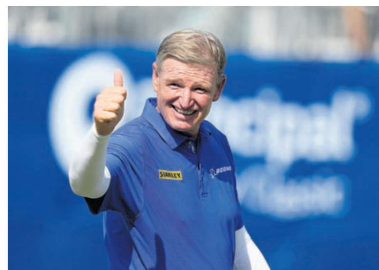
Ernie Els celebrates on the 18th green after winning the Champions Tour Principal Charity Classic golf tournament, Sunday, June 2, 2024, in Des Moines, Iowa.

Cameron Percy of Australia was third third at 9 under after a 67. Doug Barron (66), Stephen Ames (67) and Thomas Bjorn (69) were 8 under. □