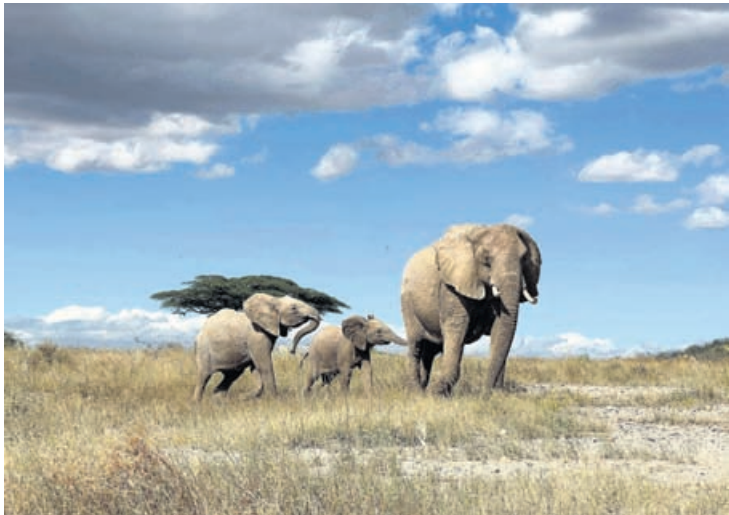
In this undated photo, an African elephant matriarch leads her calf away from danger in northern Kenya.