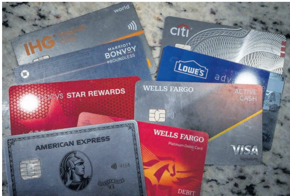
A variety of credit cards are shown on Jan. 18, 2024, in Atlanta.