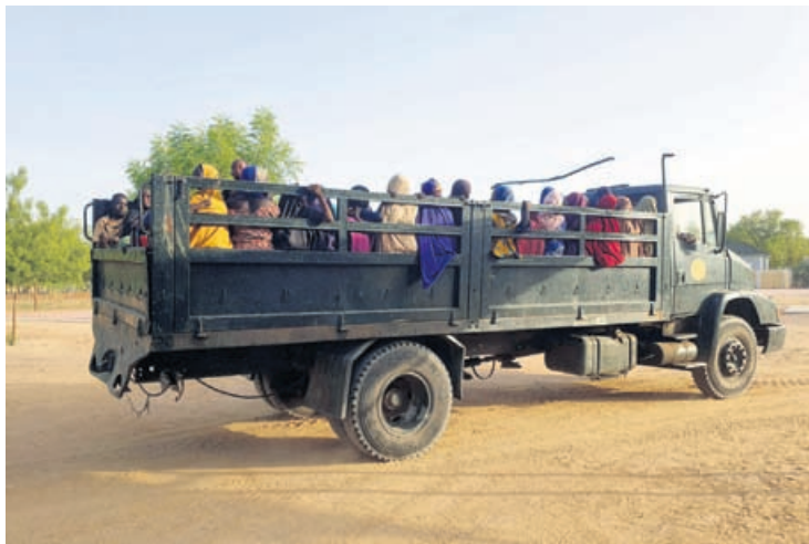
Women and children who were held captive by Islamic extremists, and rescued by Nigeria's army, are seen upon arrival in Maiduguri, Nigeria, May 20, 2024.

"The Nigerian authorities must support these girls and young women as they fully reintegrate into society," said Samira Daoud, Amnesty International's regional director for West and Central Africa. □