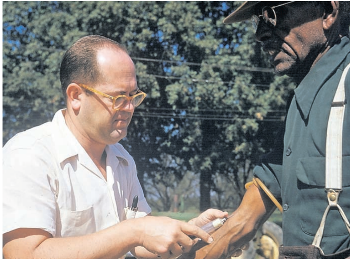
In this 1950's file photo released by the National Archives, a black man included in a syphilis study has blood drawn by a doctor in Tuskegee, Ala.

The study defines racial conspiracy theories as ideas that Black Americans might have about "the actions of U.S. institutions" that aren't necessarily the stated goals of the institution. The study stresses that these are claims that Black Americans may have because of America's documented history of racist policies largely impacting Black communities. Pew examined claims including conspiratorial beliefs about how major institutions discriminate against Black