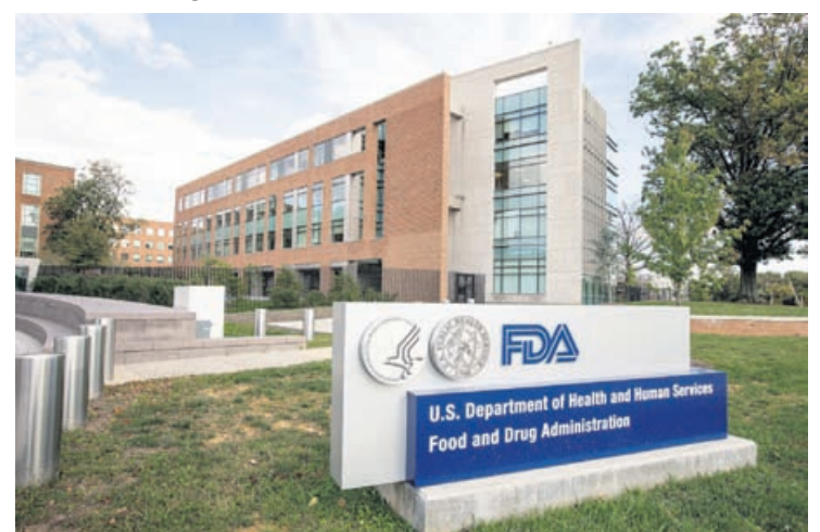
This Oct. 14, 2015, file photo, shows the U.S. Food & Drug Administration campus in Silver Spring, Md.

remove or discontinue their products. But the letters are sometimes ignored. □