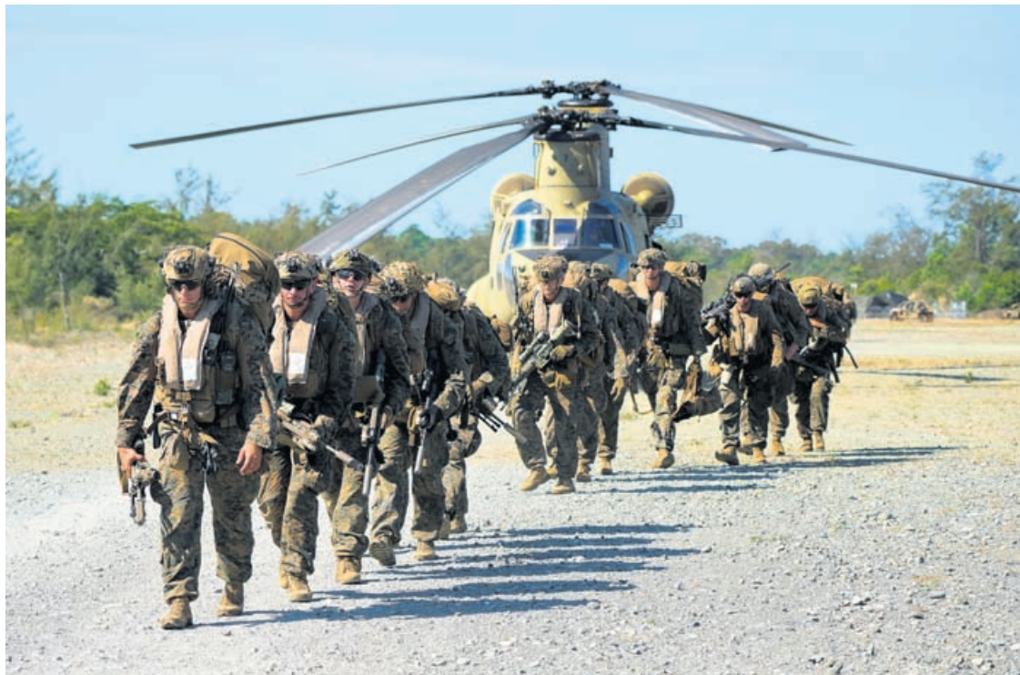
U.S. troopers prepare to board U.S. Army CH-47s at Paredes Air Station at Pasuquin, Ilocos Norte province as it carries U.S. and Philippine troops during a joint military exercise in northern Philippines on May 6, 2024.

MANILA, Philippines (AP) — Hundreds of American and Filipino troops concluded Monday a new combat exercise in the northern Philippines that tested their endurance in more than a week of brutal heat and volatile weather, and braced them to respond to any threat in tropical jungles and on scattered islands, two U.S. and Philippine generals said. The Biden administration has been strengthening an arc of military alliances in the Indo-Pacific to better counter China, including in any possible confrontation over Taiwan and other Asian flash points. The move has dovetailed with Philippine efforts to shore up its territorial defenses amid escalating disputes with Beijing in the South China Sea. The large-scale battle drills, which have been held in Hawaii in recent years under the U.S. Army's Joint Pacific Multinational Readiness Center, have been introduced in the Philippines this year. There is also a version in Alaska. The exer-