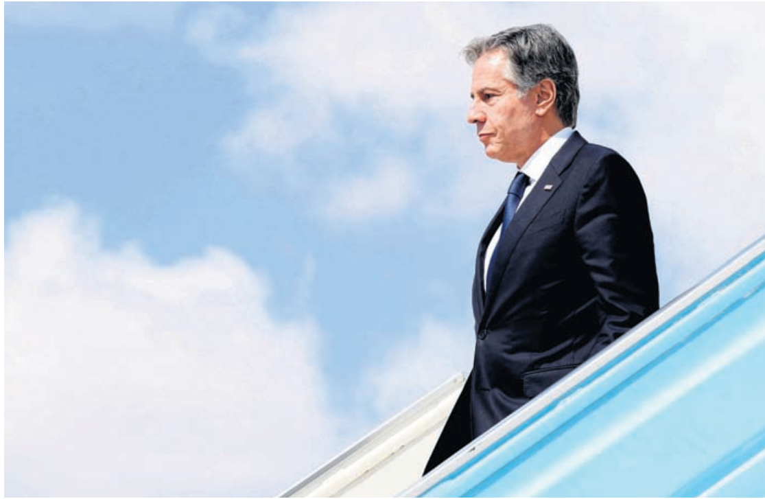
Secretary of State Antony Blinken disembarks from a plane in Tel Aviv, Oct. 16, 2023, from Jordan.

With no firm public response yet from Hamas or Israel to the proposal they received 10 days ago, Blinken started his eighth visit to the region since the conflict began in October by meeting with President Abdel Fattah el-Sissi of Egypt, a key mediator with the militant Hamas group. He then flew to Israel for talks with Netanyahu and other Israeli officials. Blinken once again called on Hamas to accept the plan, which he said has wide international support. "If you want a cease-fire, press Hamas to say 'yes,'" he told reporters before leaving Cairo on the trip that also will take him to Jordan and Qatar. Blinken said Israel has accepted the proposal, though Netanyahu has expressed