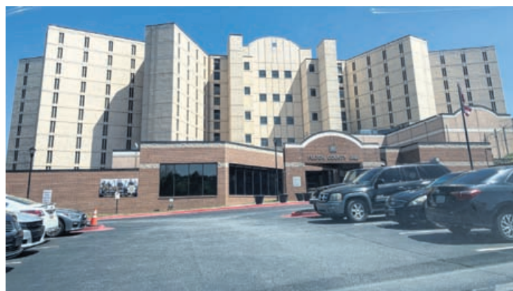
The Fulton County, Ga., Jail is seen, April 11, 2023, in Atlanta.

Those helped by The Bail Project returned to over 90% of their court dates, a statistic that, according to the nonprofit, lays "waste to the idea that cash bail is a necessary incentive to ensure a person's future court appearance." □