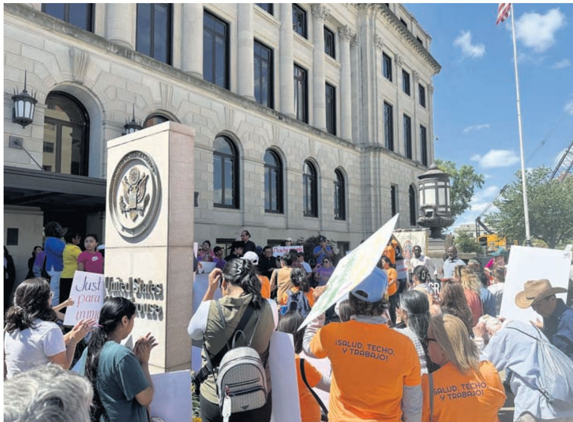
Opponents of an Iowa immigration law rally outside the federal courthouse on Monday, June 10, 2024, in downtown Des Moines, Iowa.