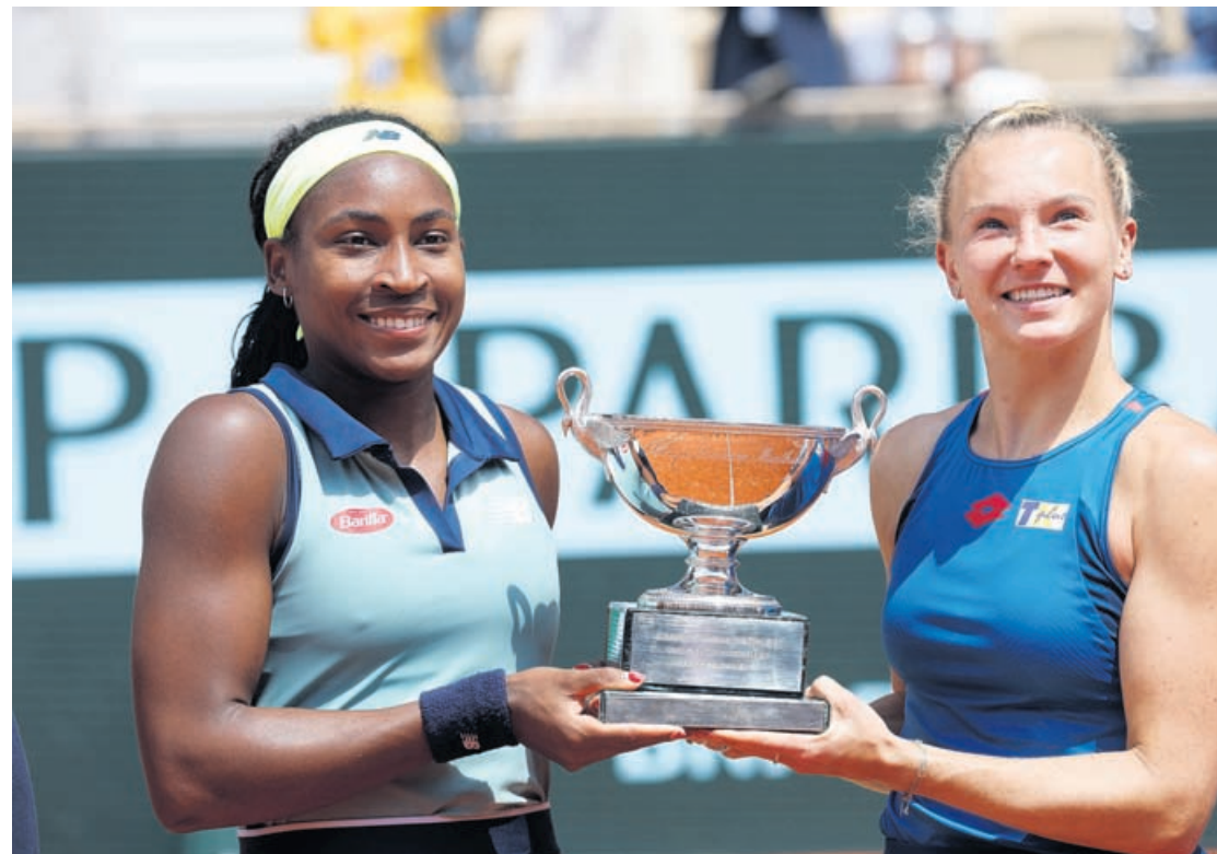
Coco Gauff of the U.S., left, and Katerina Siniakova of the Czech Republic hold the trophy as they won the women's doubles final match of the French Open tennis tournament against Italy's Sara Errani and Jasmine Paolini at the Roland Garros stadium in Paris, Sunday, June 9, 2024.

He figures his new status, along with his first Grand Slam trophy from the Aus-