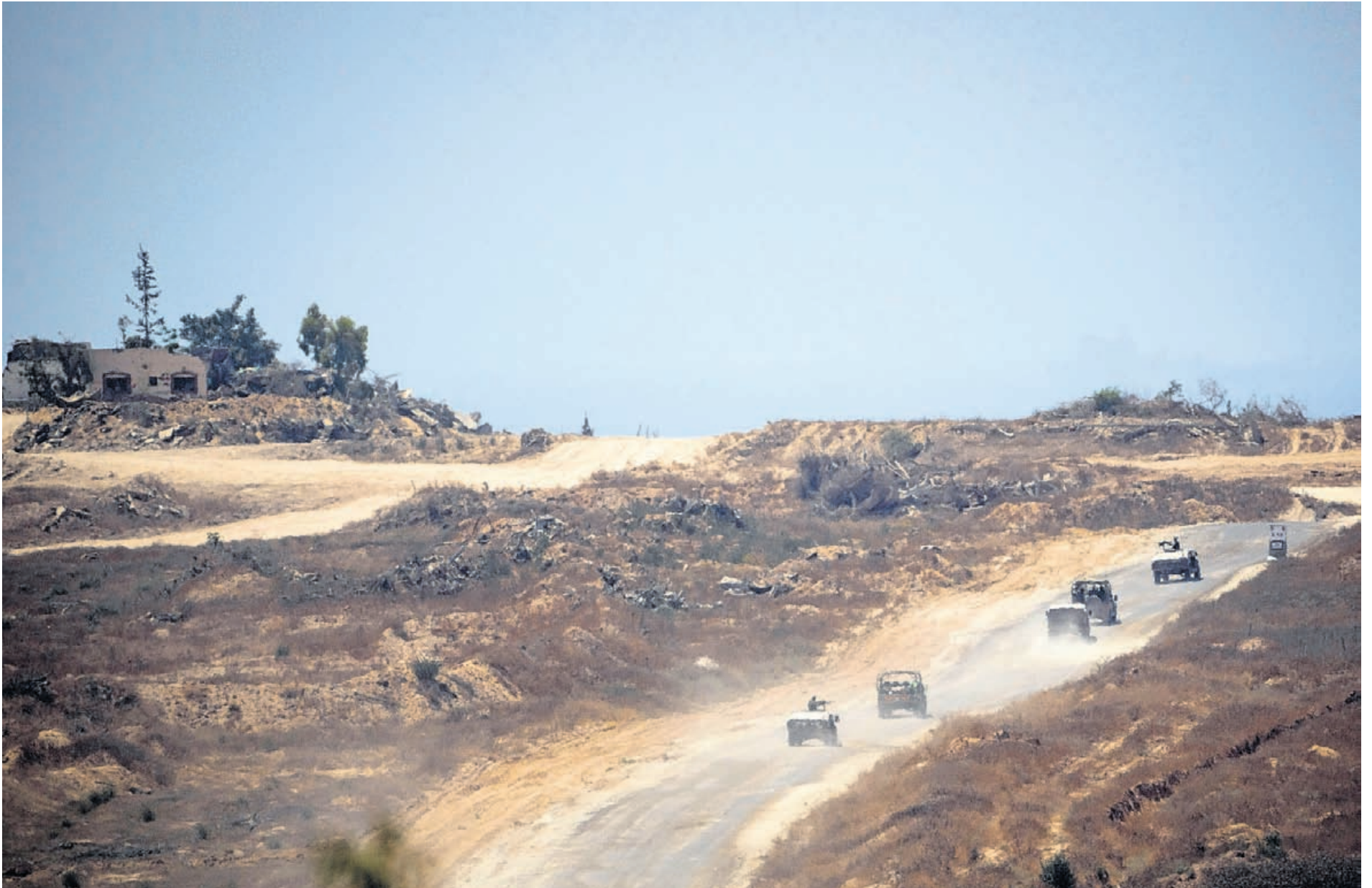
Israeli soldiers move near the Israeli-Gaza border as seen from southern Israel, Monday, June 10, 2024.