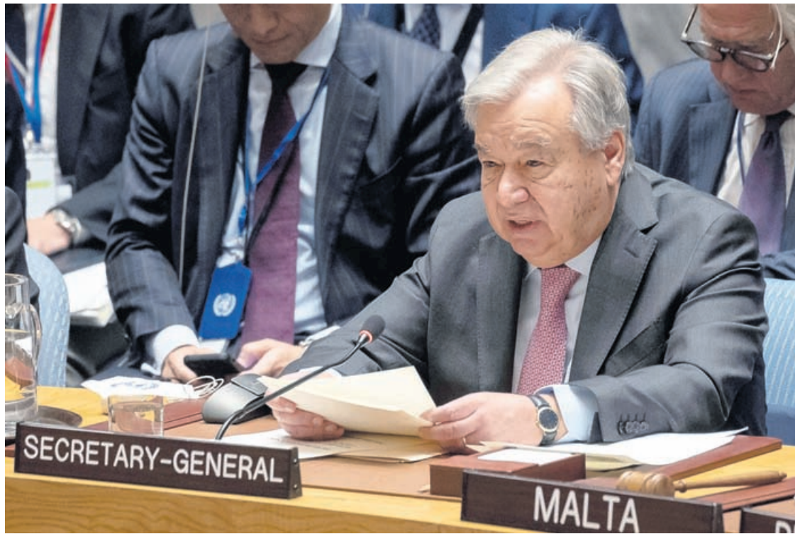
United Nations Secretary General Antonio Guterres speaks during a Security Council meeting at the United Nations headquarters, April 18, 2024.

U.S. deputy ambassador Robert Wood told reporters earlier on Monday that the United States wanted all 15 Security Council members to support what he described as “the best, most realistic opportunity to bring at least a temporary halt to this war.” Whether Israel and Hamas agree to the three-phase cease-fire plan remains in question, but the resolution's strong support in the U.N.'s most powerful body puts added pressure on both parties to approve the proposal. Israeli Prime Minister Benjamin Netanyahu has said that Bi-