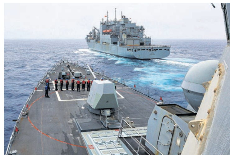
The Arleigh Burke-class guided-missile destroyer USS John Finn (DDG 113) prepares to come alongside Lewis and Clark-class dry cargo ship Cesar Chavez (T-AKE-14) in the East China Sea, on Jan. 21, 2024.

China agreed to resume military contacts with the U.S. at a meeting last November between Presidents Joe Biden and Xi Jinping in California. In part, the argument for doing so was to be able to manage an unintentional collision or other incident that could happen as both sides hold drills and patrol the waters in regional hotspots includ-