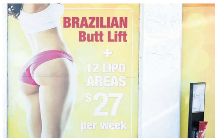
A window display advertises low-cost "Brazilian butt lift" cosmetic surgery procedures outside a clinic in Miami on Friday, March 22, 2019.