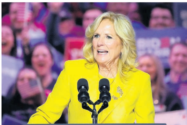
First lady Jill Biden speaks before President Joe Biden appears at an event on the campus of George Mason University in Manassas, Va., Tuesday, Jan. 23, 2024, to campaign for abortion rights, a top issue for Democrats in the upcoming presidential election.