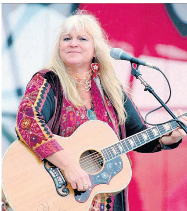
Melanie Safka opens the second day of the "A Day In The Garden" festival on Aug. 15, 1988, in Bethel, N.Y.

To go to those emotional places as Margaret "was harrowing at times," admits Kidman, who says she had to lose herself in the moment. "It's an exploration. ... It's like, put me in the place, put me in the scene, and let's go off to the objective and whatever comes through will come through." □