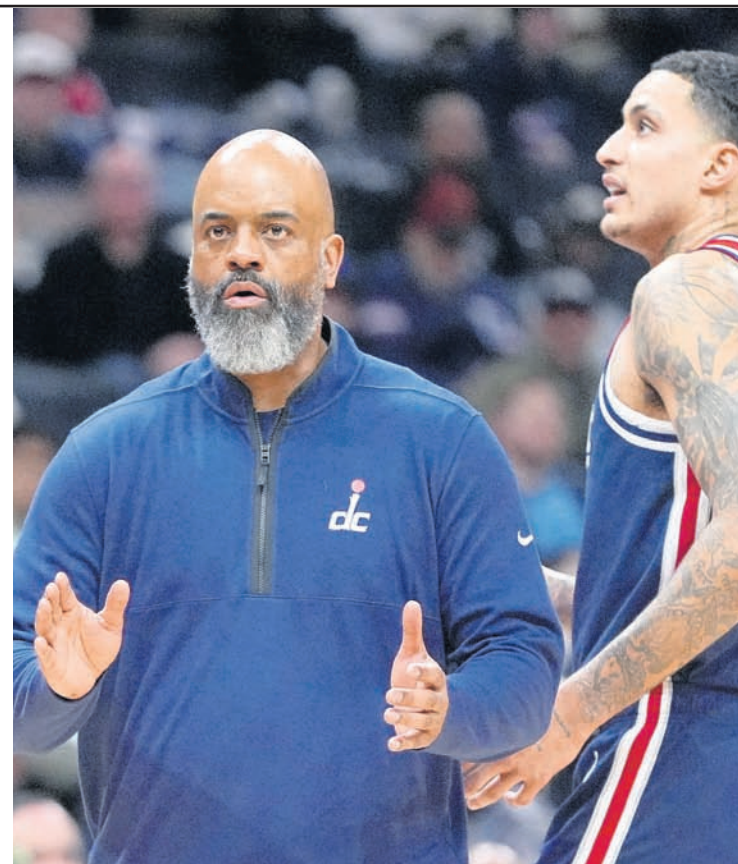
Washington Wizards coach Wes Unseld Jr. talks to the team during a timeout in the first half of an NBA basketball game against the San Antonio Spurs on Saturday, Jan. 20, 2024, in Washington.

Gender segregation in public places has also been eased, with men and women attending movie screenings, concerts and even raves — something unthinkable just a few years ago. □