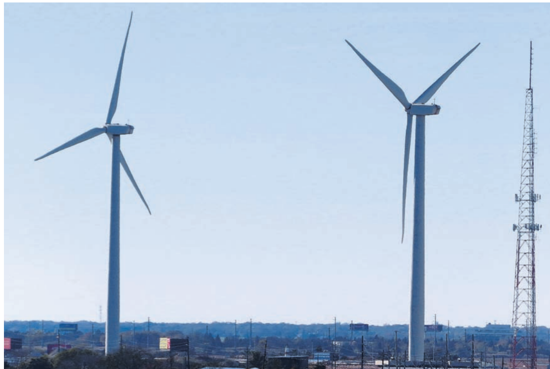
Land-based wind turbines spin in Atlantic City, N.J. on Nov. 3, 2023.

The strategy will use artificial intelligence and passive acoustic monitoring to determine where the whales are at a given time and to monitor the impacts of wind development on the animals. It also calls for