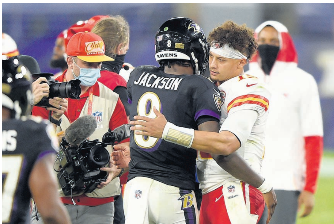
Baltimore Ravens quarterback Lamar Jackson, center, and Kansas City Chiefs quarterback Patrick Mahomes, right, embrace after an NFL football game, Sept. 28, 2020, in Baltimore.

Of course not. Nothing is certain when it comes to talent evaluation, fulfilling potential