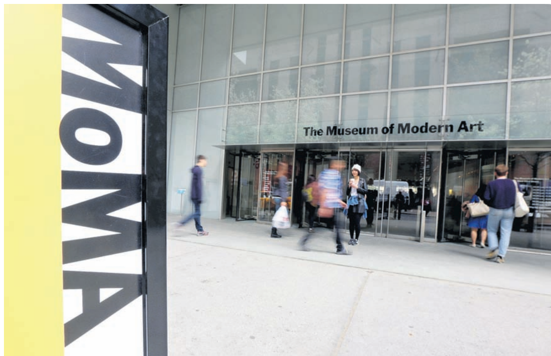
People walk by the entrance to the Museum of Modern Art, in New York, April 22, 2014.