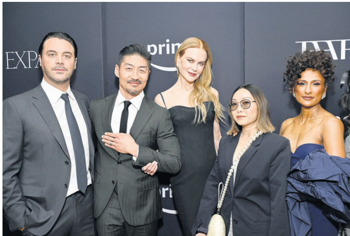
Jack Huston, left, Lulu Wang, Brian Tee, Nicole Kidman and Sarayu Blue attend the premiere of "Expats" at the Museum of Modern Art on Sunday, Jan. 21, 2024, in New York.

"When Nicole came to me, to make the series, I just felt like she was meeting me at the height of the success of 'The Farewell.' But people who know me from childhood know we were immigrants (from China)," Wang says.