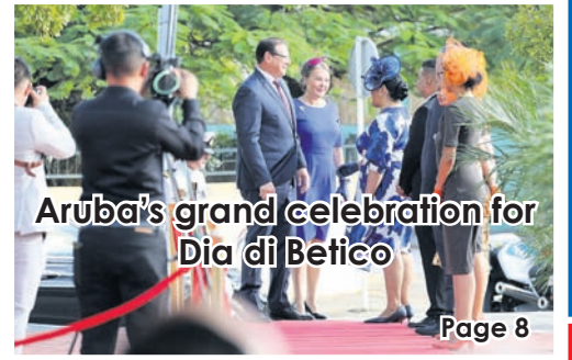
Aruba's grand celebration for Dia di Betico