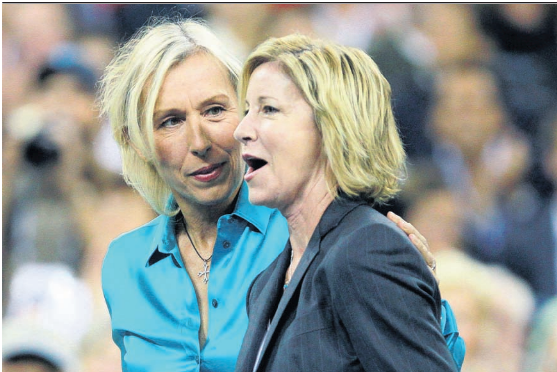
Former tennis players Martina Navratilova, left, and Chris Evert are introduced before the start of the women's championship match at the U.S. Open tennis tournament in New York, Saturday, Sept. 11, 2010.