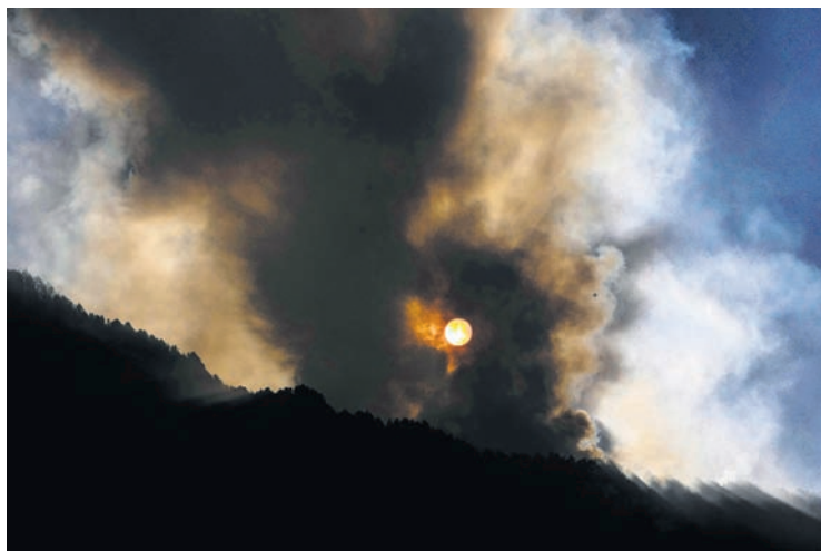
The sun rises during a forest fire on El Cable Hill in Bogota, Colombia, Thursday, Jan. 25, 2024.

He added that India is committed to making sure its migrant workers are safe and protected. □