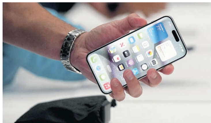
The iPhone 15 Pro is shown after its introduction on the Apple campus, Sept. 12, 2023, in Cupertino, Calif.