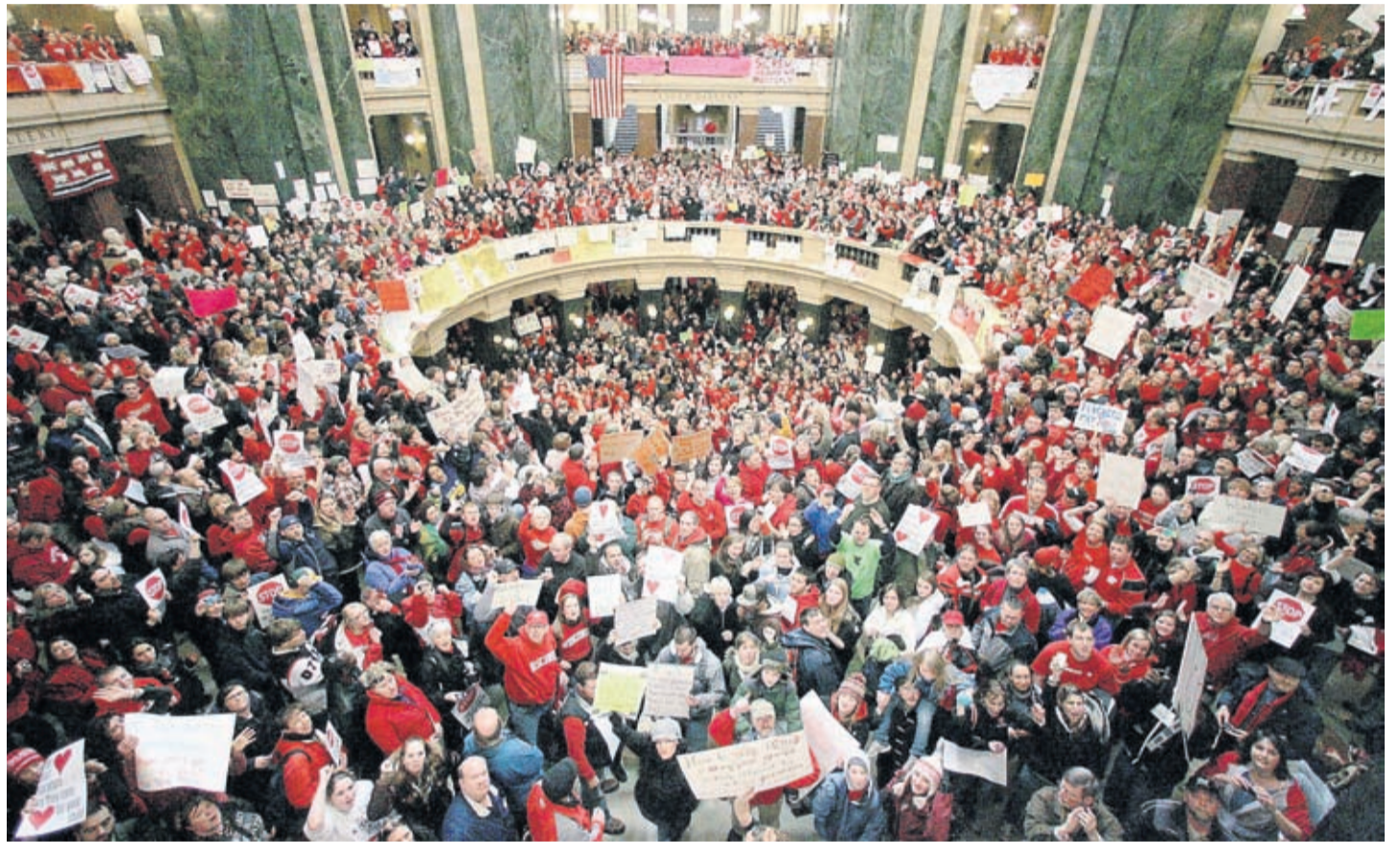
A crowd fills the Wisconsin Capitol rotunda on the fifth day of labor demonstrations, Feb. 16, 2011, in Madison, Wis.

The latest lawsuit is the first since the Wisconsin Supreme Court flipped to liberal control in August. But it was filed in a county circuit court — unlike other major cases that have gone directly to the Supreme Court since its ideological shift — and will likely take more than a year to make its way up for a final ruling.