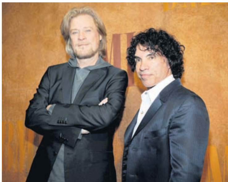
Daryl Hall, left, and John Oates, recipients of BMI Icons awards, pose together before the 56th annual BMI Pop Awards in Beverly Hills, Calif., on May 20, 2008.