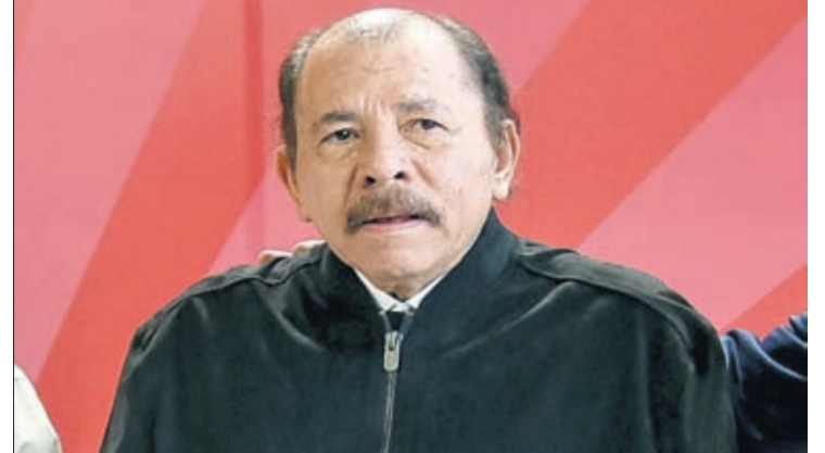
Nicaragua's President Daniel Ortega poses for a photo during the ALBA Summit at the Palace of the Revolution in Havana, Cuba, Tuesday, Dec. 14, 2021.