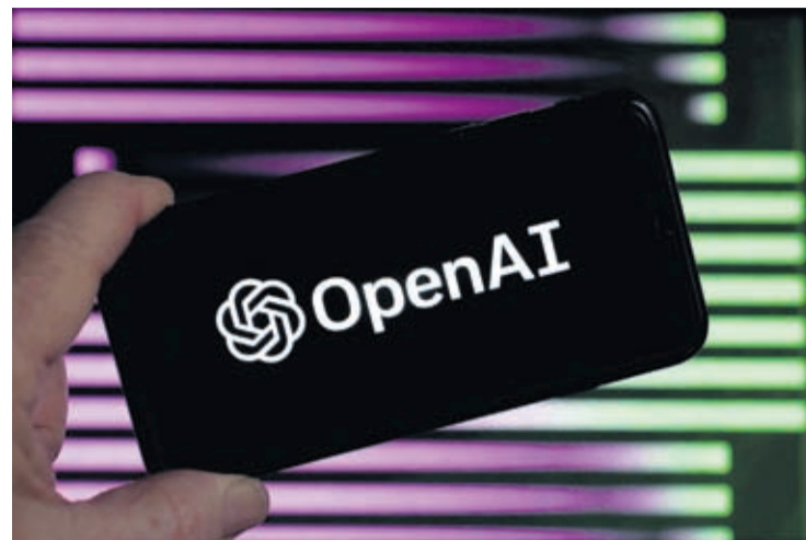
The logo for OpenAI, the maker of ChatGPT, appears on a mobile phone, in New York, Jan. 31, 2023.

"If I had revealed it before, the proposal certainly wouldn't even have been