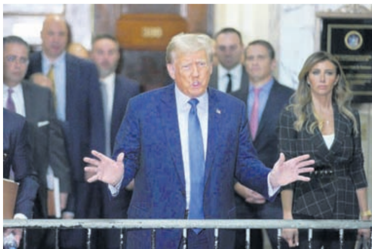
Former President Donald Trump speaks outside the courtroom after testifying at New York Supreme Court, Monday, Nov. 6, 2023, in New York.

He is vice president of the Service Employees International Union of Wisconsin, which represents health care workers and others. □