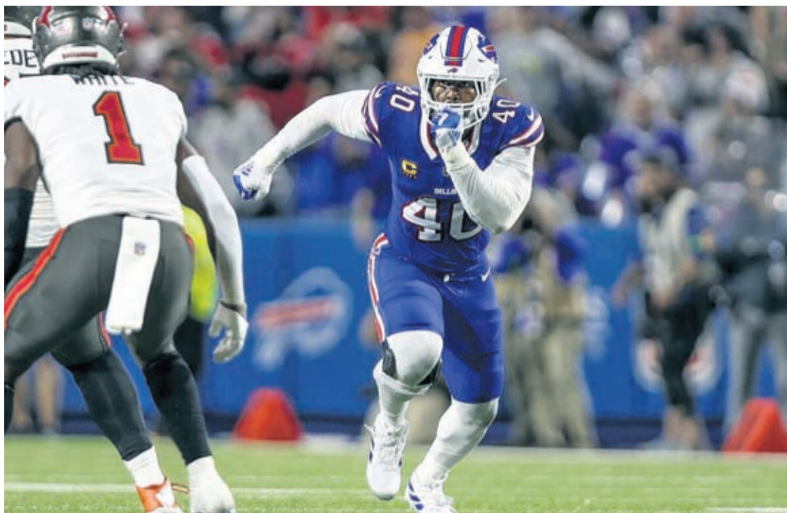
Buffalo Bills linebacker Von Miller (40) rushes during an NFL football game against the Tampa Bay Buccaneers, Thursday, Oct. 26, 2023, in Orchard Park, N.Y.

DALLAS (AP) — Police in Dallas have issued an arrest warrant for Buffalo Bills linebacker Von Miller for allegedly assaulting a pregnant woman. According to the police report, a preliminary investigation of a “major disturbance” at a home on Wednesday determined that Miller, 34, and the victim got into a verbal argument. The report says the suspect became “visibly angry” when the woman left the room, went into the office in their apartment and slammed the door behind her. It says Miller then told her to leave and, when she tried to retrieve her laptop and cell phone, Miller began pushing her, continuing to tell her to “get out.” She yelled “Stop. I’m pregnant” repeatedly, according to the report, and when the pushing caused her to fall into a chair, Miller