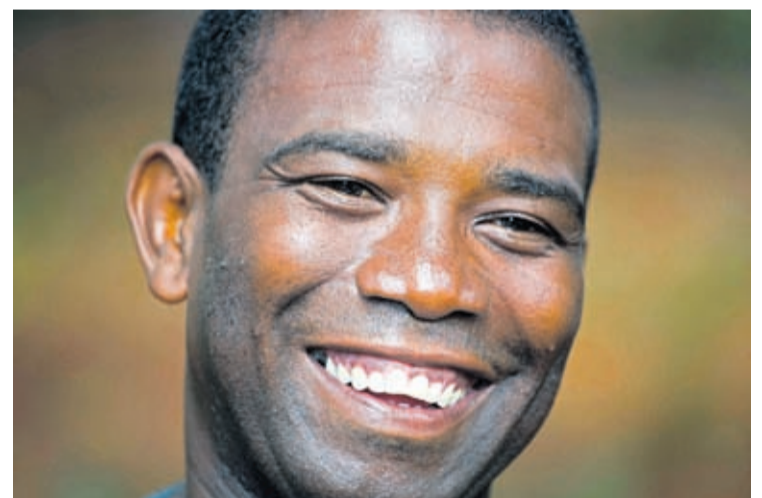
Guy Philippe smiles during an interview in Pestel, Haiti, Aug. 24, 2016. Philippe returned to Haiti on Thursday, Nov. 30, 2023, after the U.S. government deported him.

He could not be immediately reached for comment, and his attorney said he hadn’t been granted access to the police station where Philippe was taken. Philippe once served as police chief for the northern coastal city of Cap-Haitien and was later accused of masterminding attacks on police stations and other targets while in exile in the Dominican Republic.