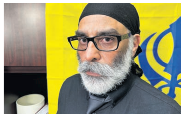
Sikh separatist leader Gurpatwant Singh Pannun is pictured in his office on Wednesday, Nov. 29, 2023, in New York. U.S.

He urged the hitman to act quickly because Pannun,