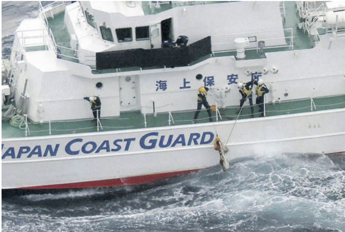
Japanese coast guard members pick up a floating object as they conduct search and rescue operation in the waters off Yakushima Island, Kagoshima prefecture, southern Japan Thursday, Nov. 30, 2023.

By Mari Yamaguchi and Tara Copp Associated Press