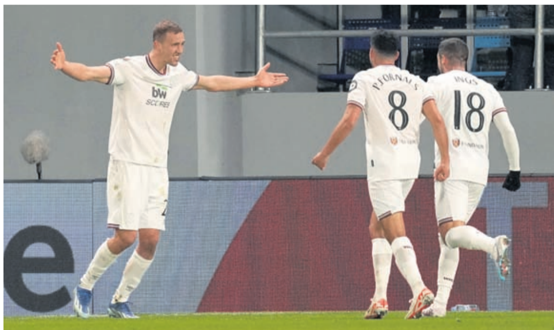
West Ham’s Tomas Soucek, left, celebrates after scoring his side’s opening goal during the Europa League group A soccer match between FK TSC Backa Topola and West Ham United at the TSC Arena in Backa Topola, Serbia, Thursday, Nov. 30, 2023.