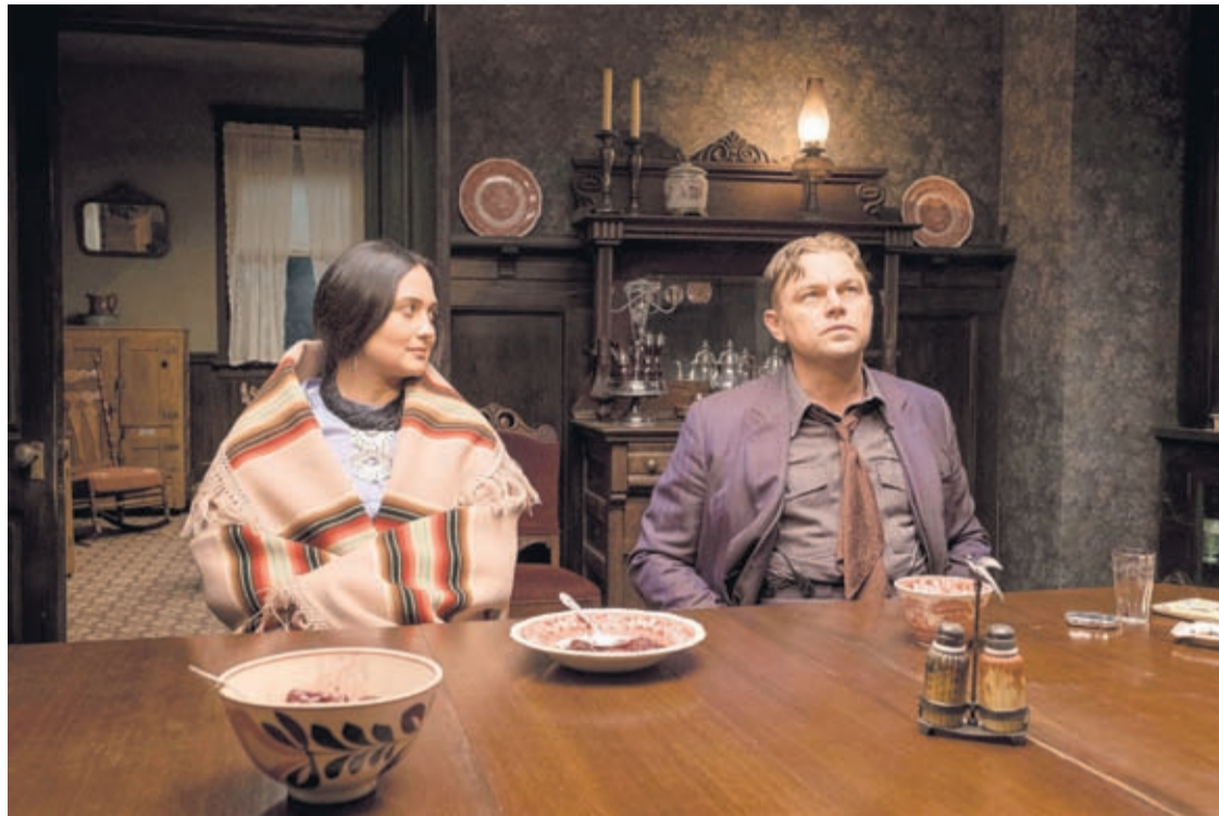
This image released by Apple TV+ shows Lily Gladstone, left, and Leonardo DiCaprio in a scene from "Killers of the Flower Moon."

"Oppenheimer," Christopher Nolan's blockbuster drama about J. Robert Oppenheimer and the Man-