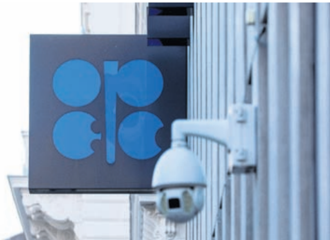
The logo of the Organization of the Petroleum Exporting Countries (OPEC) is seen outside of OPEC's headquarters in Vienna, Austria, Thursday, March 3, 2022.

The market also was let down, because it "was likely expecting a deal covering the first half of next year," he said.