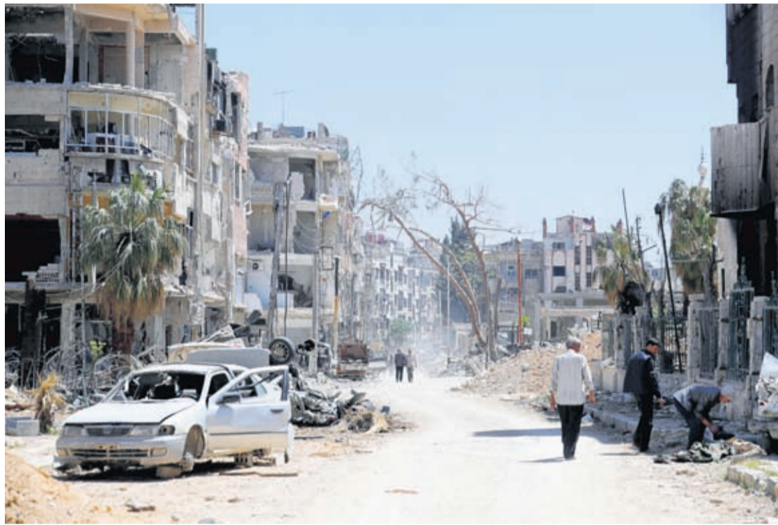
Syrians walk through destruction in the town of Douma, the site of a suspected chemical weapons attack, near Damascus, Syria, on April 16, 2018.

The decision was backed by 69 nations, while 10 voted against it and 45 nations abstained.