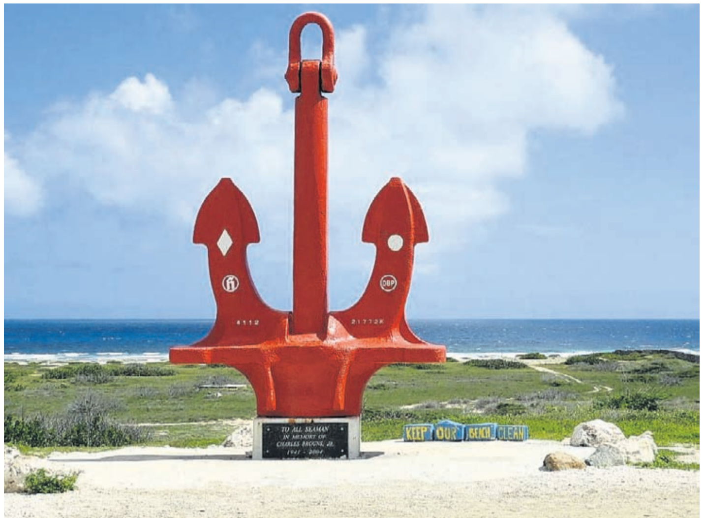
The Red Anchor situated at the entrance of former Lago Colony in San Nicolas