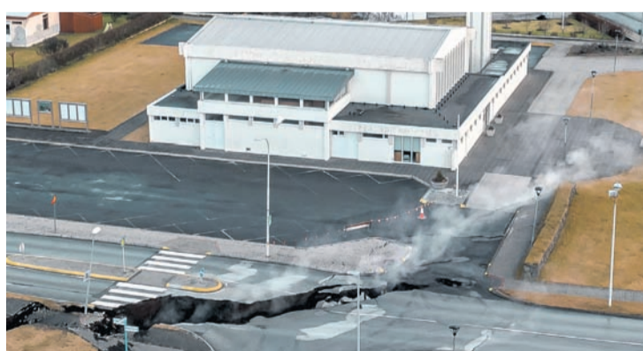
This image taken with a drone shows cracks on the road next to a church in the town of Grindavik, Iceland, Thursday, Nov. 16, 2023.

Grindavik, a town of 3,400, sits on the Reykjanes Peninsula, about 50 kilometers (31 miles) southwest of the capital, Reykjavik and not far from Keflavik Airport, Iceland's main facility for international flights. The nearby Blue Lagoon geothermal resort, one of Iceland's top tourist attractions, has been shut at least