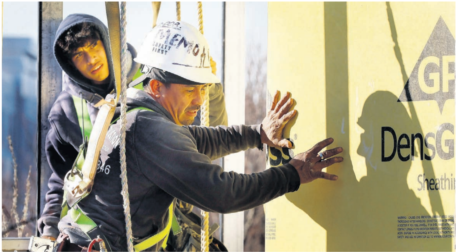
Workers apply sheathing to the exterior of a new multifamily residential building, Friday, Nov. 3, 2023, in the East Boston neighborhood of Boston.

"Most Americans," Cook said, "are not just looking for disinflation" — a slowdown in price increases. "They're looking for defla-