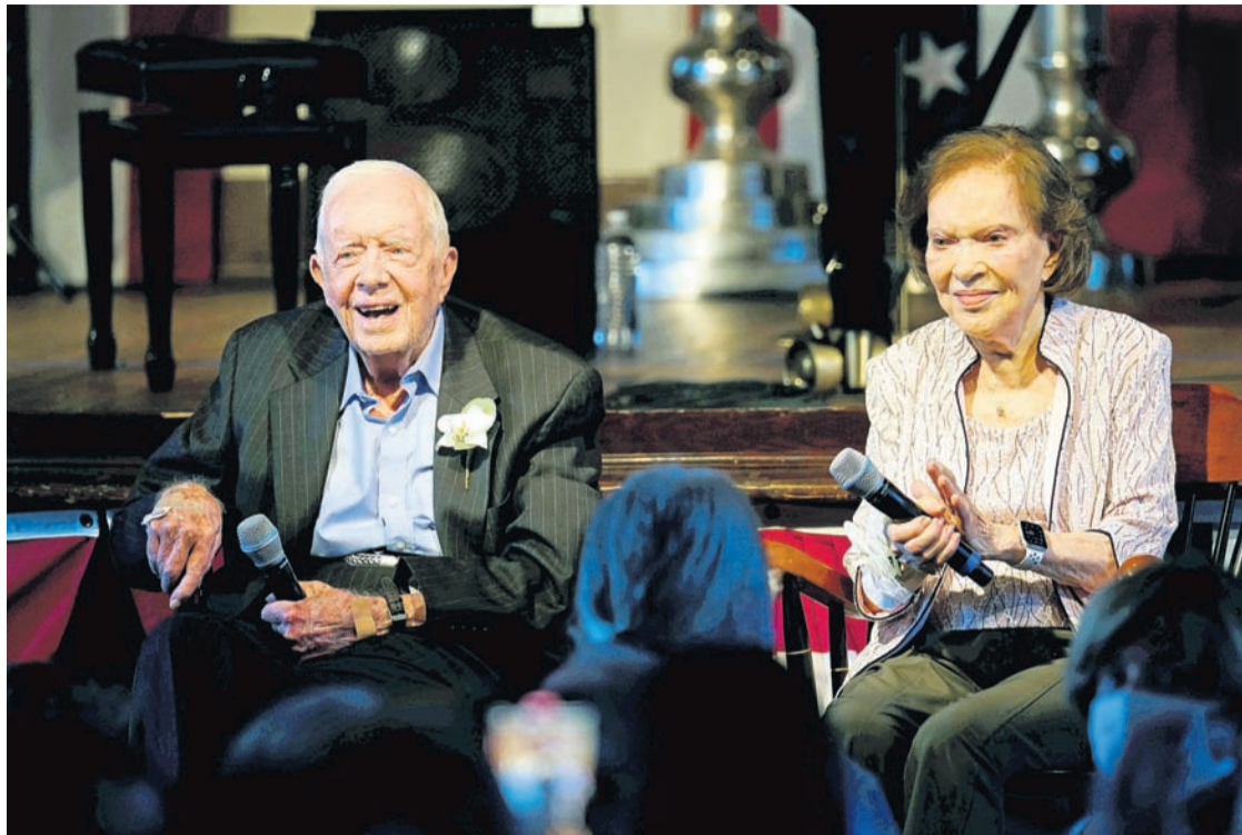
Former U.S. President Jimmy Carter and his wife, former first lady Rosalynn Carter, sit together during a reception to celebrate their 75th wedding anniversary, July 10, 2021, in Plains, Ga.

Many presidential aides insisted that her political instincts were better than her husband’s — they often enlisted her support for a project before they discussed it