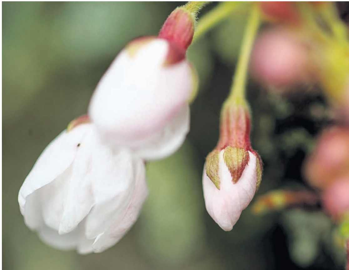
Cherry blossoms and buds cover the trees in the Kenwood neighborhood of Bethesda, Md., Tuesday, March 24, 2020.

Primack said he has noticed changes in his own garden: The fig trees are now surviving without extensive steps to protect them from winter cold. He has also spotted camellias in a Boston botanical garden and southern magnolia trees surviving the past few winters without frost damage. These species are all generally associated