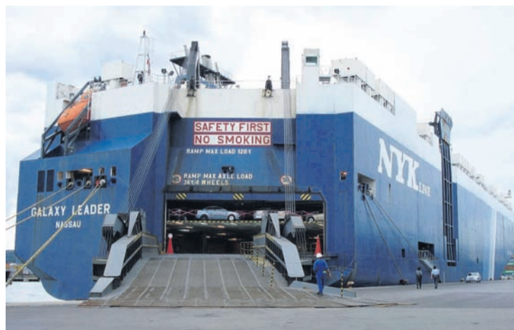
The Galaxy Leader is seen at the port of Koper, Slovenia on Sept. 16, 2008.

Israeli Prime Minister Benjamin Netanyahu's office had blamed the Houthis for the attack on the Bahamas-flagged Galaxy Leader , a vehicle carrier affiliated with an Israeli billionaire. It said the 25 crew members had a range of nationalities, including Bul-