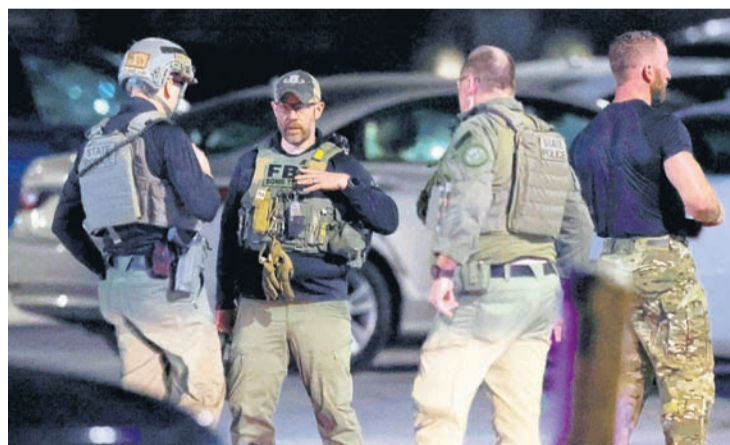
State police and an FBI bomb technician stand at a staging area in the parking lot of New Hampshire Hospital Friday, Nov. 17, 2023, in Concord, N.H.