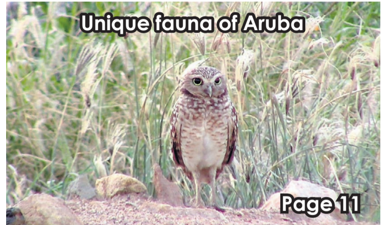
Unique fauna of Aruba