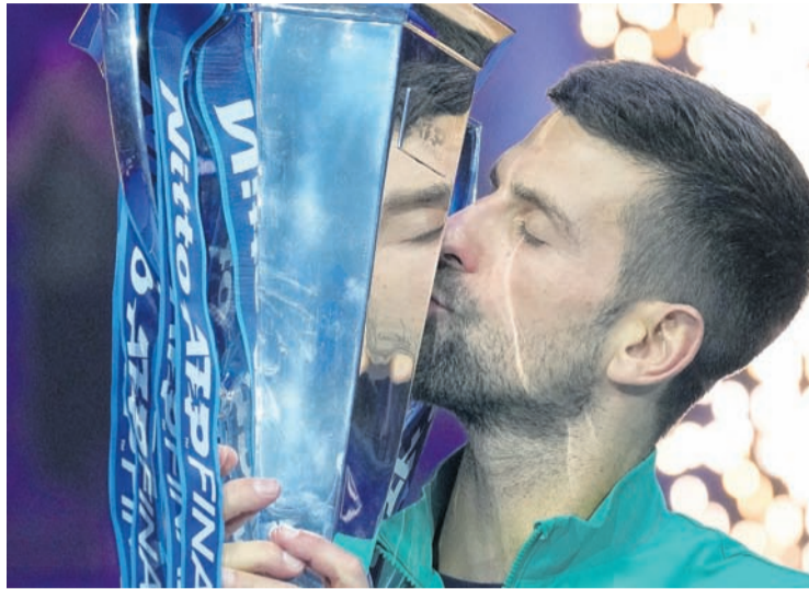
Serbia's Novak Djokovic kisses the trophy after winning the singles final tennis match of the ATP World Tour Finals at the Pala Alpitour, in Turin, Italy, Sunday, Nov. 19, 2023.

It was his fourth win over Sinner, who had recorded a first-ever victory against