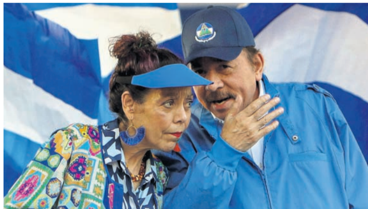
Nicaragua's President Daniel Ortega and his wife, Vice President Rosario Murillo, lead a rally in Managua, Nicaragua, Sept. 6, 2018.

According to a resolution approved by the OAS permanent council earlier this month, the OAS "will continue paying special attention to the situation in