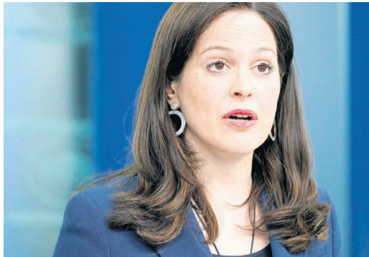
Anne Neuberger, Deputy National Security Advisor for Cyber and Emerging Technology, speaks during a news briefing at the White House, Monday, March 21, 2022, in Washington.

cyber and emerging technology. Neuberger said more districts need to take advantage of programs available that would better guard against online attackers who are increasingly targeting schools. Their aim is to lock up computer systems, and in some cases, steal and publish sensitive personal information if a ransom is not paid. "Compromises happens again and again, often in the same way, and there are defenses to protect against it. And here the government has really brought companies together, brought agencies together to deploy some of those," Neuberger said in an interview. "Don't give