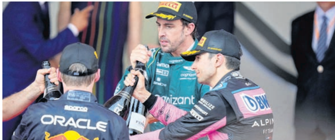
First place, Red Bull driver Max Verstappen of the Netherlands, left, celebrates on the podium with second place, Aston Martin driver Fernando Alonso of Spain, center, and third place, Alpine driver Esteban Ocon of France at the finish of the Monaco Formula One Grand Prix, at the Monaco racetrack, in Monaco, Sunday, May 28, 2023.

Sainz, meanwhile, was furious that Ferrari — a team with a worrying reputation for still making bad strategy calls — pitted him too early and put on the wrong tire