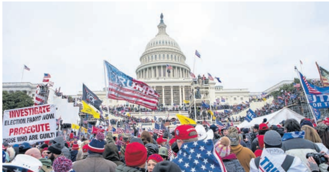
FILE - Insurrections loyal to President Donald Trump rally at the U.S. Capitol in Washington on Jan. 6, 2021. A growing number of Capitol rioters are facing hefty fines on top of prison sentences at their sentencing hearings. That's because prosecutors appear to be ramping up efforts to prevent them from profiting from their participation in the riot on Jan. 6, 2021. An Associated Press review of court records shows prosecutors in riot cases are increasingly asking judges to impose sentences that include fines to offset donations from supporters of the rioters.

Their fundraising success suggests that many people in the United States still view Jan. 6 rioters as patriots and