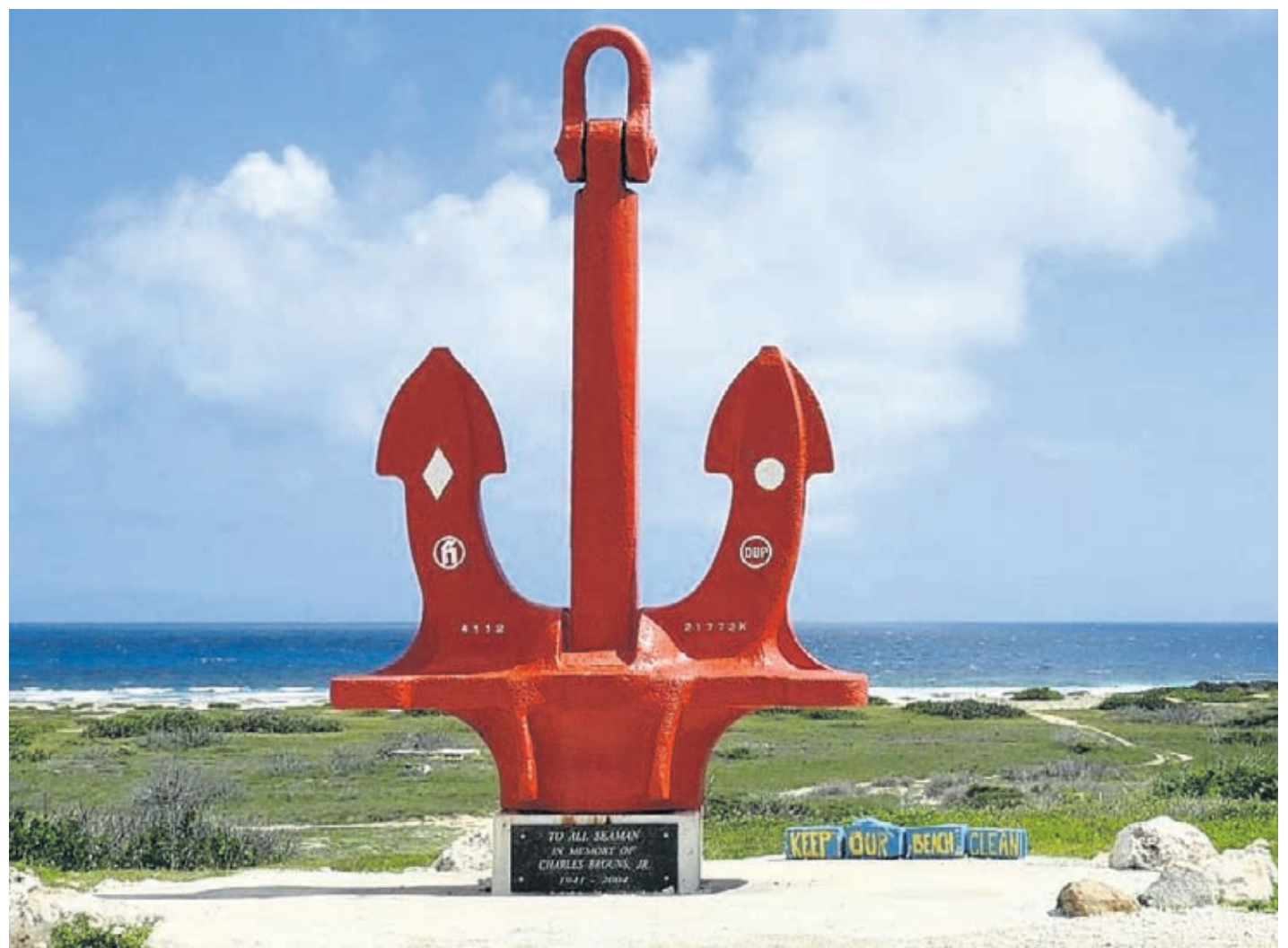
The Red Anchor situated at the entrance of former Lago Colony in San Nicolas

With that being said, I have to say, if you enjoy catching a sunrise, the anchor is one of the best places on the island to catch the sunrise. But in reality, anytime is a good time to visit, depending on your personal schedule. ☐