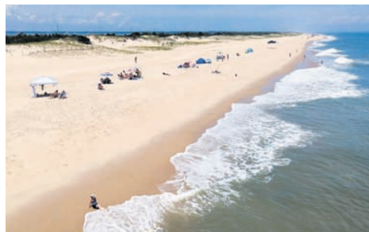
Waves crash near a beachgoer on July 13, 2022, in Rehoboth Beach, Del. Delaware is getting help from the federal government for its effort to use artificial intelligence to automatically trigger the evacuation of crowded beaches amid major flooding.