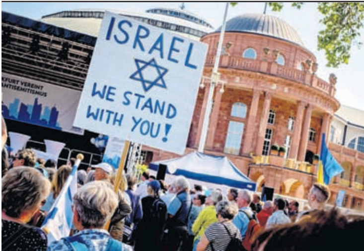
A woman holds a sign as she takes part in a demonstration against a concert later the day of former Pink Floyd musician Roger Waters in the Festhalle, background, in Frankfurt, Germany, Sunday, May 28, 2023. The Festhalle was the place where in the night of broken glasses 1938 about 3000 Jewish men were gathered to deport them to concentration camps.

BERLIN (AP) — Several Jewish groups, politicians and an alliance of civil society groups gathered for a memorial ceremony and a protest rally against a concert by Roger Waters in Frankfurt on Sunday evening.