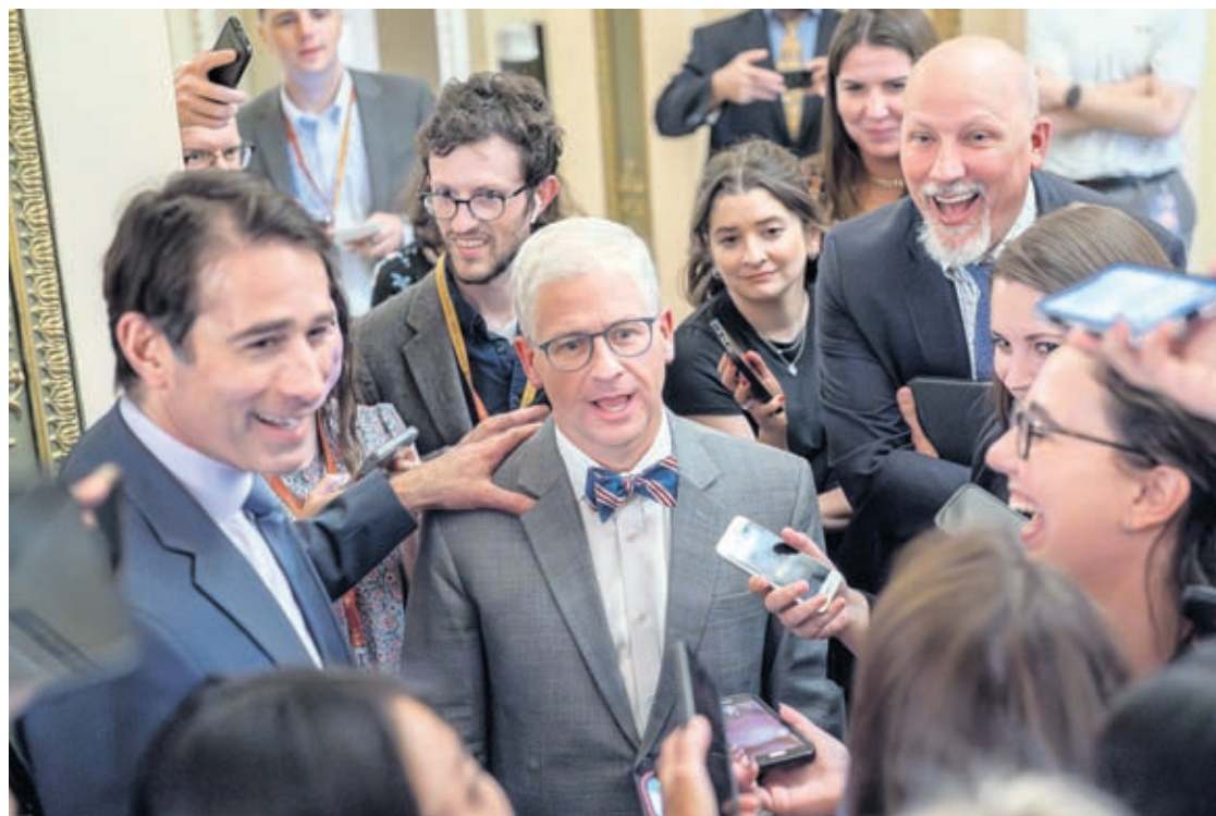
FILE - Top Republican debt crisis mediators Rep. Garret Graves, R-La., left, and Rep. Patrick McHenry, R-N.C., center, chairman of the House Financial Services Committee, with Rep. Chip Roy, R-Texas, upper right, have a laugh as they stop for questions by reporters on progress in the talks with the Biden administration, at the Capitol in Washington, Tuesday, May 23, 2023. Rep. Chip Roy, R-Texas, a member of the conservative House Freedom Caucus, has blasted the tentative debt ceiling deal struck by Speaker Kevin McCarthy, R-Calif., and President Joe Biden and says he will try to stop it in the House.

"Fake conservatives agree to fake spending cuts," tweeted Sen. Rand Paul,