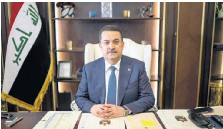
FILE - Prime Minister Mohammed Shia al-Sudani sits for a portrait in his office in Baghdad, Iraq, Wednesday, March 1, 2023. Mohammed Shia al-Sudani on Saturday, May 27, 2023, announced plans for a $17 billion regional transportation project intended to facilitate the flow of goods from Asia to Europe.

Milei has cut against the grain on many issues. He dismisses current concern over global warming by noting that "10 or 15 years ago there was a discussion that the planet was going to freeze." He calls sex education a post-Marxist program to destroy "the most important social core within society, which is the family." He's proposed "market mechanisms" to deal with long waiting lists for organ transplants, arguing that organs are a person's property to sell. □