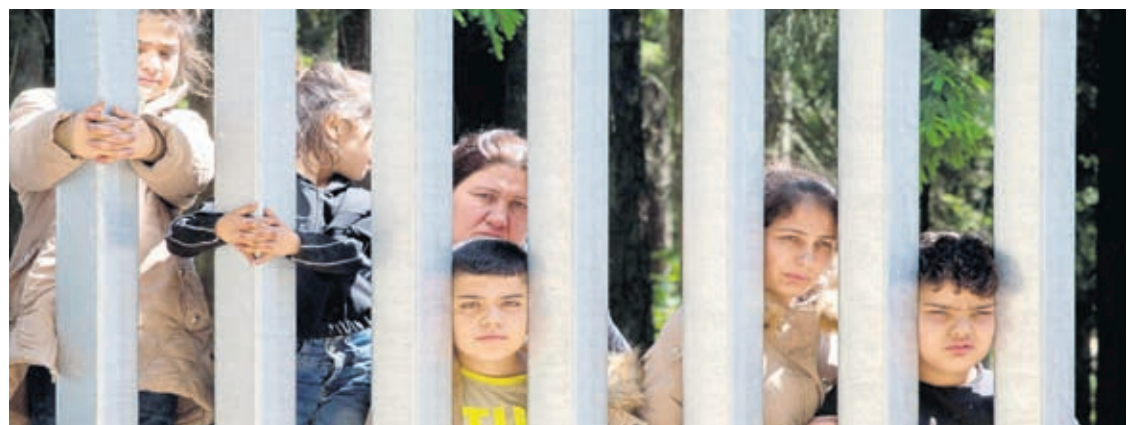
Members of a group of some 30 migrants seeking asylum are seen in Bialowieza, Poland, on Sunday, 28 May 2023 across a wall that Poland has built on its border with Belarus to stop massive migrant pressure. The group has remained stuck at the spot for three days, according to human rights activists.