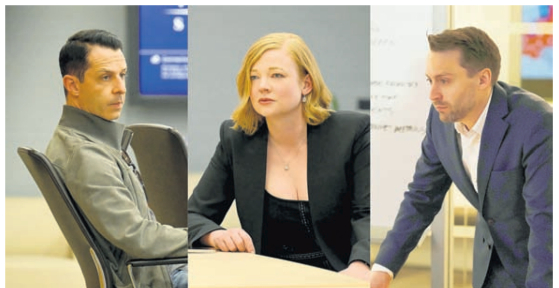
This combination of three separate photos shows Jeremy Strong as Kendall Roy, left, Sarah Snook as Shiv Roy, center, and Kieran Culkin as Roman Roy, from the HBO series "Succession."