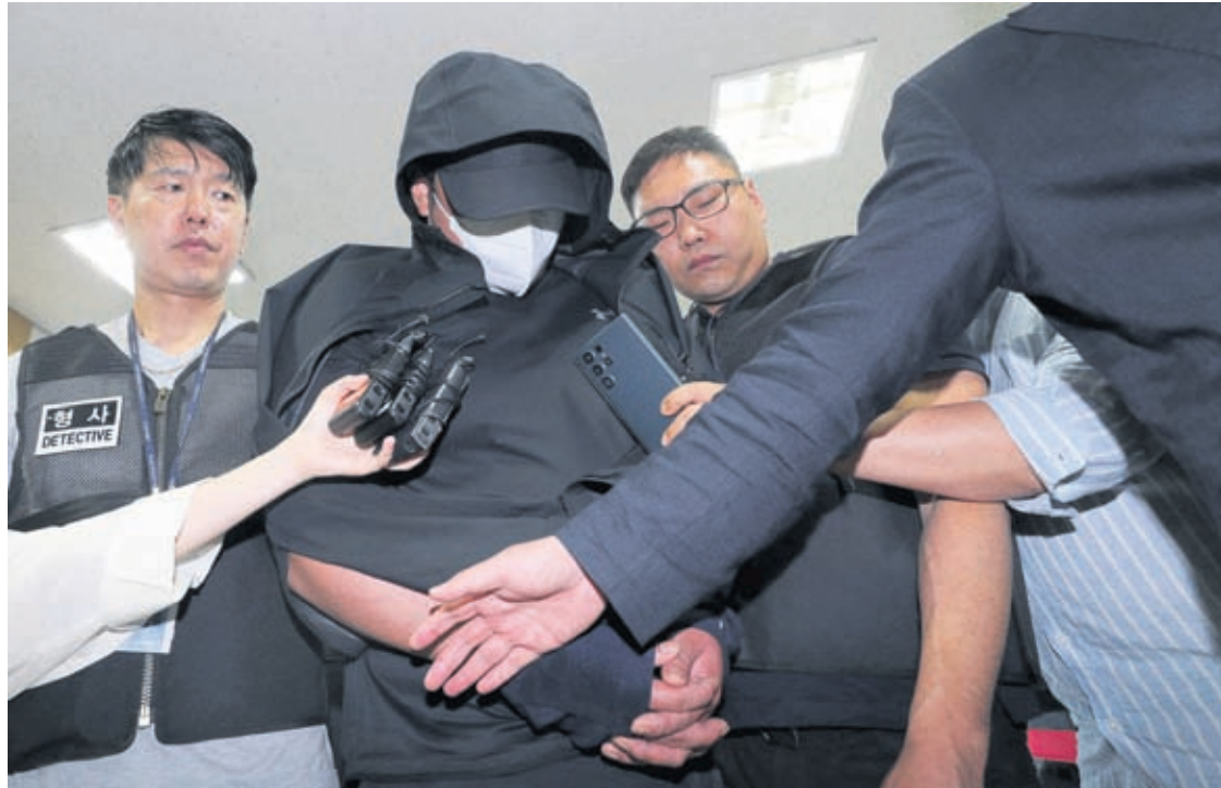
A man who opened an emergency exit door during a flight, arrives to attend an arrest warrant review at the Daegu District Court in Daegu, South Korea, Sunday, May 28, 2023. He told police that he felt suffocated and tried to get off the plane quickly as it approached landing, reports said Saturday.

Normally, the emergency exit doors cannot be opened mid-flight due to