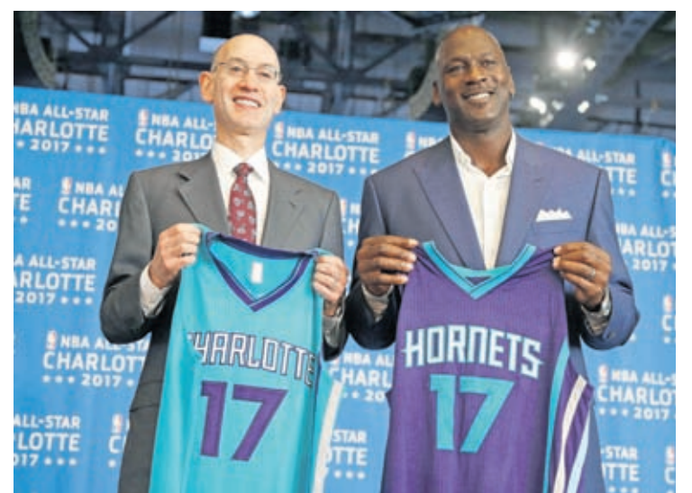
NBA commissioner Adam Silver, left, and Charlotte Hornets owner Michael Jordan, right, pose for a photo during a news conference to announce Charlotte, N.C., as the site of the 2017 NBA All-Star basketball game, June 23, 2015.

The sides originally had a Dec. 15 deadline to announce an intention to exercise the opt-out, then pushed it back to Feb. 8,