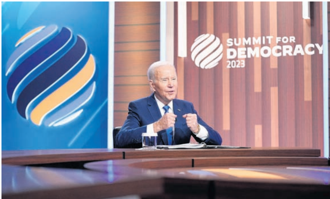
President Joe Biden speaks during a Summit for Democracy virtual plenary in the South Court Auditorium on the White House campus, Wednesday, March 29, 2023, in Washington.