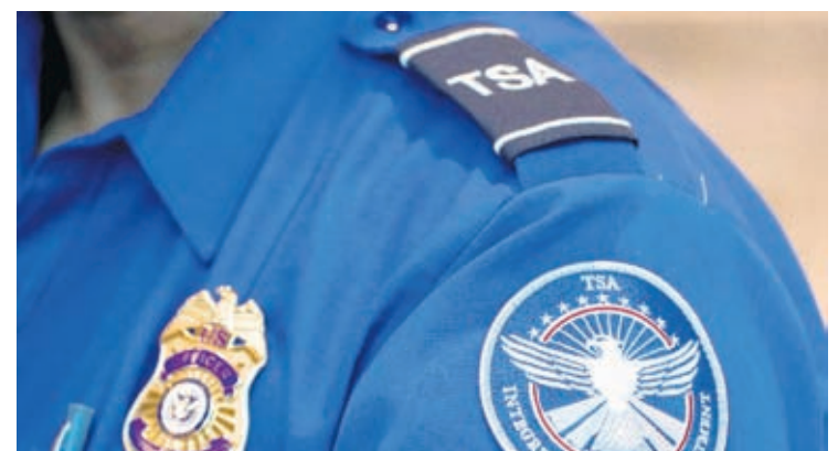
A Transportation Security Administration officer works at Dallas Love Field Airport on June 24, 2020, in Dallas.

"If Congress wants to further reduce air-rage incidents on aircraft, it should