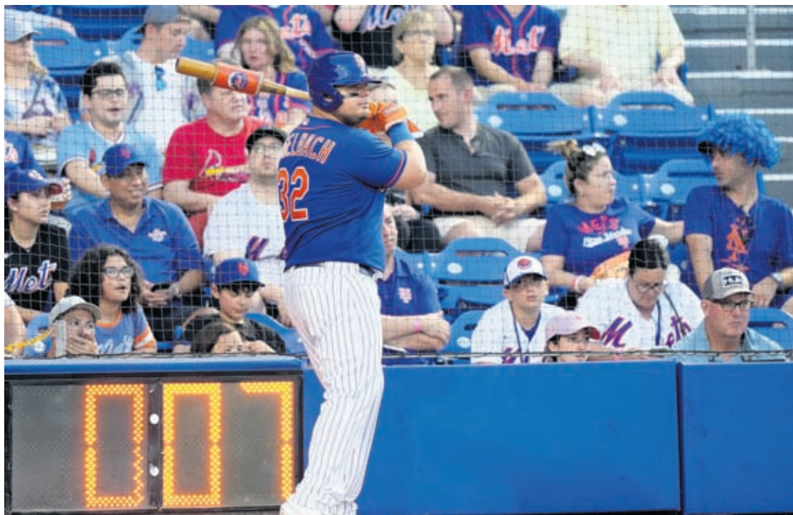
The pitch clock runs as New York Mets' Daniel Vogelbach (32) warms up on deck during the fifth inning of a spring training baseball game against the St. Louis Cardinals, Saturday, March 25, 2023, in Port St. Lucie, Fla.

Major League Baseball's new rules package is set for its regular-season de-