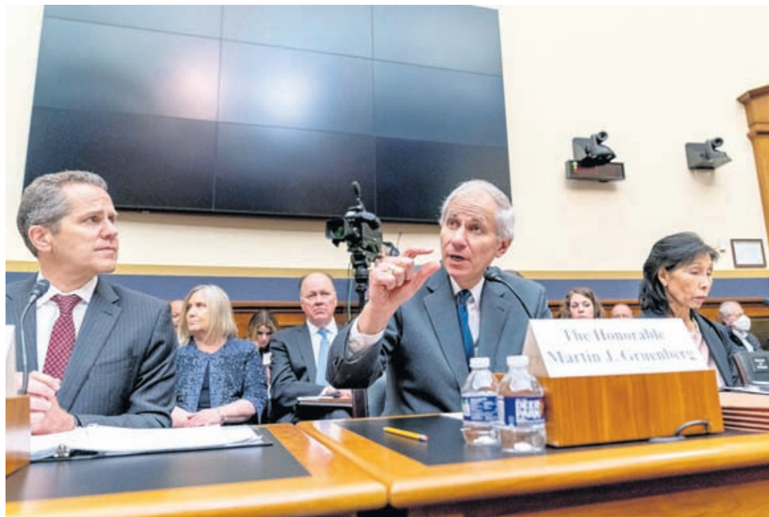
Federal Deposit Insurance Corporation Board of Directors Chairman Martin Gruenberg, center, accompanied by Federal Reserve Board of Governors Vice Chair for Supervision Michael Barr, left, and Treasury Department Under Secretary for Domestic Finance Nellie Liang, right, testifies at a House Financial Services Committee hearing on recent bank failures, on Capitol Hill, Wednesday, March 29, 2023, in Washington.

"That doesn't sound like a very urgent supervisory process," Rep. French Hill, an Arkansas Republican, said at Wednesday's hearing of the House Financial Services Committee into the collapse of Silicon Valley Bank and of New York-based Signature Bank on March 12. Signature Bank's collapse was the third-biggest in the nation's history. In response to the crisis, some Democrats are calling for stricter bank regulations. Specifically, they want to undo a law, championed by the Trump administration five years ago, that rolled back the strict-