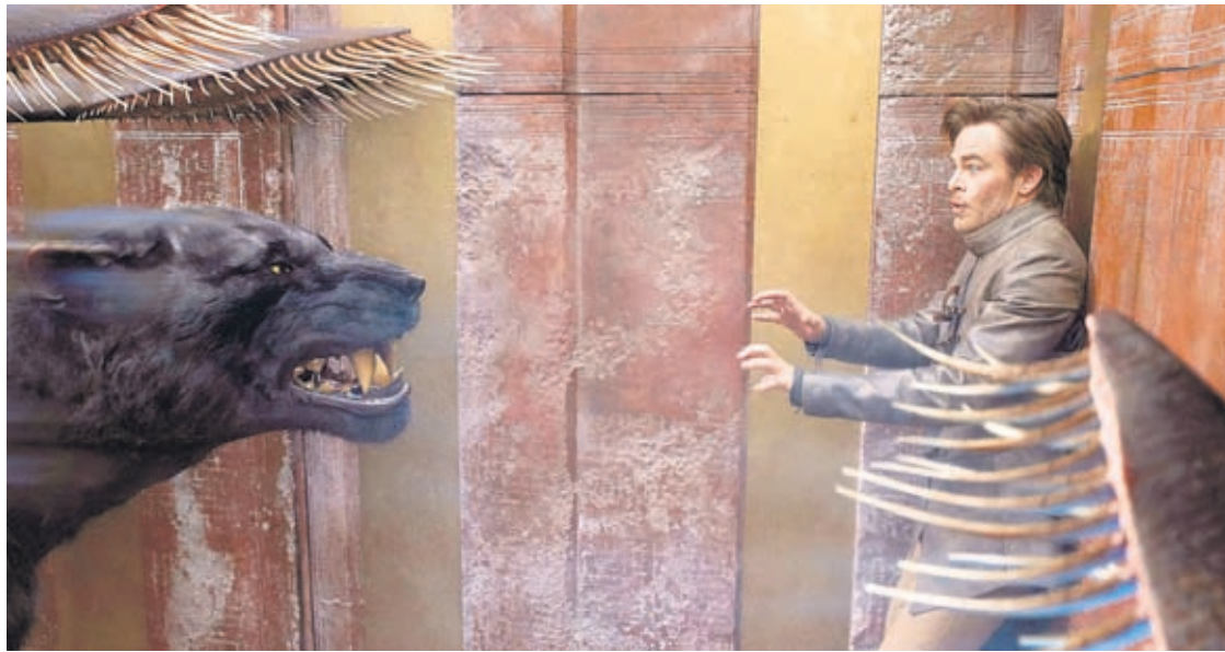
This image released by Paramount Pictures shows Chris Pine in a scene from "Dungeons & Dragons: Honor Among Thieves."

At least, for a newbie like me. I've never played the game, I confess. But this is a movie, not a game, and I'm here to tell you how it works for over two hours at the multiplex. Which is to say, surprisingly, sometimes delightfully well even if you have no clue what a paladin or Red Wizard or Harper is, or if the term "Dungeon Master" sends your mind straight to "Fifty Shades of Grey." The most obvious reason for this success, besides fleet-footed direction by Jonathan Goldstein and John Francis Daley, is star Chris Pine, whose sunny charisma and smooth knack for comedy, plus