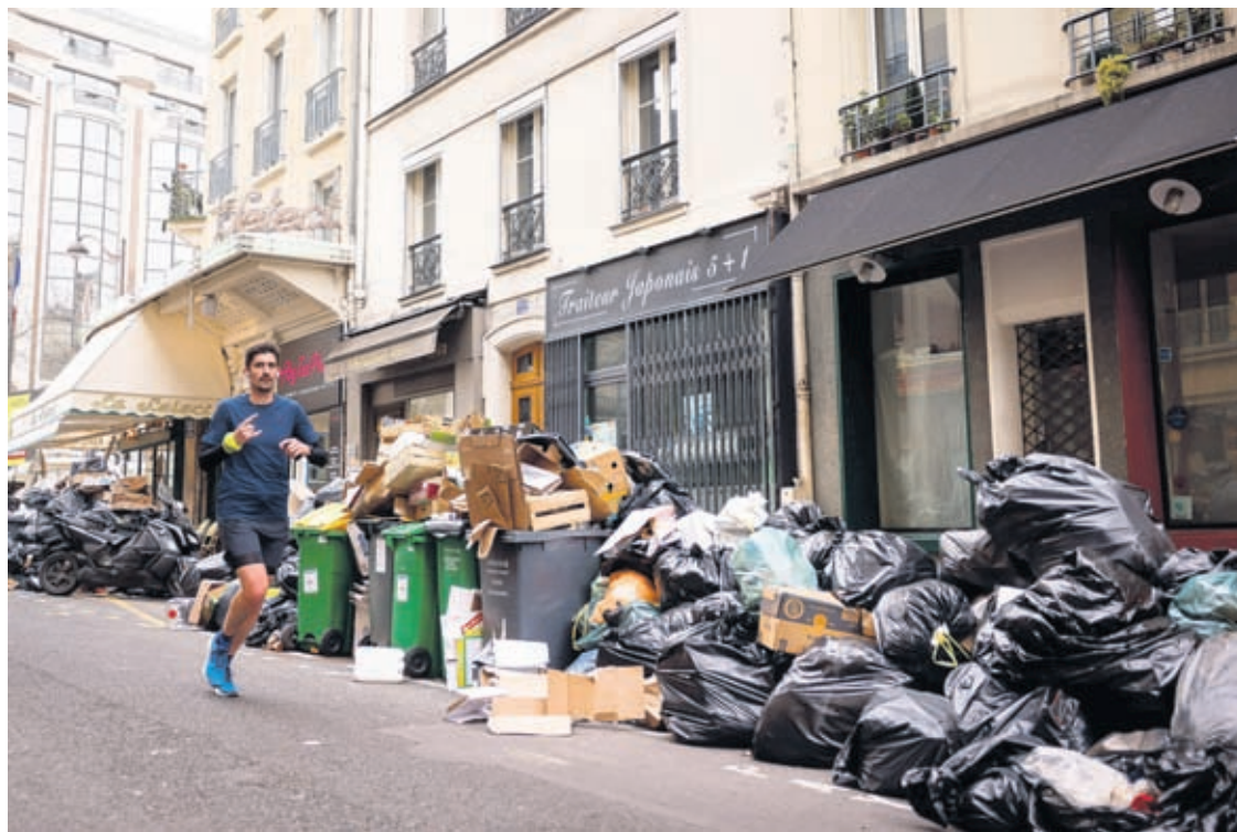
A man jogs past uncollected garbage bags Tuesday, March 28, 2023 in Paris.

Sanitation workers, who had blocked three incinerator plants and garbage truck depots, retire earlier