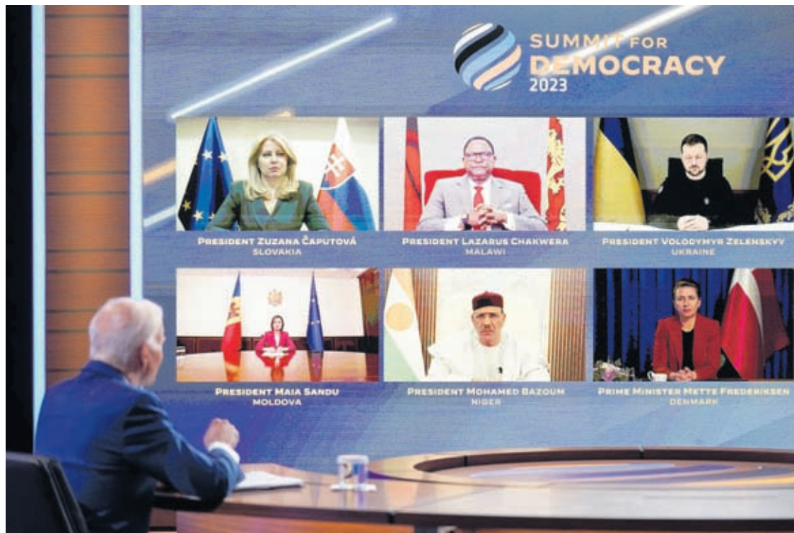
President Joe Biden speaks during a Summit for Democracy virtual plenary in the South Court Auditorium on the White House campus, Wednesday, March 29, 2023, in Washington.

The U.S. has come to an agreement with 10 other nations on guiding prin-