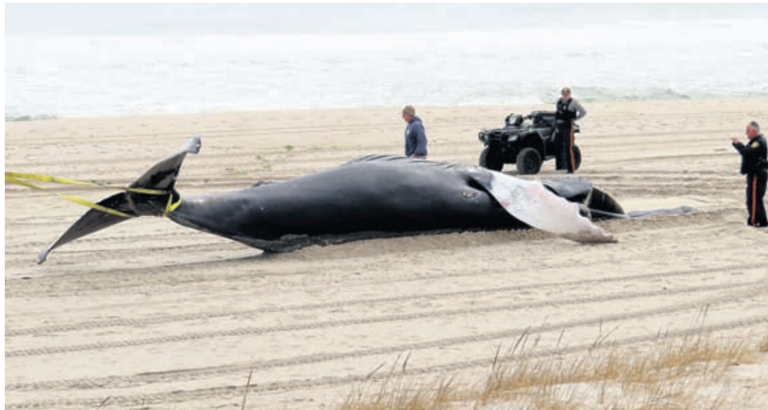
A police officer in Seaside Park N.J. photographs a dead whale on the beach on March 2, 2023. On Tuesday, March 28, Democratic U.S. Senators from four states called upon the National Oceanic and Atmospheric Administration to address a spate of whale deaths on the Atlantic and Pacific coasts.

Thus far, mostly Republican lawmakers have called for a pause or an outright halt to offshore wind farm preparation work, which they blame for the deaths of whales along the U.S. East Coast since December. But in their letter to a NOAA administrator, the Democratic senators conspicuously did not blame or even mention offshore