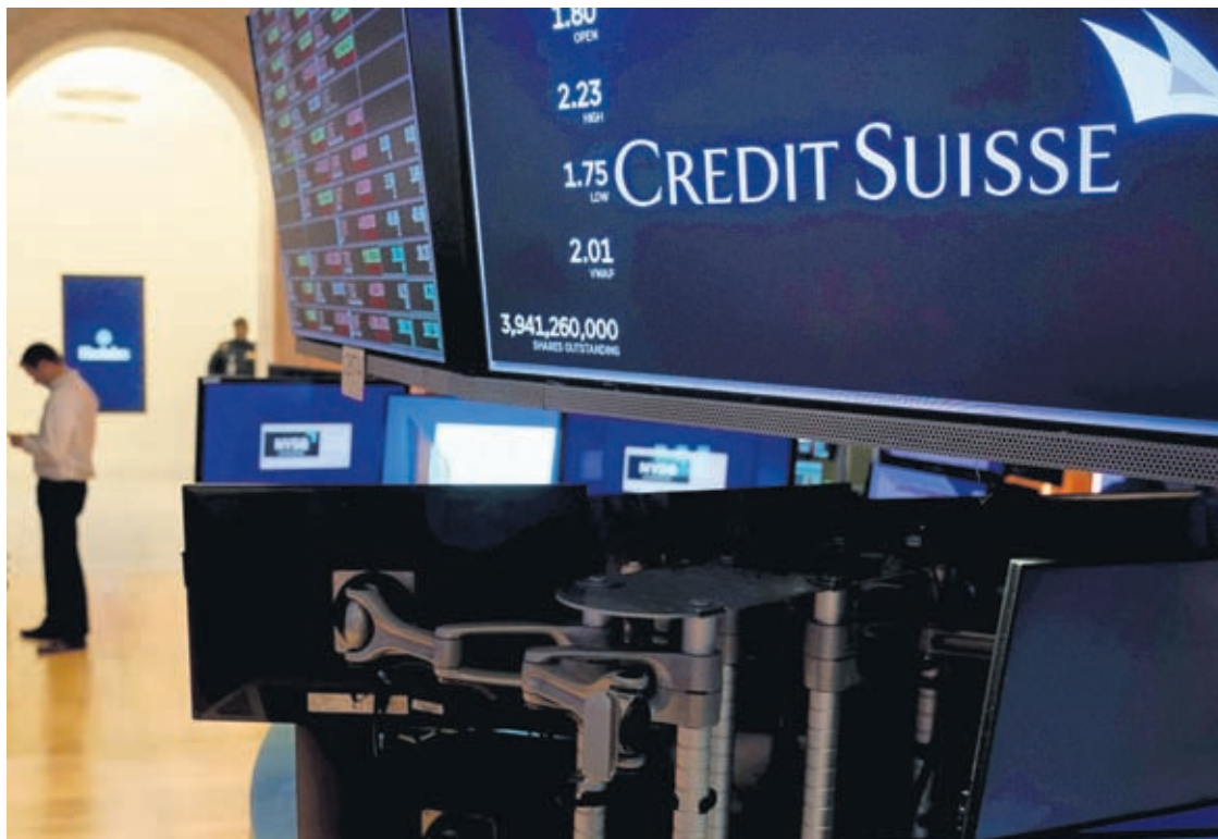
A sign displays the name of Credit Suisse on the floor at the New York Stock Exchange in New York, Wednesday, March 15, 2023.

"Credit Suisse got a discount on the penalty it faced in 2014 for enabling tax evasion because bank executives swore up and down they'd get out of the business of defrauding the United States," said Sen. Ron Wyden, the Democratic chairman of the committee. "This investigation shows Credit Suisse did not make good on that promise, and the bank's pending acquisition does not wipe the slate clean," he said. The Swiss government pressed for a $3.25 billion takeover of long-troubled Credit Suisse by rival bank UBS this month amid turmoil in the global financial system. The collapse of two U.S. banks ignited wider fears that sent shares of Switzerland's second-largest bank tumbling as