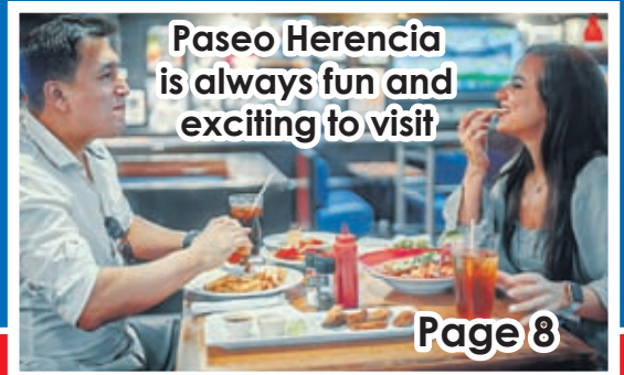
Paseo Herencia is always fun and exciting to visit