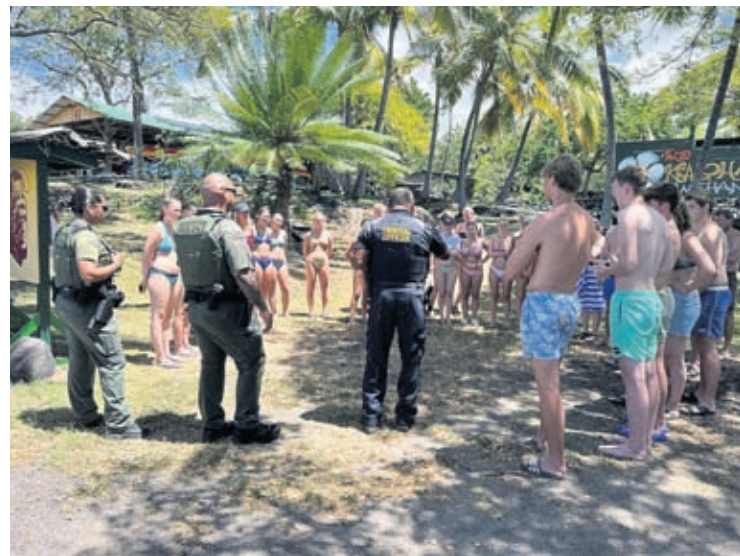
In this photo provided by the Hawaii Department of Land and Natural Resources, department enforcement officers speak to swimmers in Honaunau, Hawaii, March 26, 2023, after the swimmers allegedly harassed a pod of wild spinner dolphins.

HONOLULU (AP) — Hawaii authorities on Tuesday say