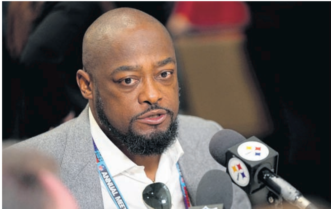
Pittsburgh Steelers head coach Mike Tomlin speaks during the AFC head coaches availability at the NFL meetings, Monday, March 27, 2023, in Phoenix.