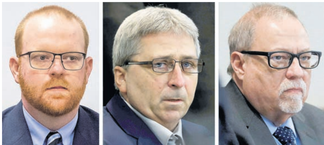
This photo combo shows, from left, Travis McMichael, William "Roddie" Bryan, and Gregory McMichael during their trial at the Glynn County Courthouse in Brunswick, Ga.

Moments after the verdicts were announced, Arbery's