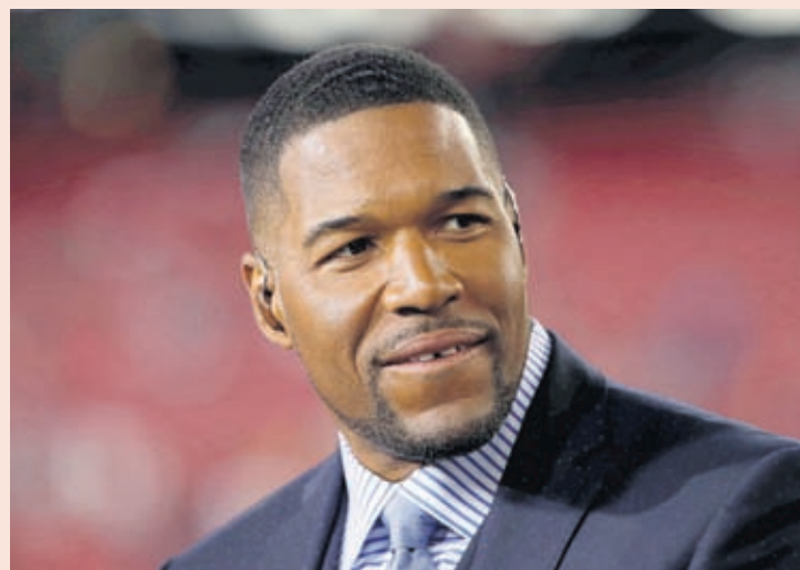
This Jan. 19, 2020 file photo shows Michael Strahan before the NFL NFC Championship football game between the San Francisco 49ers and the Green Bay Packers in Santa Clara, Calif.