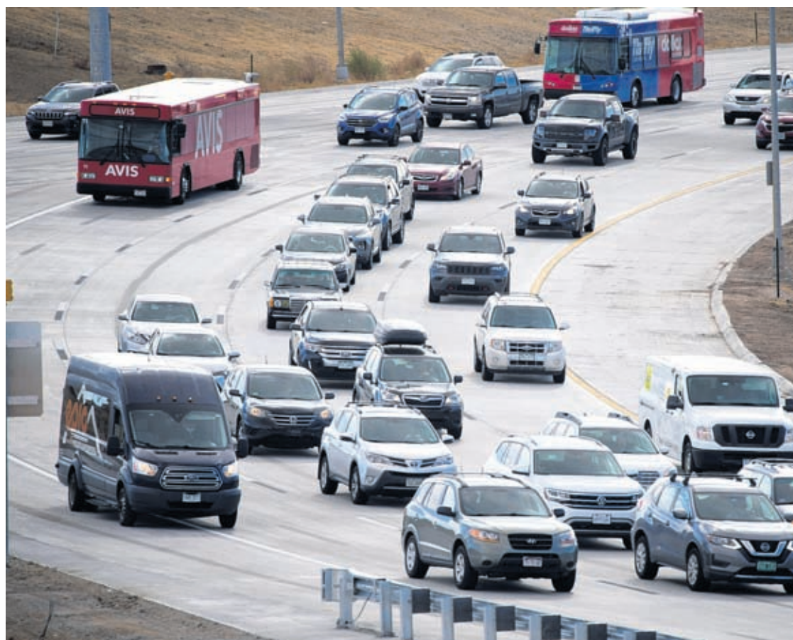
Motorists move slow on Pena Boulevard as traffic increases with the approach of the Thanksgiving Day holiday Tuesday, Nov. 23, 2021, at Denver International Airport in Denver.

The breakdowns started with bad weather in one part of the country and spun out of control. In the past, airlines had enough pilots, flight attendants and other workers to recover from many disruptions with-