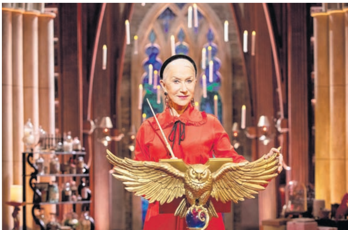
This image released by Turner Entertainment shows Helen Mirren hosting the quiz show "Harry Potter: Hogwarts Tournament of Houses."

Mirren's willingness to take on something different shouldn't raise eyebrows. She's celebrated for her regal roles — including "The Queen," "Elizabeth I" and "Catherine the Great" — but also counts the Fast & the Furious movie franchise among her varied credits. Her return to a comic book-