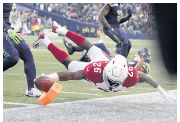
Arizona Cardinals running back Eno Benjamin (26) dives for the end zone against the Seattle Seahawks during the second half of an NFL football game, Sunday, Nov. 21, 2021, in Seattle.

Dallas fell five spots to No. 8 after losing to the Chiefs and will look to regain its winning ways when the Cowboys host Las Vegas