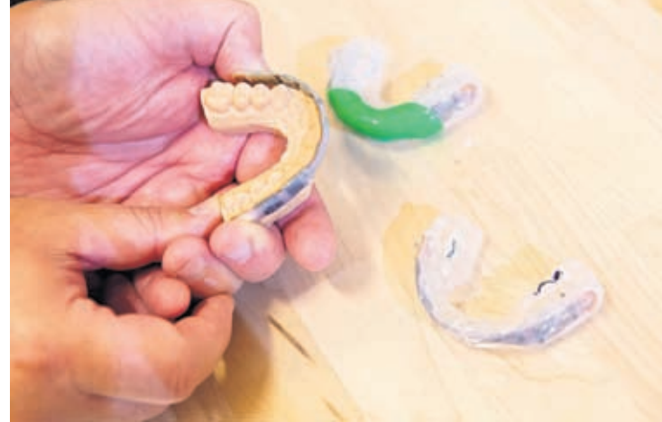
An engineer demonstrates on a player's mouth mold where the sensor will fit once installed into the mouthguard in Charlottesville, Va., Aug. 17, 2021.