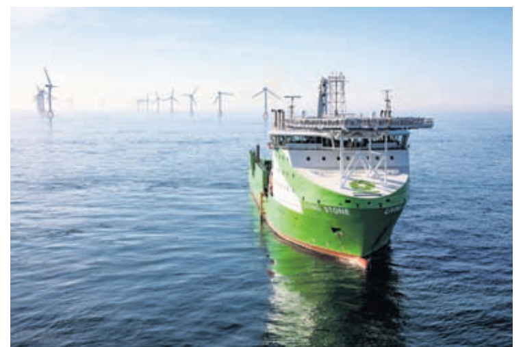
Two of the offshore wind turbines have been constructed off the coast of Virginia Beach, Va., Monday, June 29, 2020.

The project off the coast of Massachusetts, Vineyard Wind 1, is expected to produce about 800 megawatts, enough power for more than 400,000 homes. The first steps of construction will include laying down two transmission ca-