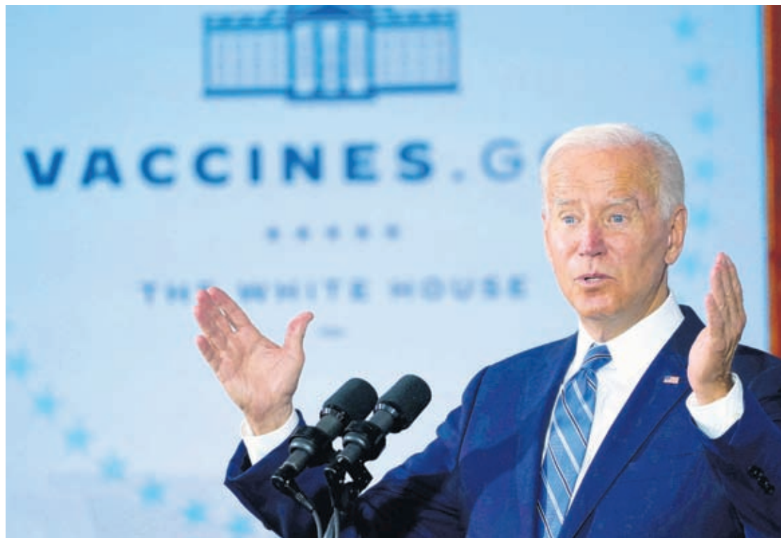
President Joe Biden speaks about COVID-19 vaccinations after touring a Clayco Corporation construction site for a Microsoft data center in Elk Grove Village, Ill., on Oct. 7, 2021.

Law enforcement agencies do lag behind in vaccines, with the Justice Department at 89.8%. The Department of Veterans Affairs is at 87.8% of partial vaccinations, though the