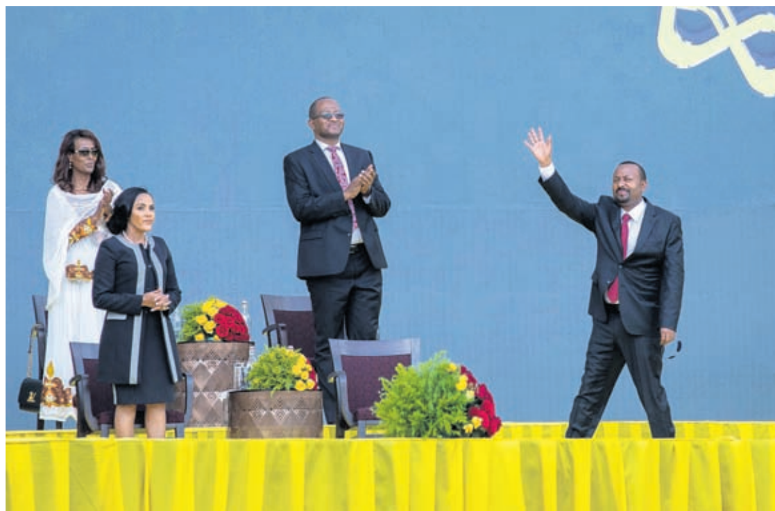
Ethiopia's Prime Minister Abiy Ahmed, right, and First Lady Zinash Tayachew, left, attend his inauguration ceremony after he was sworn in for a second five-year term, in the capital Addis Ababa, Ethiopia Monday, Oct. 4, 2021.

Abiy rocketed to office out of seemingly nowhere in 2018 with vows of dramatic reforms to a long-repressive national government. He also announced he would make peace with neighboring Eritrea after years of bitter conflict. For that, the youthful prime minister was awarded the Nobel Peace Prize.