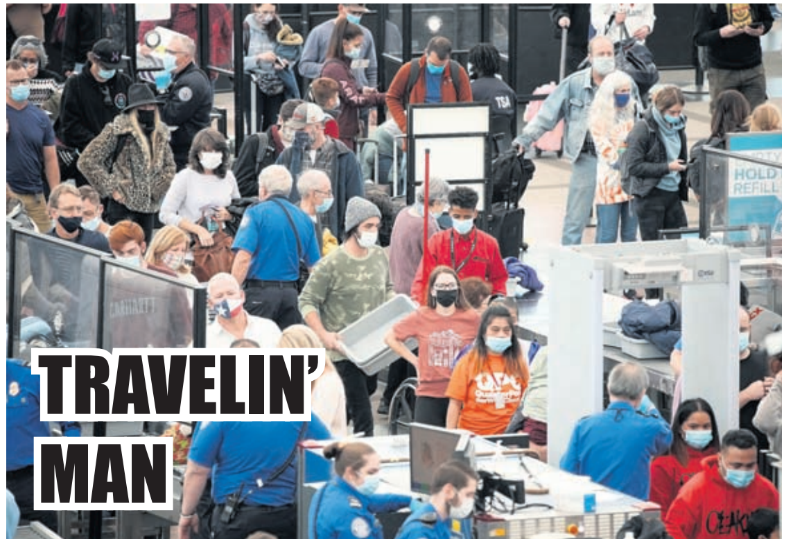
Travelers queue up at the south security checkpoint as traffic increases with the approach of the Thanksgiving Day holiday Tuesday, Nov. 23, 2021, at Denver International Airport in Denver.