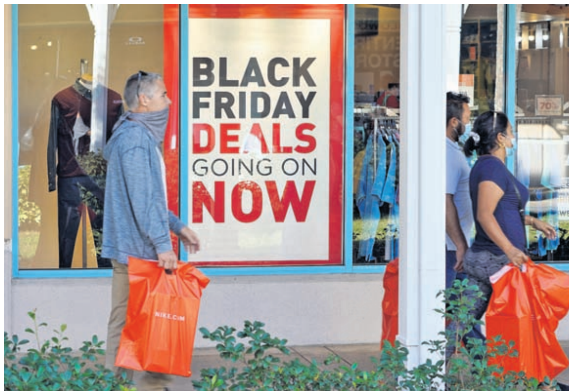
Shoppers wear protective face masks as they look for Black Friday deals at the Ellenton Premium Outlet stores Friday, Nov. 27, 2020, in Ellenton, Fla.

Retailers want you to fold under that pressure. They make most of their money around this time, Whelan says, during their "end-of-year push to sell products." You may face other pressures, too. "This year we have almost a perfect storm when it comes to spending," she says. "We