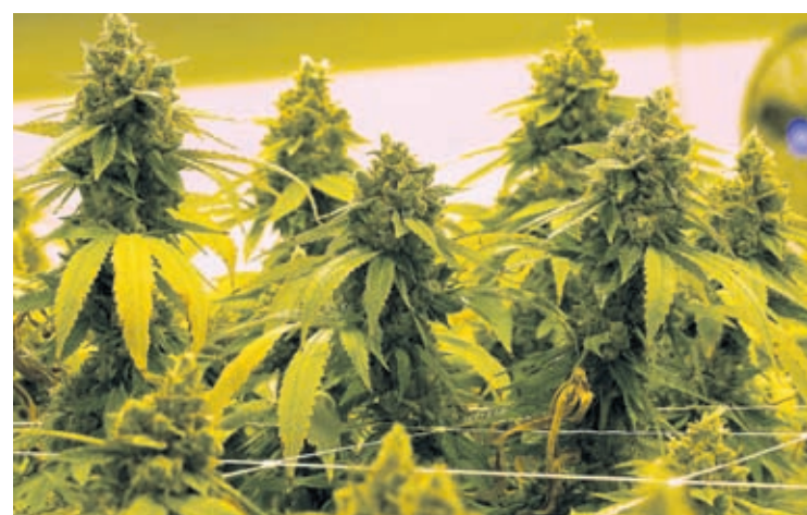
A cannabis plant that is close to harvest grows in a grow room at the Greenleaf Medical Cannabis facility in Richmond, Va., Thursday, June 17, 2021.