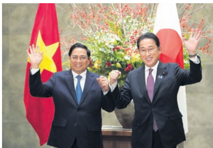
Vietnam's Prime Minister Pham Minh Chinh, left, and Japan's Prime Minister Fumio Kishida pose for photographers ahead of a meeting at the prime minister's official residence in Tokyo, Japan, on Wednesday, Nov. 24, 2021.