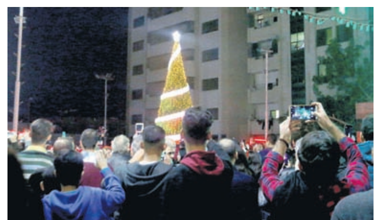
Palestinian Christians attend a Christmas tree lighting celebration in Gaza City, Tuesday, Dec. 3, 2019.

The ruling Islamic militant Hamas movement considers the Christians a protected minority. There had been a few attacks targeting Christians by Islamic zealots in the early years of Hamas' takeover, but the Is-