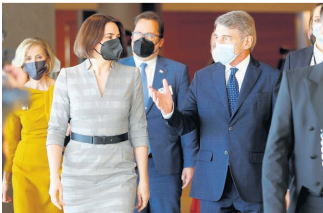
Belarusian opposition leader Sviatlana Tsikhanouskaya arrives with European Parliament President David Sassoli before addressing the European Parliament in Strasbourg, eastern France, Wednesday, Nov. 24, 2021.

BRUSSELS (AP) — Belarus opposition leader Sviatlana Tsikhanouskaya appealed Wednesday to the European Union not to forget the plight of ordinary citizens and political prisoners in the former Soviet country. Tsikhanouskaya's plea came as the EU prepares new sanctions in response to a security crisis at its borders blamed on Belarusian President Alexander Lukashenko. Tsikhanouskaya told EU lawmakers that "882 of my fellow citizens have been recognized to be in prison for exercising basic political rights people in the rest of Europe take for granted." She urged the 27-country bloc not to recognize Lukashenko or his government, and to boost support to ordinary citizens. "It is getting late. Since August 2020, there have been ample gestures and expressions of solidarity. Belarusians were praised for reigniting their faith in democracy and human dignity," she said. "Is it not the turn of Europeans to demonstrate their commitment to those values with action?" Her remarks come as the