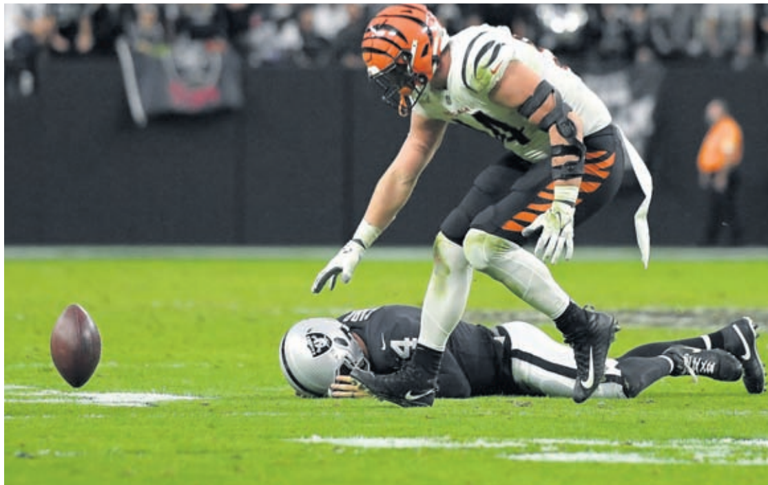
Cincinnati Bengals defensive end Sam Hubbard (94) recovers a fumble by Las Vegas Raiders quarterback Derek Carr (4) during the second half of an NFL football game, Sunday, Nov. 21, 2021, in Las Vegas.

Detroit (0-9-1) hosts Chicago (3-7) in the first game, a matchup between a winless team and one on a five-game losing streak. The Bears and Lions are familiar Thanksgiving foes, with this being their 19th meeting, two shy of the record held by Detroit and Green Bay. That game will be followed by the slumping Raiders