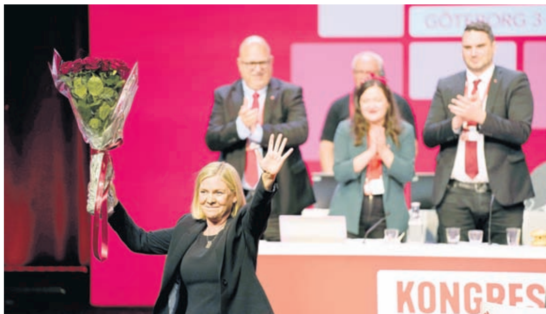
Sweden's Minister of Finance Magdalena Andersson gestures, after being elected to party chairman of the Social Democratic Party at the Social Democratic Party congress in Gothenburg, Sweden, Thursday, Nov. 4, 2021.

She said that "a coalition government should resign if a party chooses to leave the government. Despite the fact that the parliamentary situation is unchanged, it needs to be tried again." The speaker of Sweden's 349-seat parliament Andreas Norlen said he had received Andersson's resignation and will contact the