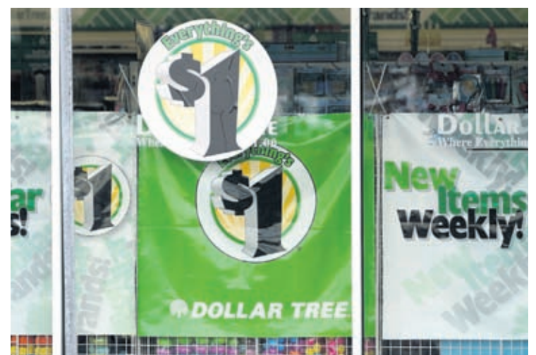
Dollar Tree store logos indicating that everything in the store is for $1 are promoted on a storefront window on Feb. 25, 2021, in Jackson, Miss.

The company's stock rose 9.2% on Tuesday following the announcement, which was paired with the company's quarterly earnings. Analysts at Citigroup called the earnings "disappoint-