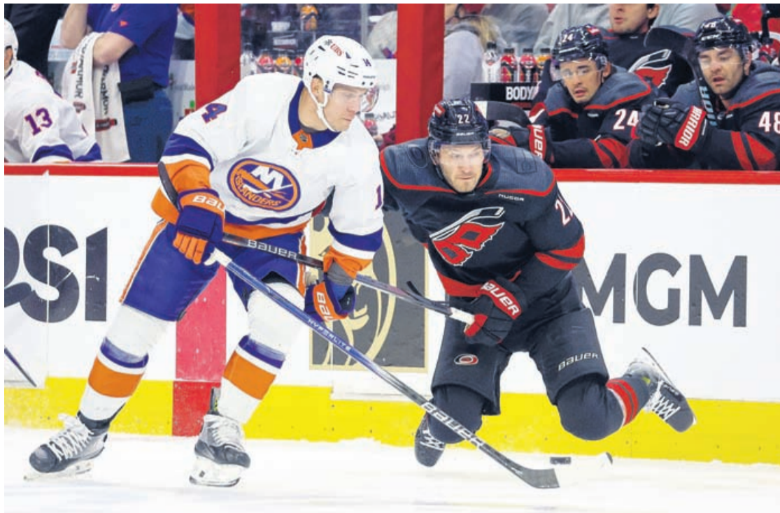
New York Islanders' Bo Horvat (14) collides with Carolina Hurricanes' Brett Pesce (22) during the first period in Game 2 of an NHL hockey Stanley Cup first-round playoff series in Raleigh, N.C., Monday, April 22, 2024.

Pesce's injury is the latest potentially significant one to crop up, leaving Game 2 against the New York Islanders hobbled following a noncontact play. Coach Rod Brind'Amour said afterward the situation was "not looking good," and it's the first major test of depth for