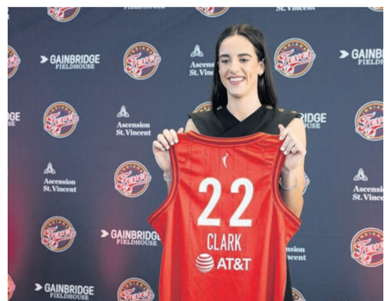
Indiana Fever's Caitlin Clark holds her jersey following a WNBA basketball news conference, Wednesday, April 17, 2024, in Indianapolis.

Clark's agents were working on the new Nike contract even before she announced she would turn pro instead of return to Iowa for a fifth season under the COVID-19 exemption offered to players in college during the 2020 pandemic season. □