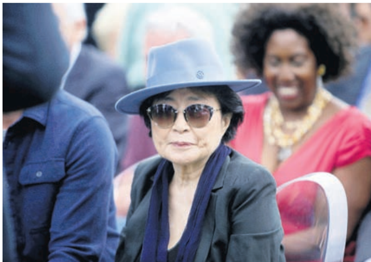
Yoko Ono appears before the dedication ceremony for her permanent art installation, a sculpture called SKYLANDING, at Jackson Park, Oct. 17, 2016, in Chicago.

and defended migrants through works of a wide-