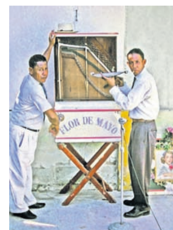
Fun fact: another name for the cah'i orgel is the "tingilingi box."

mahogany wood, it contains a cylinder with a maximum of eight music pieces. By rotating the lever on the front side of the box, the cah'i orgel produces music similar to that of a piano, and is accompanied often by someone else playing the "wiri", a percussion instrument made out of steel and reminiscent to the Spanish guiro. Back then, you would often also find someone playing the triangle alongside the cah'i orgel and wiri. In Aruba, the cah'i orgel and wiri is used for traditional music genres, such as the Aruban waltz, tumba, mazurka and more.