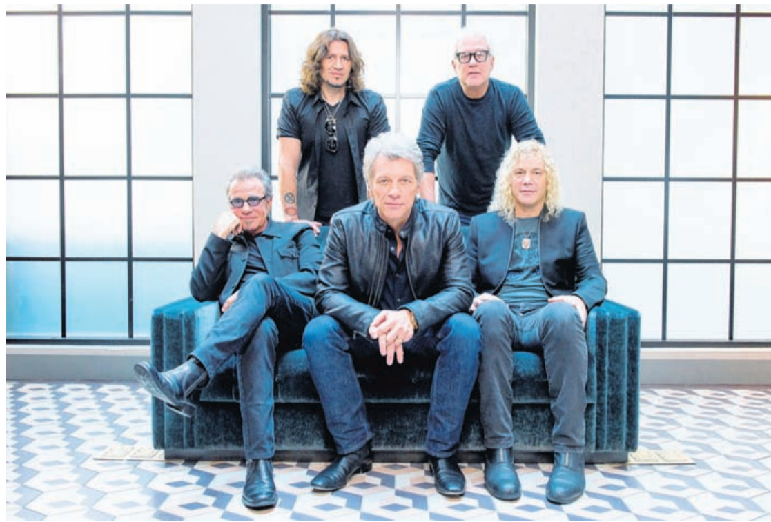
In this Oct. 19, 2016 file photo, members of Bon Jovi front row from left, Tico Torres, Jon Bon Jovi, David Bryan, back row from left, Phil X, and Hugh McDonald pose for a portrait in promotion of their album "This House is Not for Sale" in New York.

"This was unique. It wasn't a nodule. The strong (vocal cord) was pushing the weak one around, and suddenly, my inabilities were just exacerbated," said Bon Jovi. He underwent major surgery and is still recover-