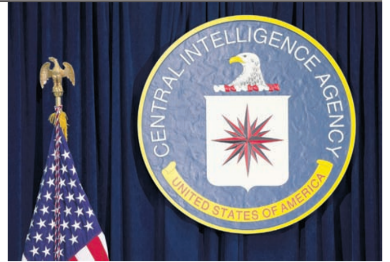
This April 13, 2016 file photo shows the seal of the Central Intelligence Agency at its headquarters in Langley, Va.

flood of sexual misconduct complaints at CIA and what several survivors described as a campaign to keep them from speaking out by failing to ensure their anonymity and saying it could harm national security. An AP investigation last year found the accusations ranged from lewd remarks about sexual fantasies to unwanted touching and sexual assaults. In one case, a senior manager allegedly showed up at a subordinate's house at night with a firearm and demanded sex. Last year, a CIA officer trainee was found guilty in Virginia of charges accusing him of assaulting a coworker with a scarf and trying to kiss her inside a stairwell at the agency's headquarters. The victim in