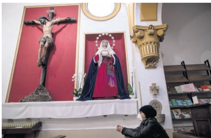
A woman prays at the San Ramon Nonato church after an Easter Holy Week procession was cancelled due to the coronavirus outbreak in Madrid, Spain, Thursday, April 9, 2020.