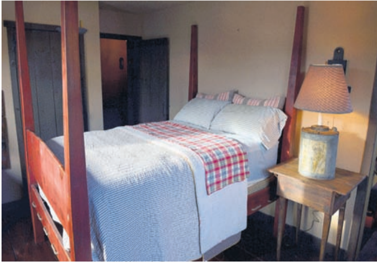
This Nov. 11, 2013 file photo shows a bedroom built by Mike Spangler using some reclaimed materials, in Belle, W.Va.