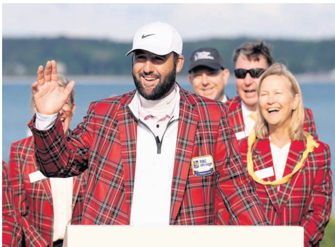
Scottie Scheffler waves after winning the weather delayed RBC Heritage golf tournament, Monday, April 22, 2024, in Hilton Head Island, S.C.

Her swing is so pure that even the late Mickey Wright, regarded as the greatest LPGA player, took notice in a 2017 Golf Digest interview. That was a year