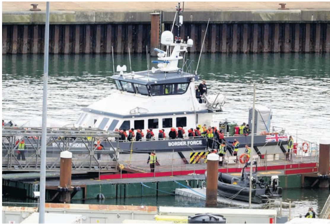
A group of people thought to be migrants are brought in to Dover, Kent, by the Border Force following a small boat incident in the Channel, on Tuesday April 23, 2024.