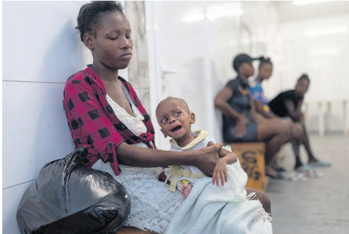
A malnourished child waits to be treated at a Doctors Without Borders emergency room in the Cite Soleil neighborhood of Port-au-Prince, Haiti, Friday, April 19, 2024.

It's a familiar scene repeated daily at hospitals and clinics across Port-au-Prince, where life-saving medication and equipment is dwindling or altogether absent as brutal gangs tighten their grip on the capital and beyond. They have blocked