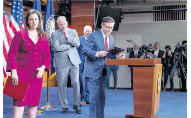
Speaker of the House Mike Johnson, R-La., center, and the House Republican leadership, from left, Rep. Elise Stefanik, R-N.Y., chair of the House Republican Conference, House Majority Whip Tom Emmer, R-Minn., and House Majority Leader Steve Scalise, R-La., depart after meeting with reporters as Johnson pushes towards separate votes on aid for Israel and Ukraine, at the Capitol in Washington, Tuesday, April 16, 2024.

either stitch it back together or send the components to the Senate for final passage, and potentially onto the White House for the president's signature. All told, it would require the speaker to cobble together bipartisan majorities with different factions of House Republicans and Democrats on each measure. Additionally, Johnson is preparing a fourth measure that would include various Republican-preferred national security priorities, such as a plan to seize some Russian assets in U.S. banks to help fund Ukraine and another to turn the economic aid for Ukraine into loans. It could also include provisions to sanction Iran over its weekend attack