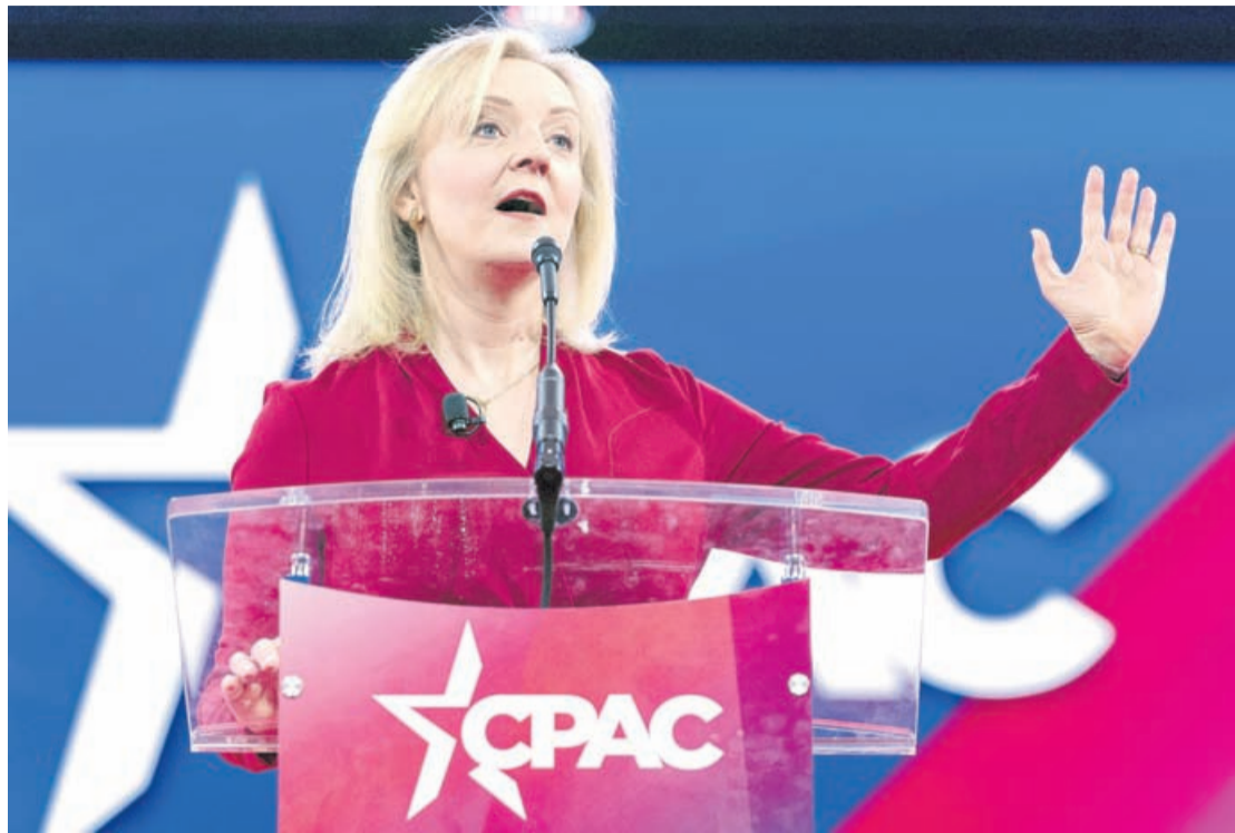
Former British Prime Minister Liz Truss speaks during the Conservative Political Action Conference, 2024 CPAC, at the National Harbor in Oxon Hill, Md. on Feb. 22, 2024.