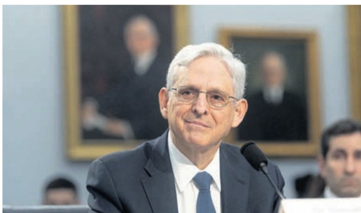
Attorney General Merrick Garland testifies before the House Committee on Appropriations, Subcommittee on Commerce, Justice, Science, and Related Agencies budget hearing on Capitol Hill, Monday, April 15, 2024, in Washington.

WASHINGTON (AP) — Attorney General Merrick Garland told lawmakers on Tuesday that President Joe Biden has shown no signs of cognitive impairment while defending Biden's ability to serve as commander in chief. Garland, appearing before a House committee overseeing funding for the Justice Department, was answering questions on the report from special counsel Robert Hur about Biden's handling of classified material. Hur's report concluded in no criminal charges yet made some observations about Biden's mental state that infuriated the Democratic president and his aides. The attorney general, while stressing that he was not commenting on the specifics of Hur's analysis, said that based on his own observations while interacting with Biden, he has "complete confidence in the president" when it comes to questions about his mental fitness. □