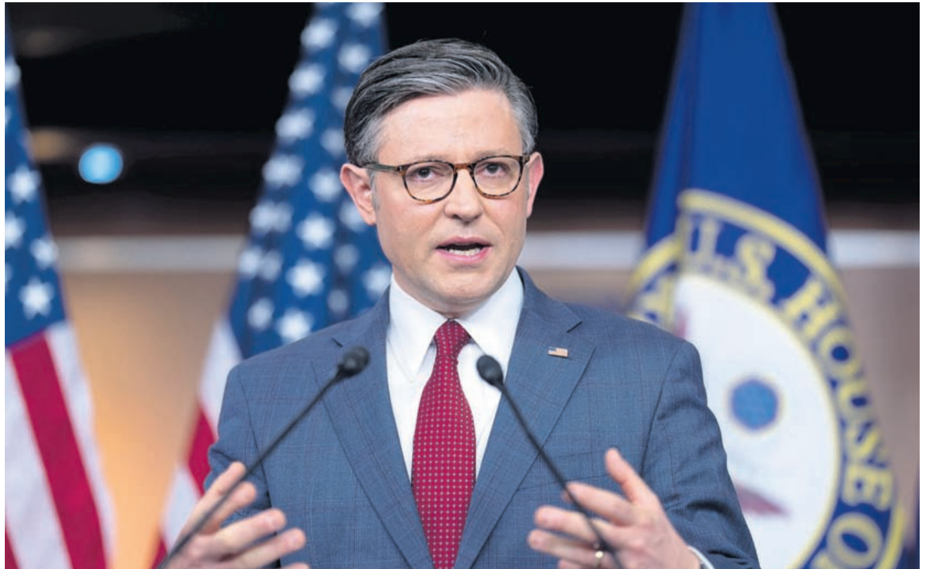
Speaker of the House Mike Johnson, R-La., and the House Republican leadership meet with reporters following a closed-door Republican strategy session as Johnson pushes towards separate votes on aid for Israel and Ukraine, at the Capitol in Washington, Tuesday, April 16, 2024.