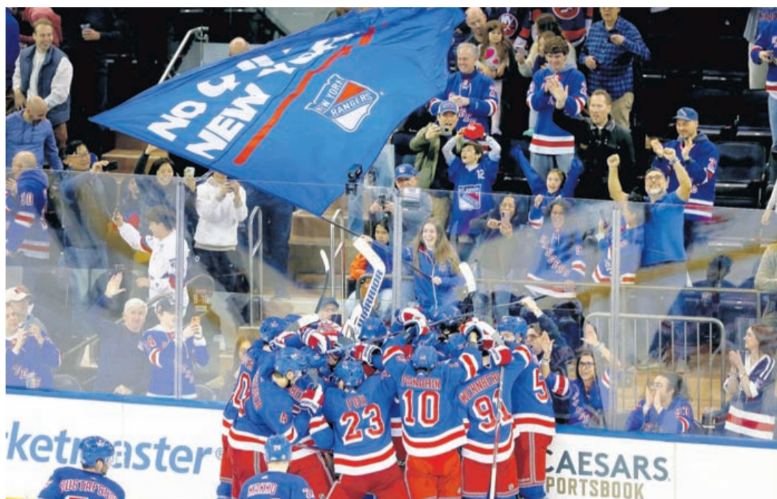
The New York Rangers and fans celebrate a shootout victory over the New York Islanders in an NHL hockey game April 13, 2024, in New York.

Commissioner Gary Bettman says it starts with the game on the ice, which he believes has “never been more exciting, more competitive, more skillful, never been faster.” There are nearly six goals a game on average, and while Sidney Crosby and Alex Ovechkin are still producing, Connor McDavid, Auston Matthews and Nathan MacKinnon are in their prime with another wave of talent led by the likes of Connor Be-