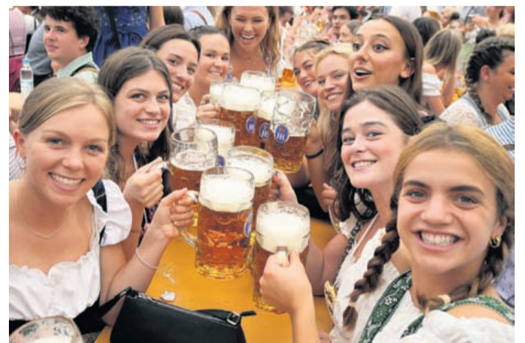
Women with glasses of beer pose for a photo on day one of the 188th 'Oktoberfest' beer festival in Munich, Germany, Saturday, Sept. 16, 2023.