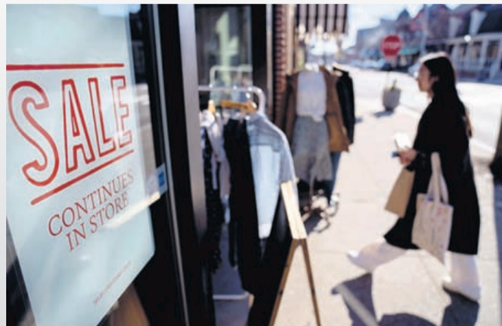
A shop holds a sidewalk sale on Feb. 10, 2023, in Providence, R.I.