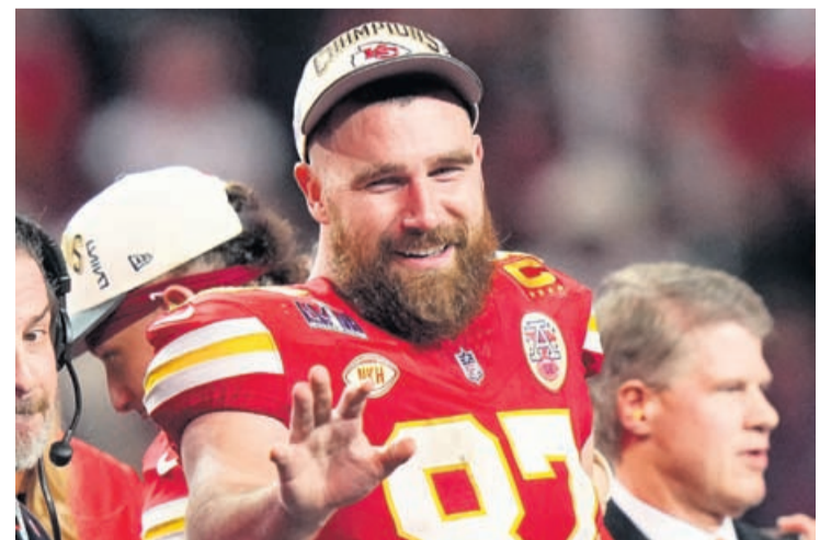
Kansas City Chiefs tight end Travis Kelce (87) waves after the NFL Super Bowl 58 football game against the San Francisco 49ers Sunday, Feb. 11, 2024, in Las Vegas.

He starred in his own 2016 dating competition show for E! called "Catching Kelce" and hosted an episode of "Saturday Night Live" last year. □