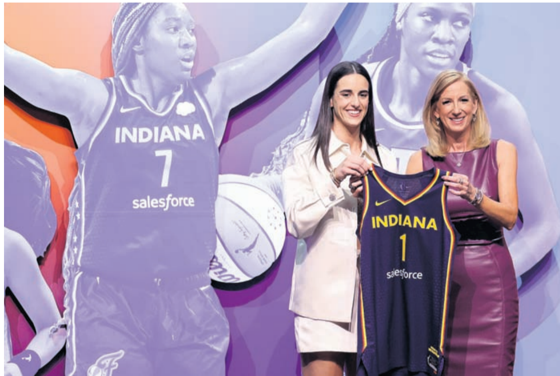
Iowa's Caitlin Clark, left, poses for a photo with WNBA commissioner Cathy Engelbert, right, after being selected first overall by the Indiana Fever during the first round of the WNBA basketball draft, Monday, April 15, 2024, in New York.

The Fever taking Clark had been a foregone conclusion since she announced on Feb. 29 she would turn pro. Nearly 17,000 tickets