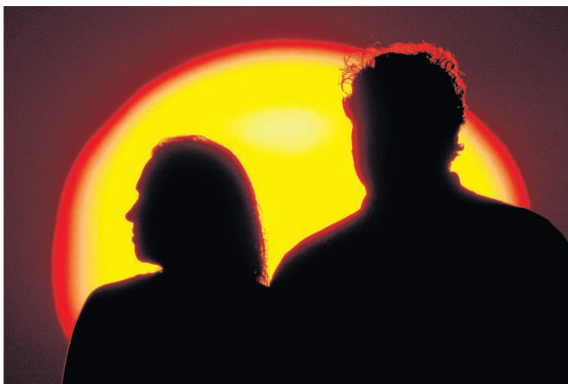
A couple watches the sun set from a park, July 10, 2021, in Kansas City, Mo.