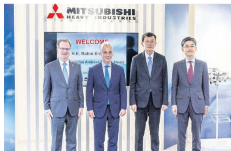
In this photo provided by U.S. Embassy in Japan, U.S. Ambassador to Japan, Rahm Emanuel, center left, poses with the officials of Mitsubishi Heavy Industries (MHI) and Lockheed, during his visit to a MHI's F-35 fighter jet final assembly and inspection plant in the town of Toyoyama in the Aichi prefecture, western Japan, Tuesday, April 16, 2024.