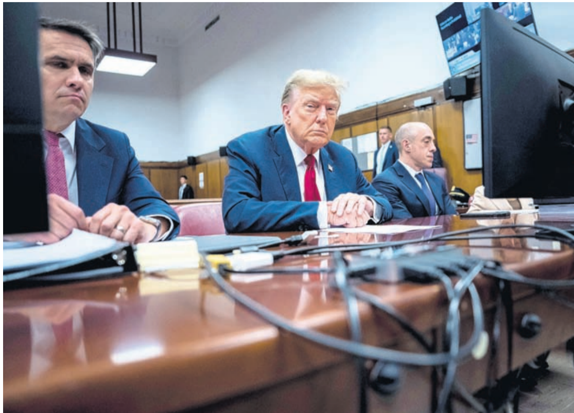
Former President Donald Trump sits in Manhattan criminal court with his legal team in New York, April 15, 2024.

Trump has made the prosecutions against him a centerpiece of his campaign and argued without evidence that Biden, a Democrat, engineered the cases. That argument helped him consolidate GOP support during the Republican primary, but a conviction might influence how many