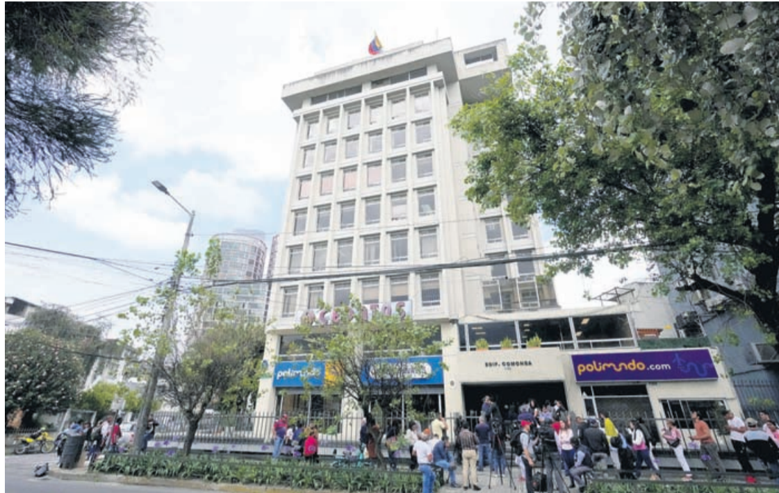
People stand outside the Venezuelan embassy in Quito, Ecuador, Tuesday, April 16, 2024.

The extraordinarily unusual use of force drew immediate condemnation from governments around the world, because diplomatic premises are considered foreign soil and "inviolable" under the Vienna treaties.