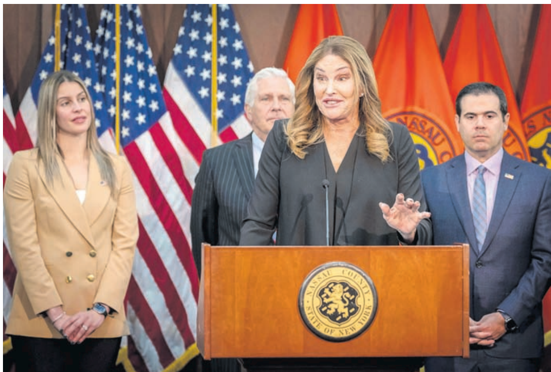
Caitlyn Jenner speaks at a press conference, Monday, March 18, 2024, in Mineola, N.Y.