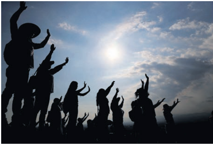
Visitors hold their hands out to receive the sun's energy as they celebrate the Spring equinox atop the Pyramid of the Sun in Teotihuacan, Mexico, Thursday, March 21, 2019.