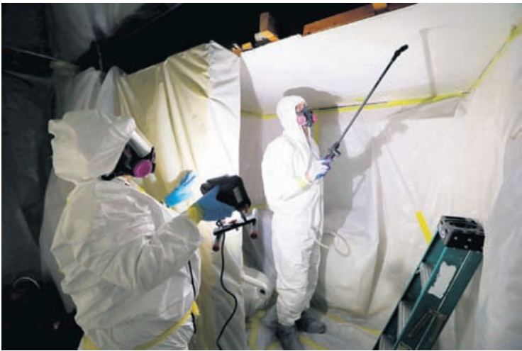
Asbestos Removal Technologies Inc. staff work on asbestos abatement in Howell, Mich., Oct. 18, 2017.

such as brake linings and gaskets and is used to manufacture chlorine bleach and sodium hydroxide, also known as caustic soda, including some that is used for water purification. EPA Administrator Michael Regan called the final rule a major step to protect public health. "With today's ban, EPA is finally slamming the door on a