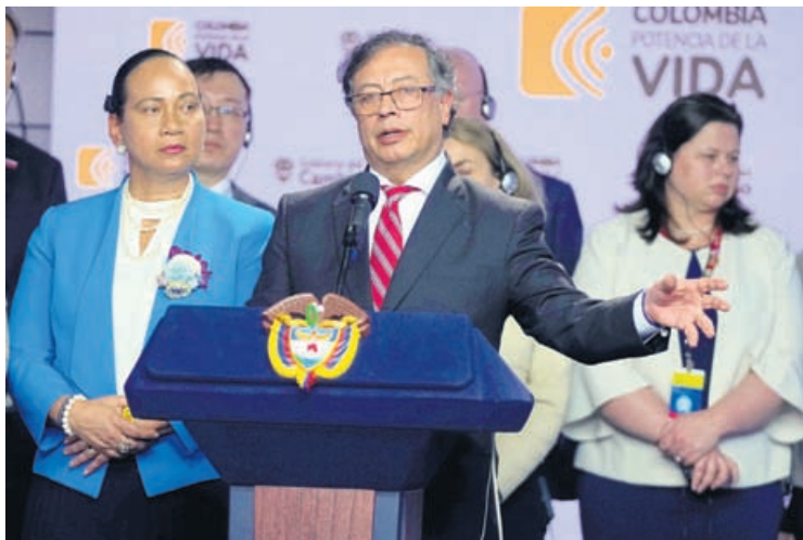
Colombia's President Gustavo Petro attends a press conference with members of UN Security Council after a meeting at the Presidential Palace in Bogota, Colombia, Thursday, Feb. 8, 2024.

Gustavo Petro on Sunday suspended a ceasefire with