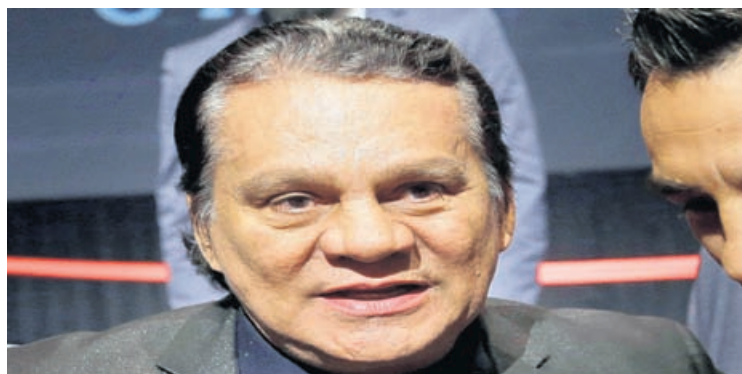
Boxing great Roberto Duran attends a news conference in New York, on Jan. 14, 2015.