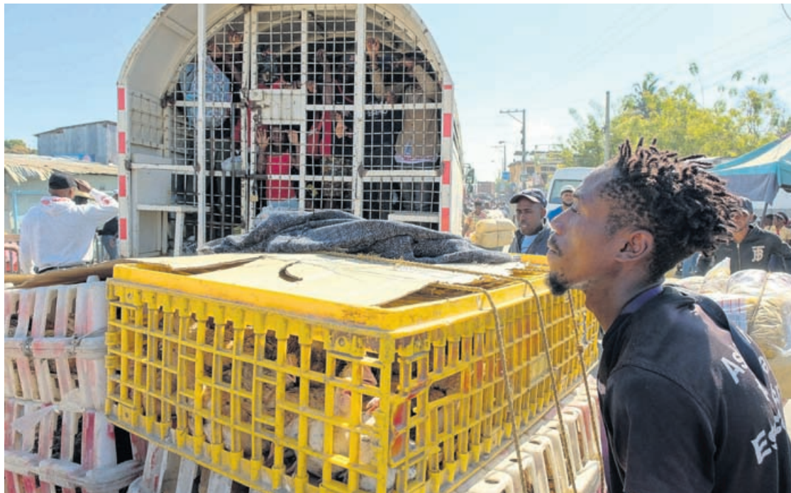
A vendor pushes crates of chickens past a police truck of people detained for deportation on the border bridge that connects Dajabon, Dominican Republic with Haiti, Monday, March 18, 2024.

An Associated Press photographer saw the bodies of at least 12 men strewn on the streets of Pétionville, located just below the mountainous communities of Laboule and Thomassin. Crowds began gathering around the victims. One was lying face up on the street surrounded by a scattered deck of cards and another found face down inside a pick-up truck known as a "tap-tap" that operates as a taxi. A woman at one of the scenes collapsed and had to be held by others after learning that a relative of hers