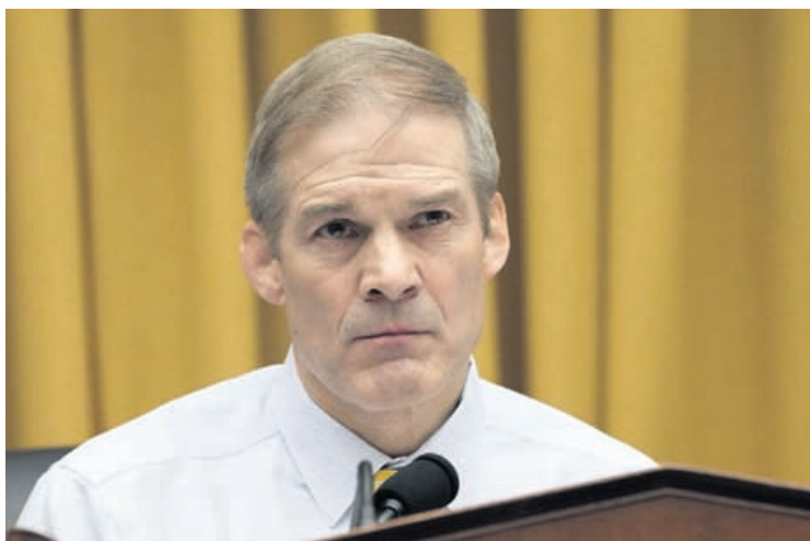
House Judiciary Committee Chair Rep. Jim Jordan, R-Ohio, listens during a House Judiciary Committee hearing with Department of Justice Special Counsel Robert Hur, Tuesday March 12, 2024, on Capitol Hill in Washington.

Free speech advocates said the court should use the case to draw an appropriate line between the government's acceptable use of the bully pulpit and coercive threats to free speech. □