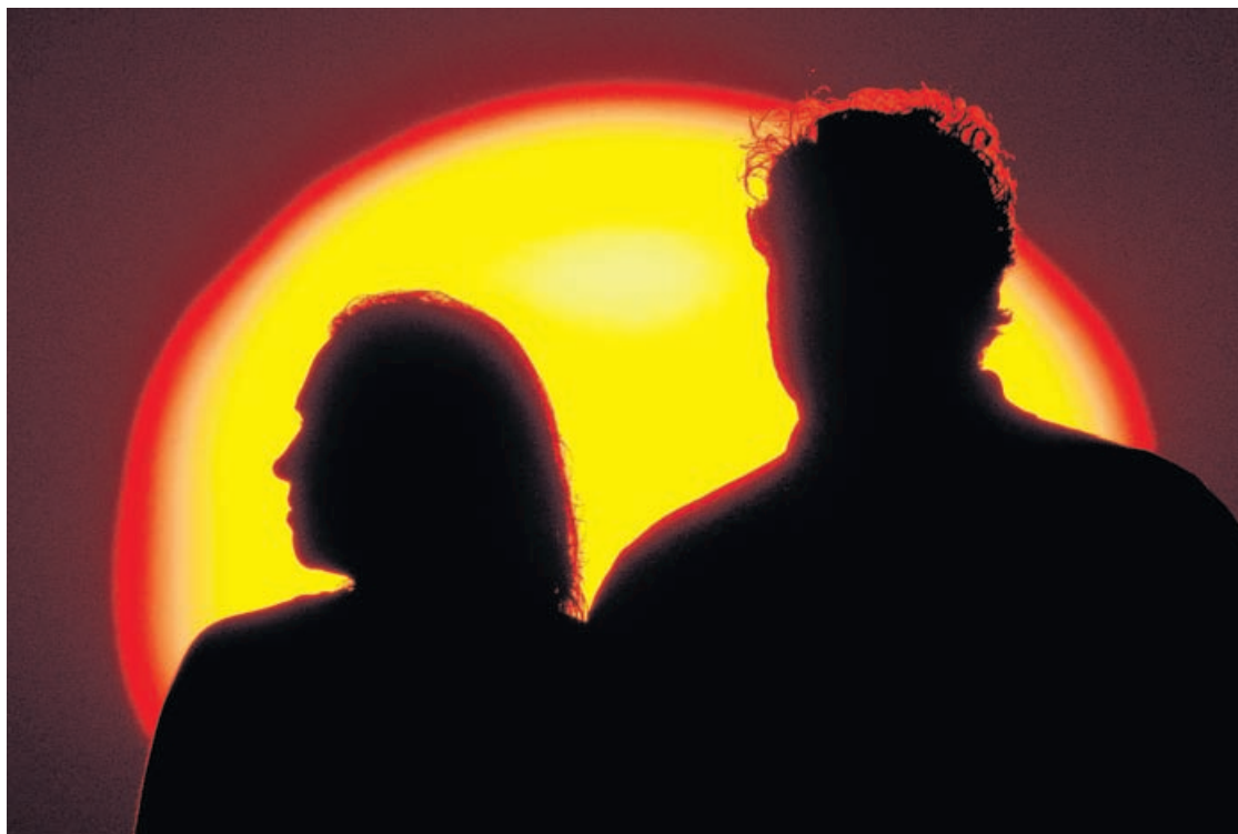
A couple watches the sun set from a park, July 10, 2021, in Kansas City, Mo.

Selling (and potentially downsizing ) your home and pocketing the equity is a good strategy in a market where you can make it work. This is easier in pricier housing areas, when you may be able to trade your high-value home for a smaller place in a more affordable market. Vanguard's analysis noted that relocators in California, for instance, were more successful at clearing equity in their homes than those in lower-priced markets like