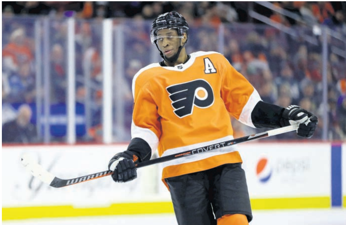
Philadelphia Flyers' Wayne Simmonds plays during an NHL hockey game against the St. Louis Blues, Monday, Jan. 7, 2019, in Philadelphia.

Simmonds was a finalist for the 2017-18 Mark Messier NHL Leadership Award and