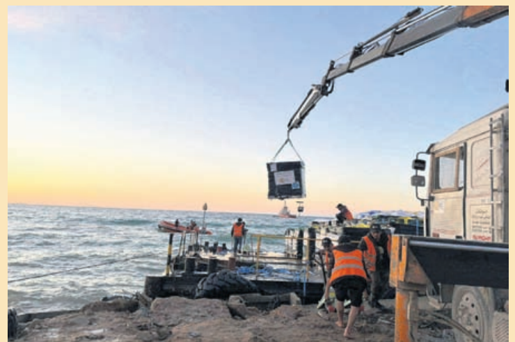
This photo provided by World Central Kitchen shows a crane unloading food packages over a makeshift port on the Gaza Strip, Saturday, March 16, 2024.

Israel fervently denies that its military campaign in Gaza amounts to a breach of the Genocide Convention. It acknowledged in its written response to South Africa's request that there are "also tragic and agonizing civilian casualties in this war. These realities are the painful result of intensive armed hostilities that Israel did not start and did not want."