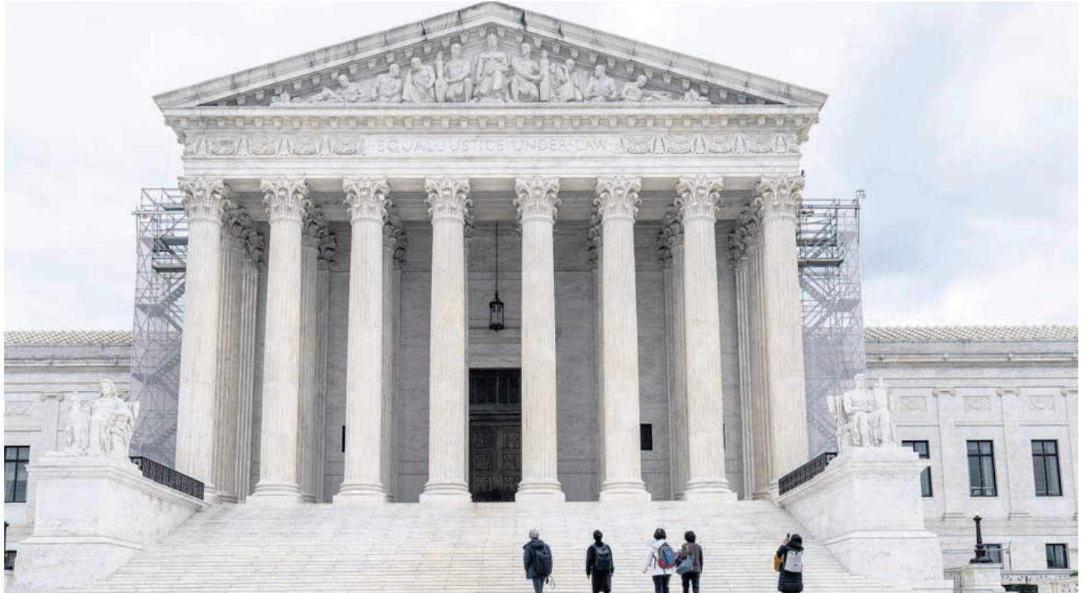
The Supreme Court is seen on Capitol Hill in Washington, March 4, 2024.

WASHINGTON (AP) — The Supreme Court seemed likely Monday to side with the Biden administration in a dispute with Republican-led states over how far the federal government can go to combat controversial social media posts on topics including COVID-19 and election security in a case that could set standards for free speech in the digital age. The justices seemed broadly skeptical during nearly two hours of arguments that a lawyer for Louisiana, Missouri and other parties presented accusing officials in the Democratic administration of leaning on the social media platforms to unconstitutionally squelch conservative points of view.